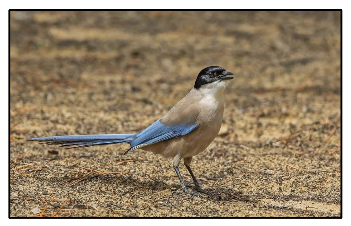
Iberian Magpie finally gave us fantastic views after teasing us throughout the early part of the tour.

A short stop at Rio Mondego-Ratoeira, a gorgeous section of river, gave us White Wagtail, Grey Wagtail, Common Waxbill, great views of three Common Buzzards, Little Grebe, Mallard, Grey Heron, Eurasian Magpie, Western Jackdaw, and Carrion Crow. Shortly before the river we again enjoyed wonderful views of Woodlark, this time in flight above the road, their beautiful song a joy for all to hear. While we watched these birds a Eurasian Sparrowhawk was seen briefly among the olive groves but disappeared quickly.