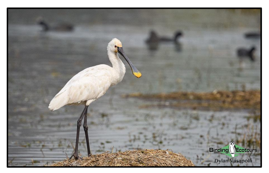
We were able to enjoy Eurasian Spoonbills along the Spanish border.

After our brief foray into Spain, it was time to return to Portugal. While driving we picked up a Great Egret at distance before reaching our next stop. As evening approached, we pulled into a farm track overlooking a vast grass field. In the distance the sound of Common Crane could be heard, and it wasn't long before 60 birds came down to roost on the hillside, giving lovely views in the evening sun. Shortly after, we were able to enjoy wonderful views of four Black-winged Kite . Despite being distant we had good views of them hunting as the sun set. Also present here were Northern Lapwing , Common Kestrel , Iberian Grey Shrike , Eurasian Skylark (singing distantly), Crested Lark , White Wagtail , Meadow Pipit , and Corn Bunting .