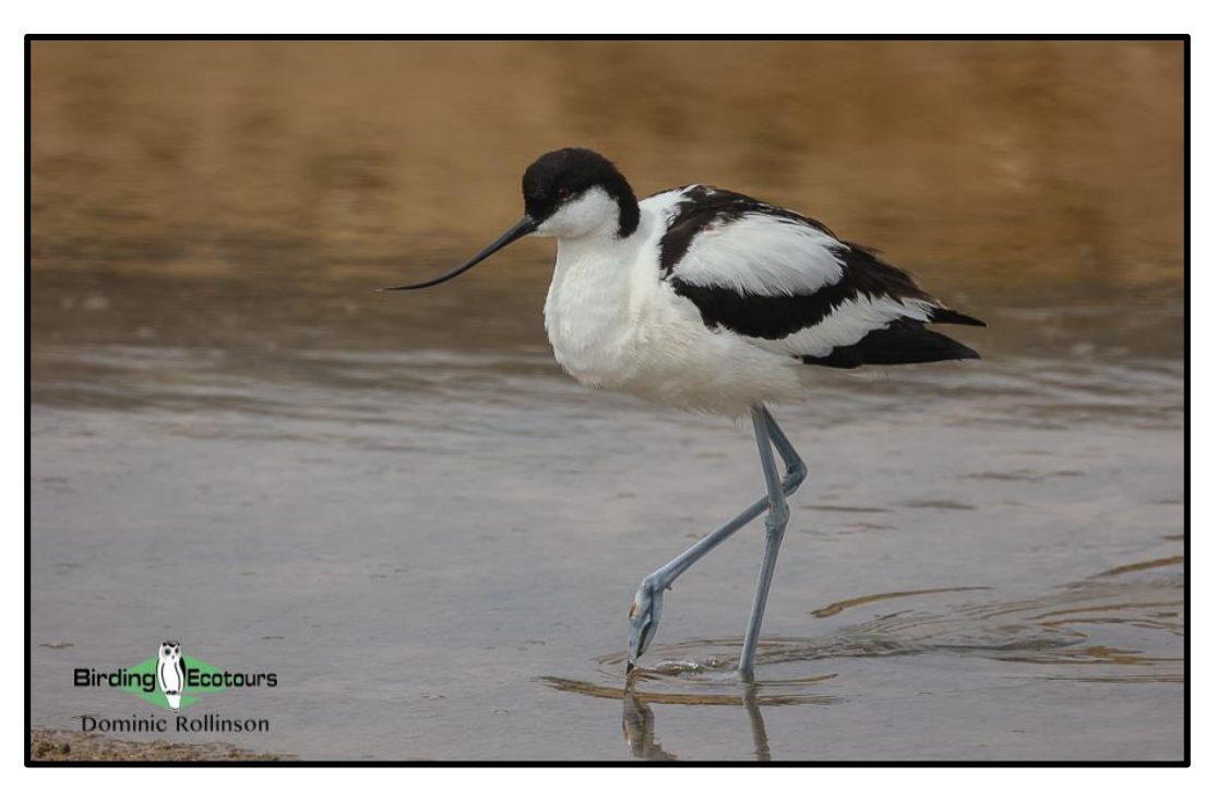
We enjoyed watching many shorebirds, including the stunning Pied Avocet .

Moving on we headed back into the agricultural areas towards the only real landmark in this open expanse, the stunning <u>Ermida de Nossa Senhora de Alcamé</u>. This attractive church was built for the farm workers of the area and stands proud above the flat scenery surrounding it. Here we would have a picnic lunch in the shade of the church as the day grew hotter. While lunch was generally quiet bird wise things changed as we were leaving. Soaring above us was a stunning pair of Bonelli's Eagle , a real star bird for the trip. We watched the pair until they moved away and out of view, a truly memorable experience with this magnificent raptor.