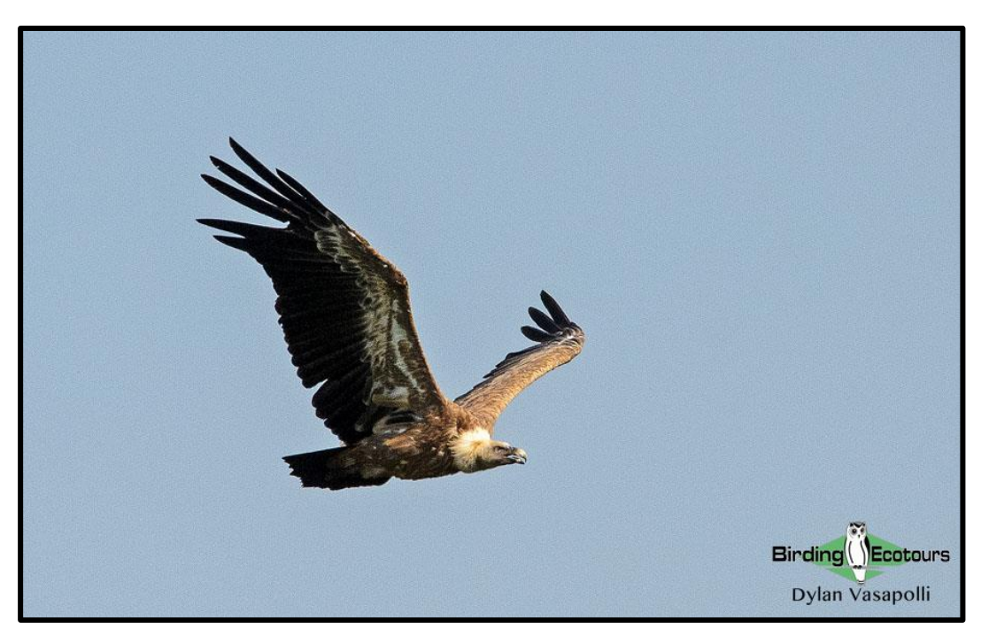
Our viewpoint allowed for excellent views of Griffon Vulture , a truly unique experience as we marveled at this giant bird.

Continuing our drive east we passed through the small village of Maçores. Here we found a colony of Eurasian Crag Martin , which gave excellent views. Continuing east we reached the border with Spain again and stopped for lunch at Miradouro de Penedo Durão. This incredible viewpoint enabled us to get close views of Griffon Vultures , with flight views from below and above achieved along with fantastic views of them perched on rocks in the valley below. Our only Peregrine Falcon of the tour gave a wonderful flyby while we were having lunch too, a nice bonus during our stop here.