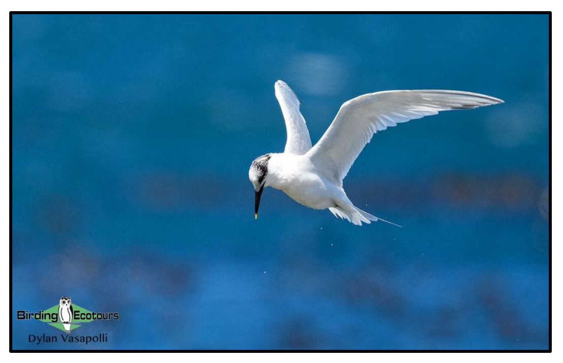
While exploring the Ria Formosa we had close views of Sandwich Tern.

The islets around the site were dotted with waterbirds like White Stork , Great Cormorant , Grey Heron , Little Egret , and Eurasian Spoonbill . We also enjoyed the wonderful sight of a large group of Greater Flamingos flying along the coast. Despite the distance their pink sheen was still clear to see. A Western Osprey also put on a fantastic show towards the end of our boat tour.