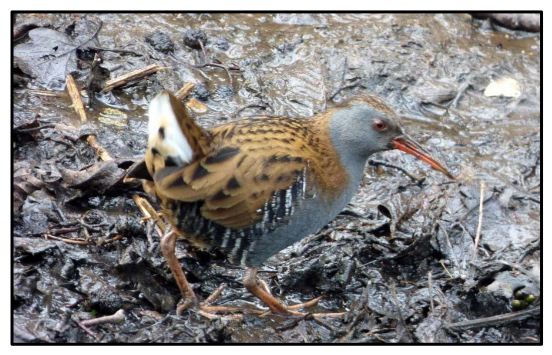
The group enjoyed fantastic views of the often-secretive Water Rail

With the sun getting lower in the sky, we retreated towards our hotel. A brief stop at the saltpans near the hotel gave a wonderful spectacle of around 200 Greater Flamingos feeding on one of the pans. These were joined by Sanderling, Mediterranean Gull, Yellow-legged Gull, Eurasian Magpie, European Stonechat, and our first Spanish Sparrow of the tour.