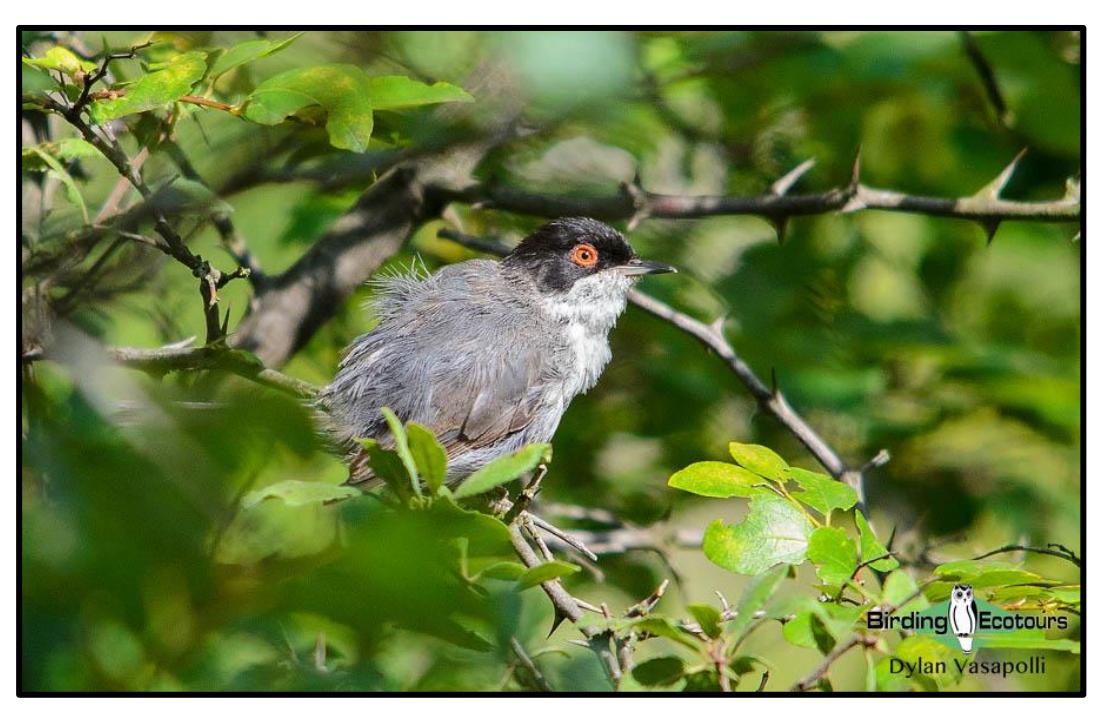
We came across plenty of the beautiful Sardinian Warbler!

Today we took the mountain roads east to the border with <u>Spain</u> as we explored the Douro Valley. However, the day started with thick and unseasonal fog. In this early gloom some of the group heard the distant song of a Eurasian Golden Oriole in the valley below. This was a very unexpected but welcome surprise, given the time of the year. Around the hotel we were able to record Sardinian Warbler , Spotless Starling , Common Blackbird , European Robin , Black Redstart , Eurasian Tree Sparrow , House Sparrow , White Wagtail , and European Goldfinch .