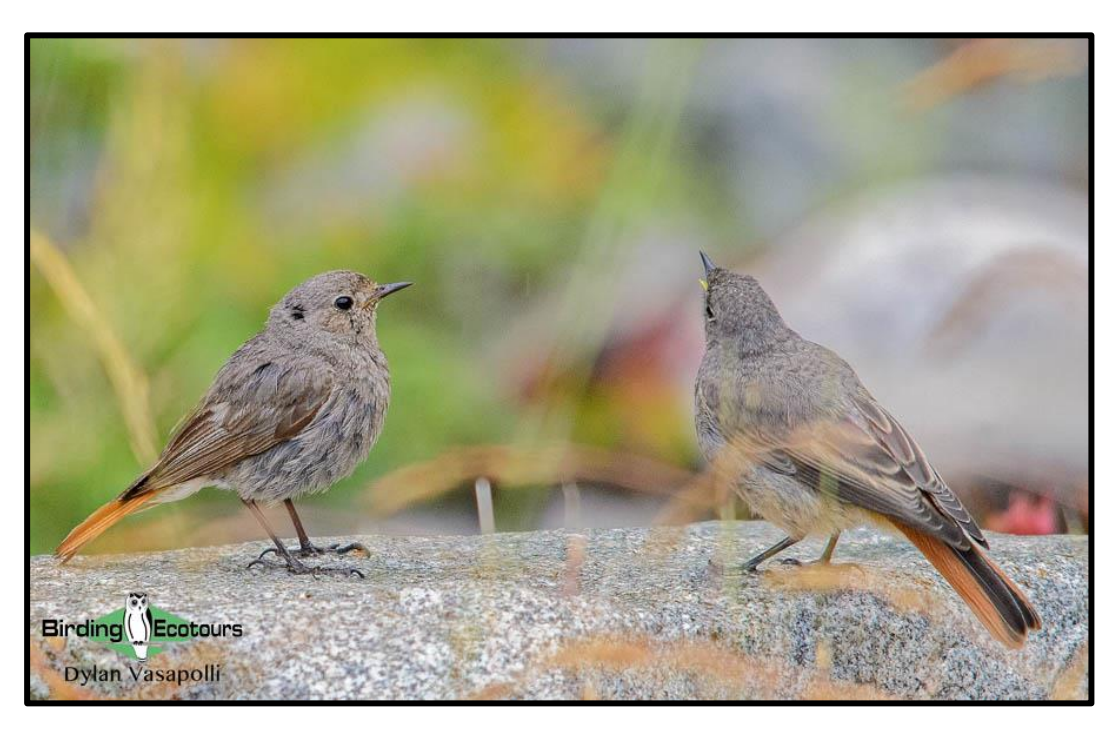
Black Redstart was ever present during our tour, occupying a variety of habitats.

Our short walk around this urban green space gave us Egyptian Goose, Mallard, Common Wood Pigeon, Common Moorhen, Eurasian Coot, Little Grebe, around 35 Yellow-legged Gulls of various ages, Great Cormorant, Eurasian Jay, Eurasian Magpie, Coal Tit, Great Tit, Common Firecrest, Goldcrest, Eurasian Wren, a briefly heard Short-toed Treecreeper, Common Blackbird, Spotted Flycatcher, European Robin, and European Pied Flycatcher.