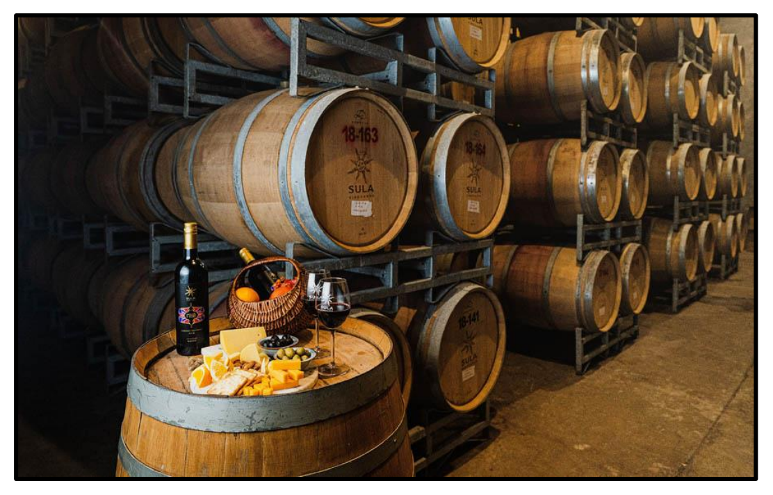
Our visit to Monte da Casteleja was enjoyed by the whole group, who got to sample some tasty wines.

After a quick scan of the nearby fields and trees, which gave us Meadow Pipit , European Stonechat , European Robin , Sardinian Warbler , and a flyover Iberian Magpie , we left the site to head to our next wine tasting experience at <u>Monte da Casteleja</u>.