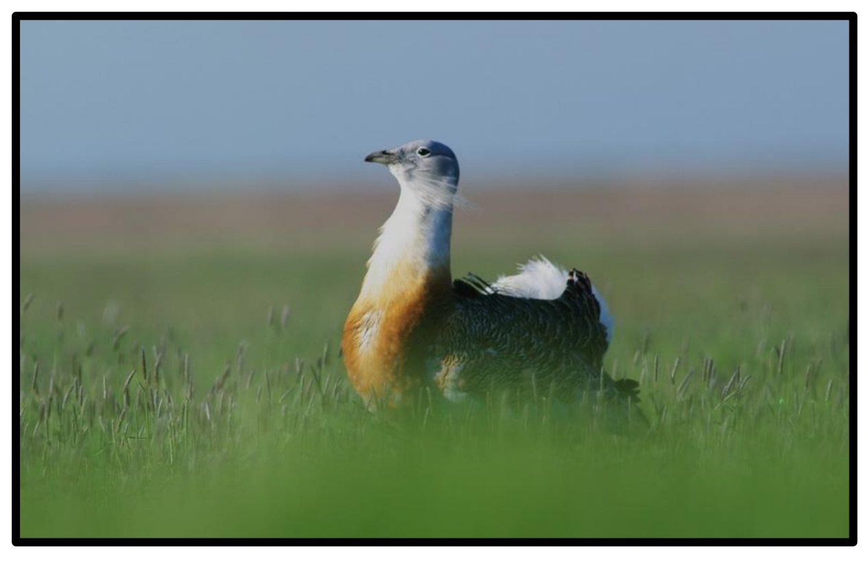
The plains of the Alentejo gave us an incredible experience as we watched a flock of the majestic Great Bustard , one of many highlight birds on this fun tour.