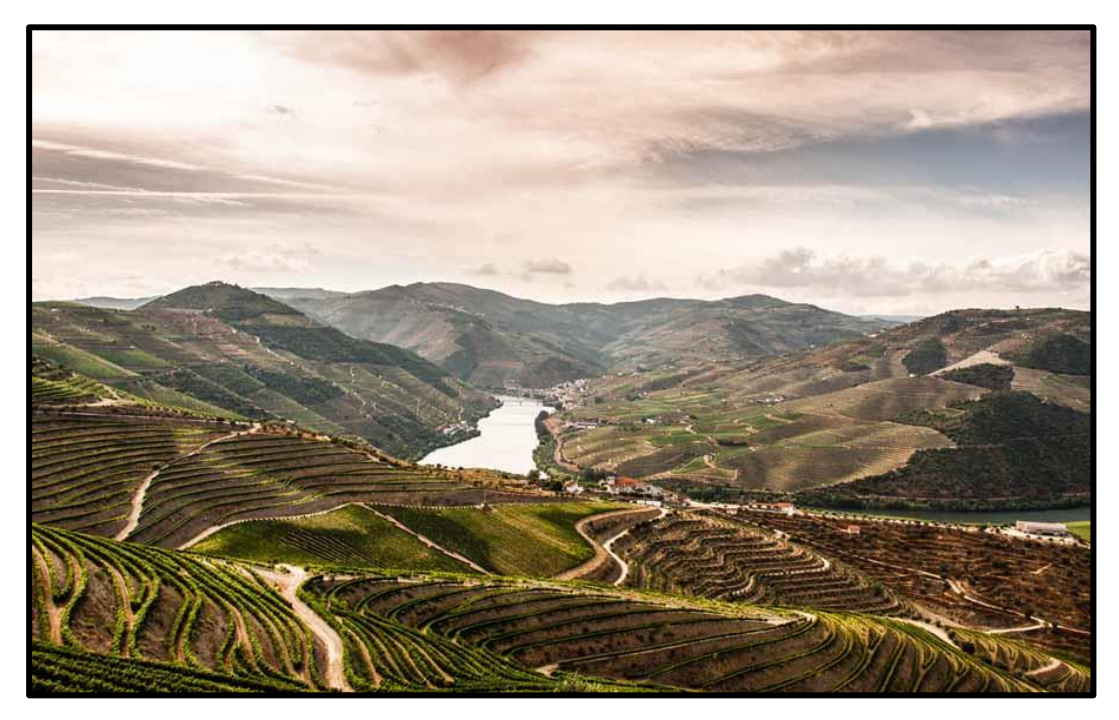
The beautiful vineyards of the Douro Valley.

A total of 145 bird species were recorded during the tour (three of these were "heard only"), along with a few other interesting animals, including European Pond Turtle , Granada (Iberian) Hare , European Rabbit , Red Fox , and European Fiddler Crab . Species lists are at the end of this report. We enjoyed wine tasting at five gorgeous vineyards, visited numerous impressive cultural sites, and soaked in some staggering landscapes.