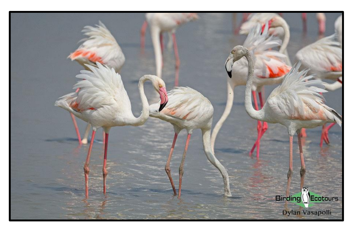
We enjoyed a truly special moment with a vast flock of Greater Flamingo.