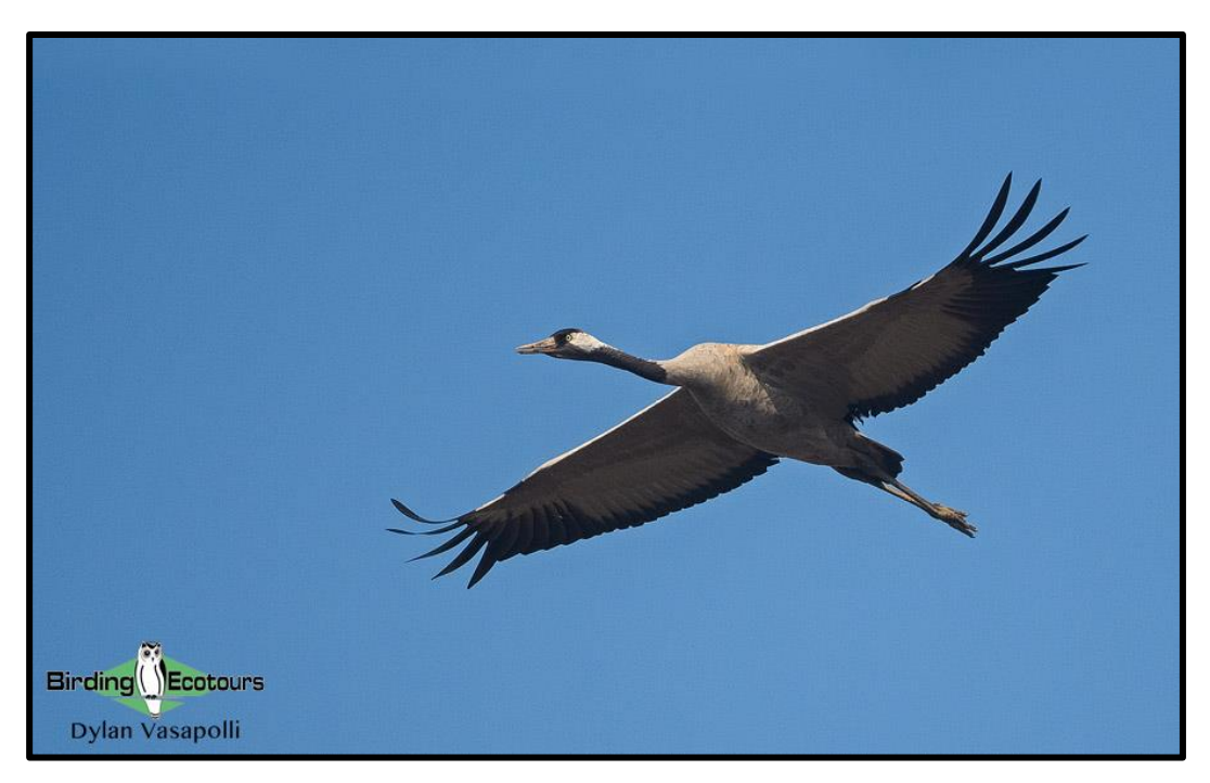
Common Cranes provided us with exciting moments several times throughout our tour.

For lunch we decided to visit a hermitage high up on a hill which overlooked the plains. The shade here made for a fantastic spot to escape the heat of the day. After packing our lunch away, we made our way back down the large hill, where shortly after a simply incredible 20-minutes of birding ensued. First, from a field close to the track, a breathtaking flock of eleven Great Bustards took flight, disappearing behind farm buildings close by. The shock of seeing these rare birds so well was soon increased as they appeared again on a nearby mound and gave outstanding prolonged views, a real big target for the whole group was successfully secured! As we watched the bustards, another Northern Wheatear performed well, as did an Iberian Grey Shrike . As the last of the bustards disappeared behind a hill a stunning male Hen Harrier cruised over the field close to our van, giving wonderful views of its ghostly figure.