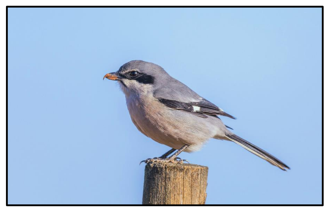
The beautiful Iberian Grey Shrike gave us prolonged and close views.