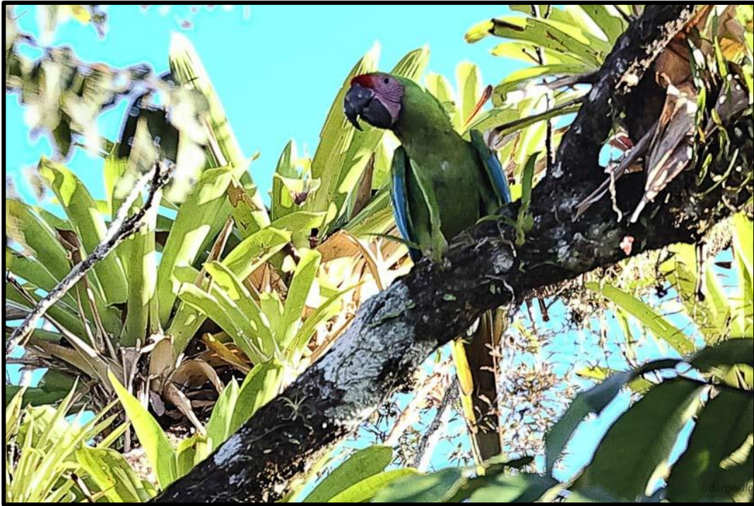
Great Green Macaw was a real treat in the Caribbean foothills.

After some fun at Puerto de Sarapiquí we returned to the van, and headed to El Tapir (ex-Butterfly house) and found an unfortunate surprise that the place is now closed to visitors, a great shame. We spent a couple of minutes here before moving on, enough to add some new birds to the trip list, such as Violet-headed Hummingbird , a female Crowned Woodnymph , and a male Green Thorntail . There was, unfortunately, no sign of the Snowcap here. On the way to our restaurant for lunch we stopped along the road as we had a very nice Laughing Falcon perched nearby, with great light for photo opportunities. After lunch, we drove into the mountains and directly to San Gerardo de Dota in the Cordillera de Salamanca, to stay at the comfortable Savegre Lodge for three nights.