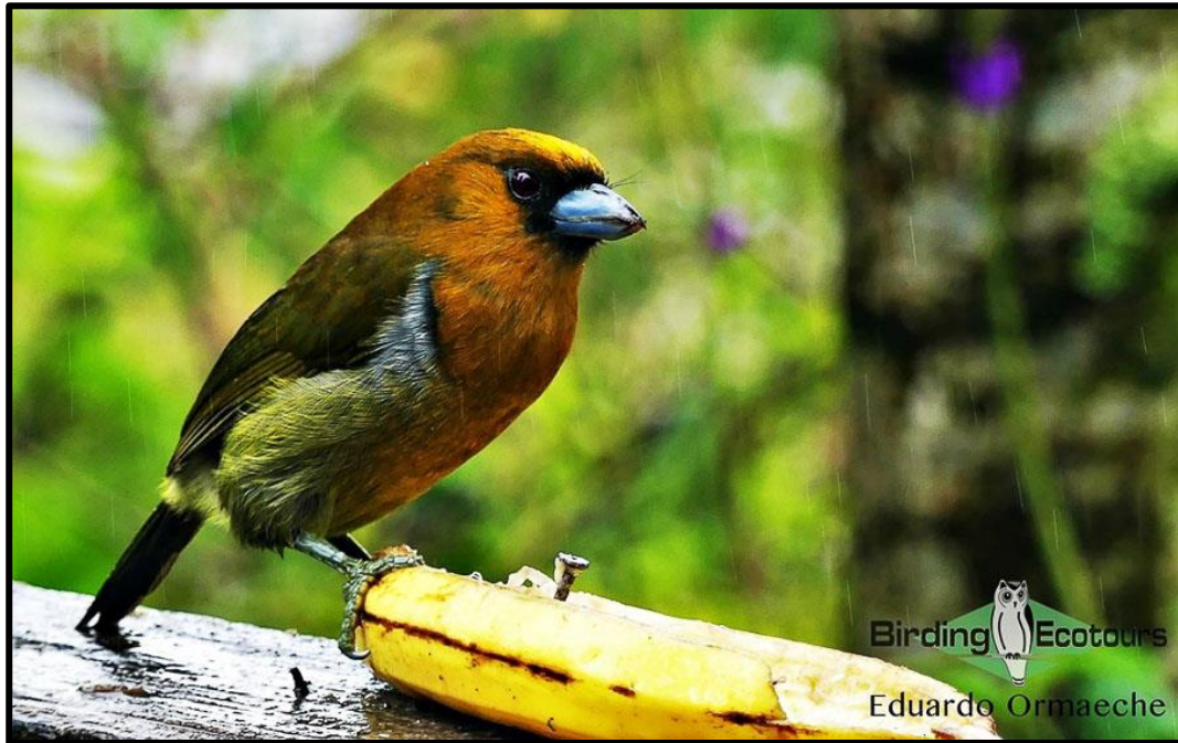
Prong-billed Barbet gave excellent close-up views at the wonderful Cinchona feeders.

eye level, providing high quality views! The hummingbird feeders provided new birds such as Black-bellied Hummingbird and White-bellied Mountaingem (seen and photographed by a single client only).