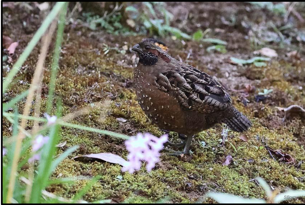
Spotted Wood Quail seen at Savegre Lodge.

For the last day of the tour, we decided to walk around Savegre Lodge grounds, to pick up some birds we had missed on previous days. We started the day with Sulphur-winged Parakeet flying above the lodge, we actually had scope views of these on previous days, but one never tires of seeing parakeets. We also saw Western Osprey and Red-tailed Hawk . The great surprise came with views of a pair American Dippers on the river at the entrance to the lodge. Thanks to Luis who did well to spot this species. We did some birding along the roadside and found Stripe-tailed Hummingbird and another Resplendent Quetzal , it was amazing to find a male without looking for it or waiting for it – just pure luck. Other birds included Brown-capped Vireo , Mountain Elaenia , Yellow-winged Vireo , Slaty Flowerpiercer , Long-tailed Silky-flycatcher , Acorn Woodpecker , and a glimpse of Black-faced Solitaire (better than the heard only from the previous day, just!). We returned to the lodge where we had views of more Stripe-tailed Hummingbirds and Scintillant Hummingbirds .