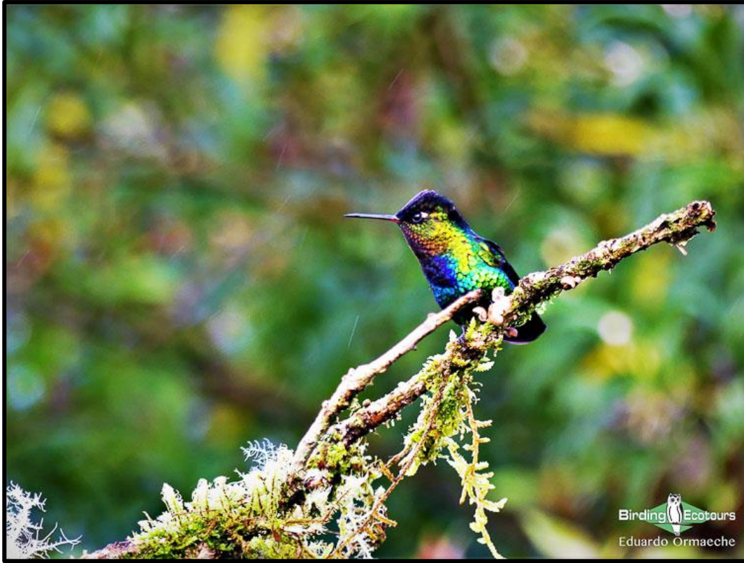
Fiery-throated Hummingbird is one of the many hummingbirds seen on this trip.