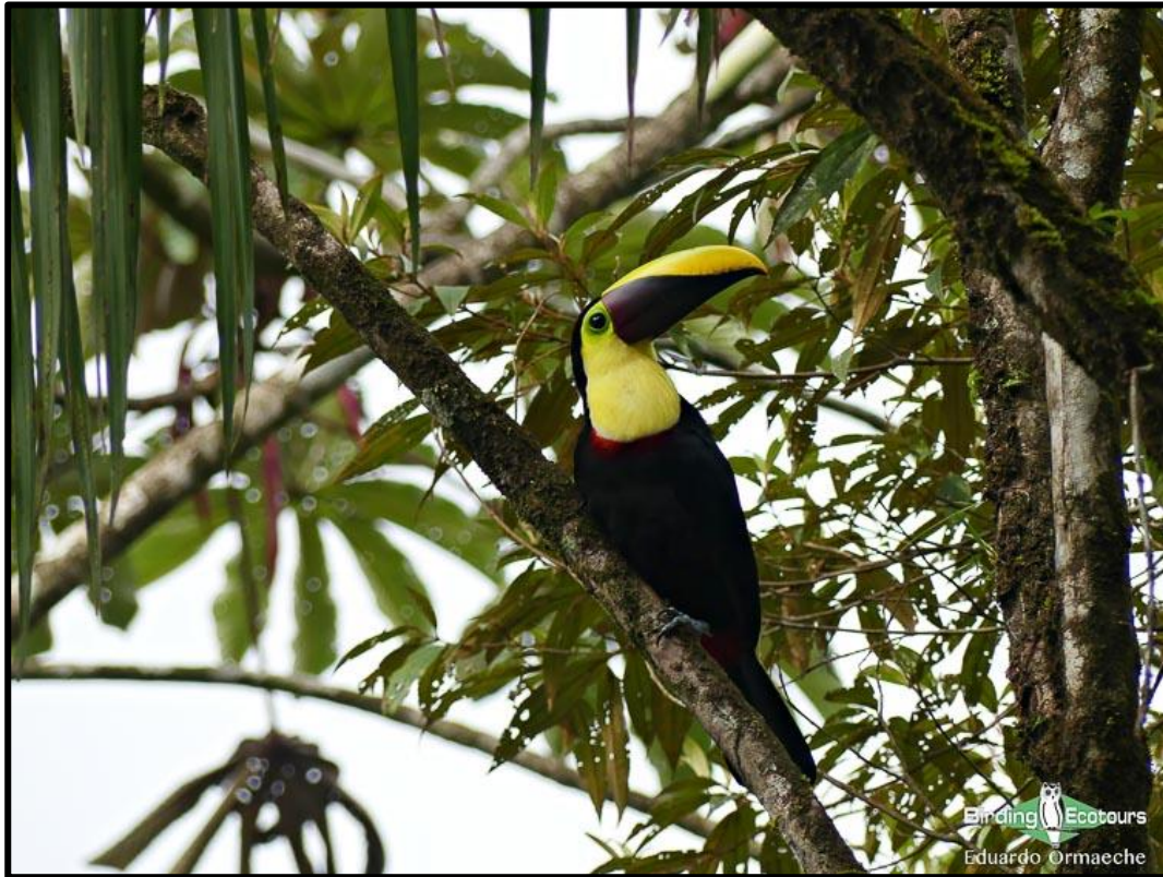
Yellow-throated Toucan was one of the highlights in the Caribbean foothills.

species such as Song Wren , Slaty-breasted Tinamou , and Northern Schiffornis were heard only.