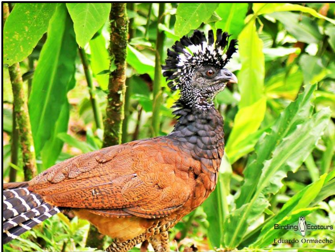
Two female Great Curassows showed well at La Selva Biological Station, here's one of them.

The afternoon was quieter than the morning, as usual, but we still got some good birds such as White-tipped Dove , Broad-winged Hawk , Rufous-winged Woodpecker , White-collared Manakin , Black-crowned Tityra , Olive-backed Euphonia , Scarlet-rumped Cacique , and great views of two female Great Curassows . We spent some time looking for the yellow morph of the Eyelash (Pit) Viper , which is often seen at La Selva, and we managed to find one after some time looking for it.