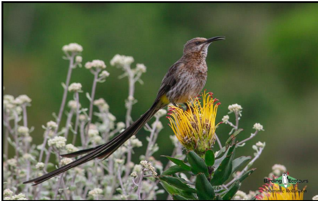
Cape Sugarbird, a Cape fynbos endemic.

This 1-day Mountain and Fynbos birding tour will give you a chance to see some of the Cape's best scenery while taking in a number of its top birds, including Cape-fynbos endemics like Cape Rockjumper , Orange-breasted Sunbird , Cape Sugarbird , Cape Siskin , and Victorin's Warbler . The Cape's unique fynbos (one of the world's six floristic kingdoms ) has an amazing diversity of endemic plant species and because of this several bird species are endemic to the fynbos. This Cape Town birding tour targets many of these Cape endemics and takes in some spectacular scenery along the way. We recommend this Mountain and Fynbos birding tour if you are after some of the Cape's charismatic and better-known endemic bird species, in particular Cape Rockjumper and Cape Sugarbird .