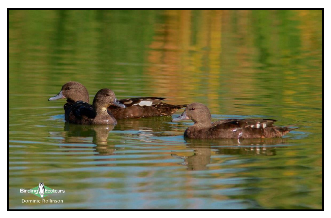
African Black Duck can be seen at Shongweni Dam.

Sitting at a slightly higher altitude, Shongweni Resources Reserve offers a different mix of species to the previous destination. Shongweni Dam is surrounded by thick forest and bushveld where some of the following may be observed; Crowned and Trumpeter Hornbills, Southern and Black-crowned Tchagra, Red-throated Wryneck, Black Cuckooshrike, Narina Trogon, Grey and Swee Waxbills as well as four species of bushshrikes (Olive, Orange-breasted, Grey-headed and Gorgeous). Along the edge of the dam we will keep a look out for Giant Kingfisher, Mountain Wagtail, African Black Duck and Black Stork.