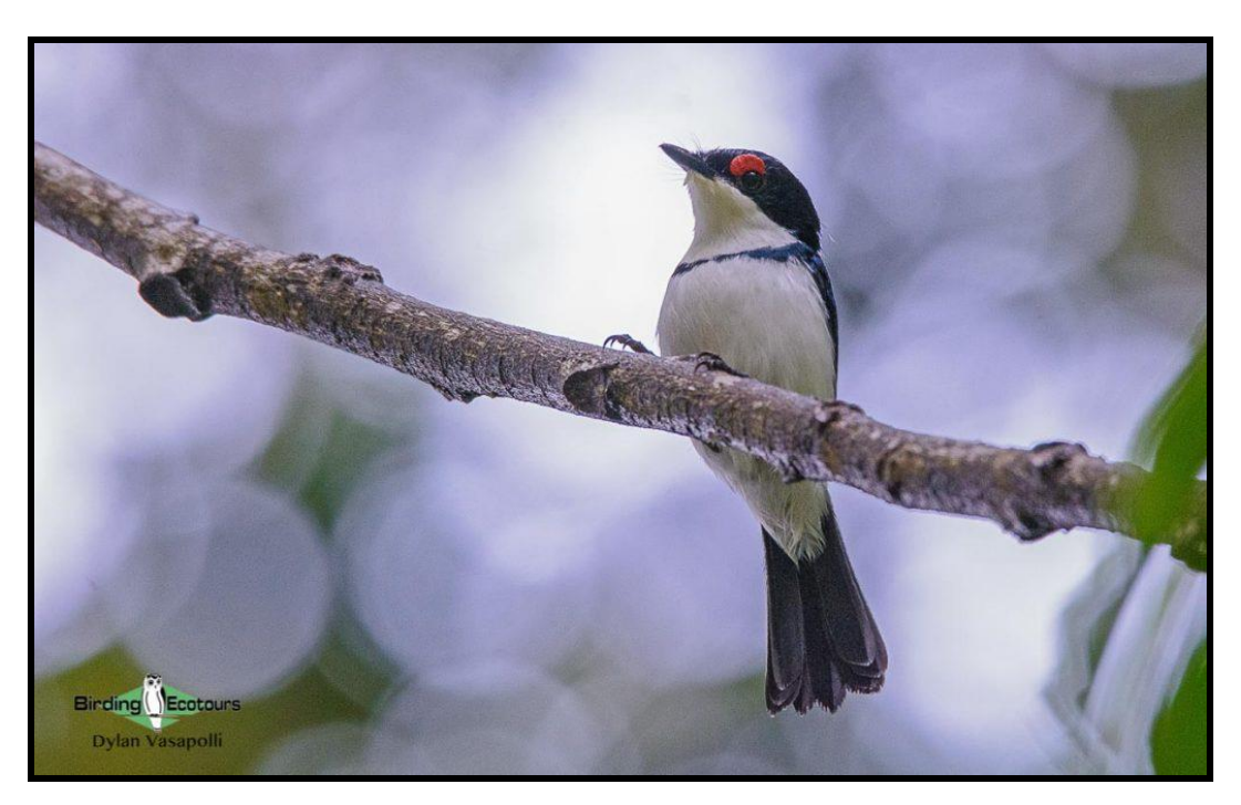
Black-throated Wattle-eye can be seen in the coastal forest near Stanger.

Purple Swamphen, African Rail and African Marsh Harrier. In the surrounding reedbeds we may come across Southern Brown-throated and Eastern Golden Weaver, Rufous-winged Cisticola and Sedge Warbler. During summer the place comes alive with migrants including Bailon's Crake and Spotted Crakes, Western Yellow Wagtail, and Lesser Moorhen. In the surrounding scrub and grasslands Fan-tailed Widowbird, Black-throated Wattle-eye, Kurrichane Thrush, Red-capped Robin-Chat and Woolly-necked Stork may all be seen.