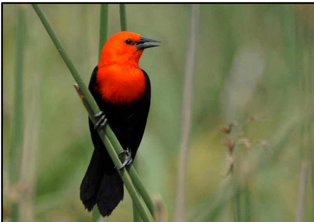
Birding the Iberá Marshlands may produce sightings of the beautiful Scarlet-headed Blackbird.

Overnight: Estancia San Juan Poriahú, Ituzaingó