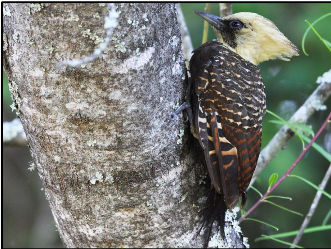
The large and impressive Blond-crested Woodpecker