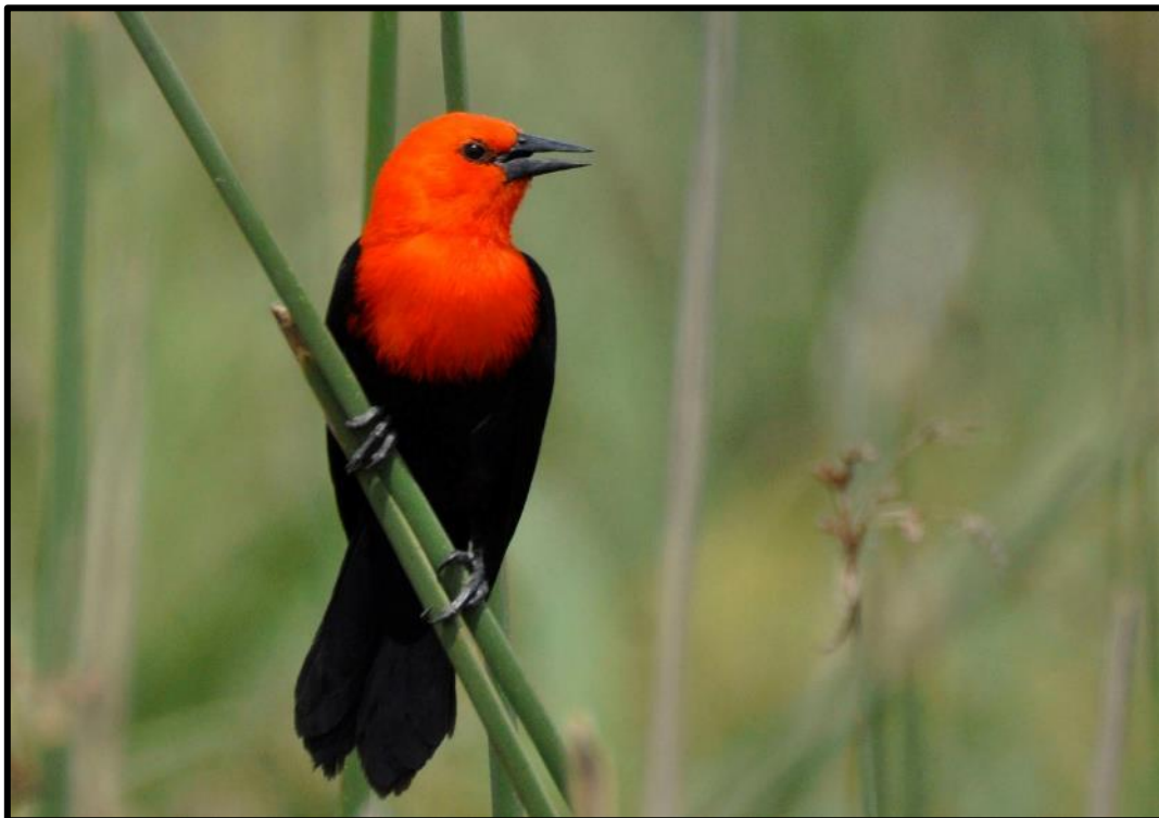
Birding the Iberá Marshlands may produce sightings of the beautiful Scarlet-headed Blackbird.

Overnight: Estancia San Juan Poriahú, Ituzaingó