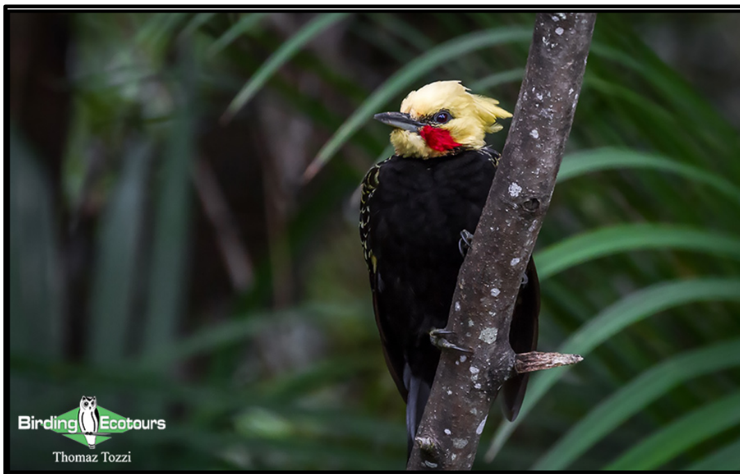
The large and impressive Blond-crested Woodpecker .