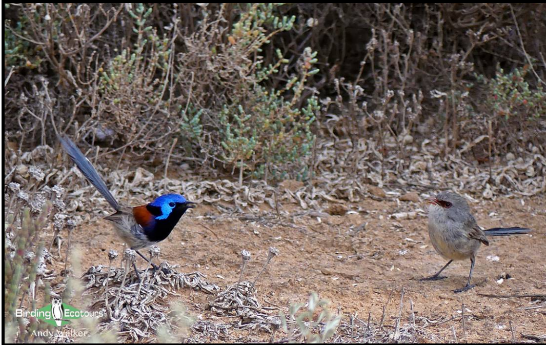
A spectacular male Purple-backed Fairywren displays to a rather drab female.