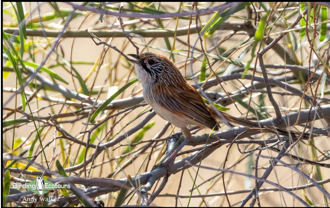
The rare and localized Rufous Grasswren will be a target around Uluru.