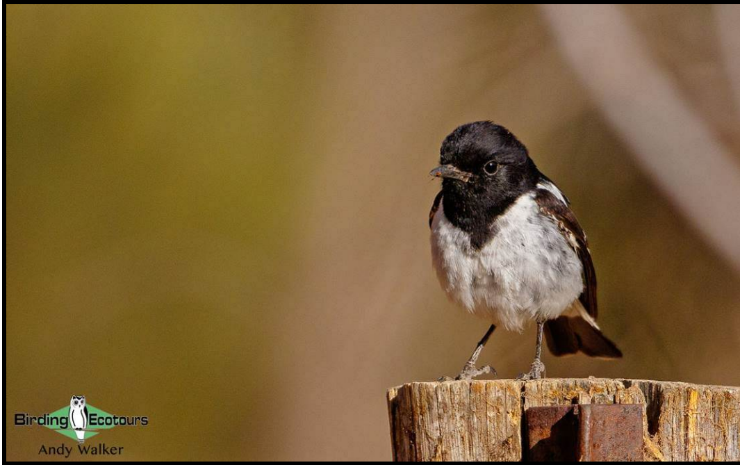
Hooded Robin is a delightful bird, and we should find this as we bird our way around Alice Springs.