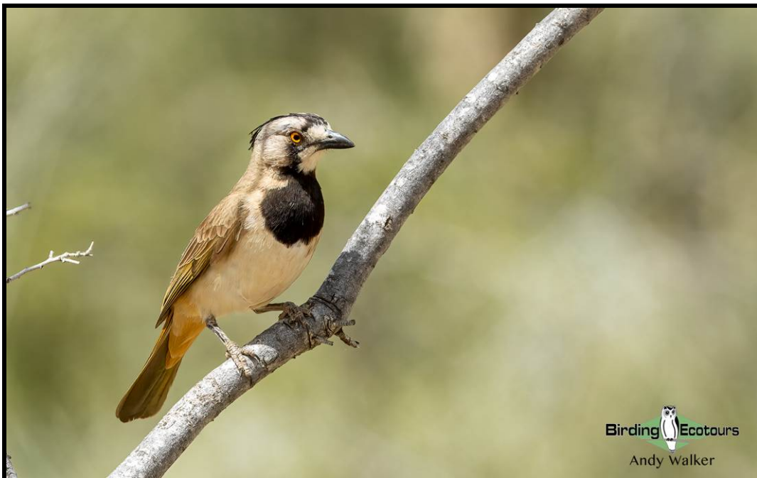
The song of Crested Bellbird is spectacular as it rings out through the desert.

We will also venture out from the city into the ‘desert’ areas too, where we will look for some different and highly sought-after species such as Rufous-crowned Emu-wren , Spinifexbird ,