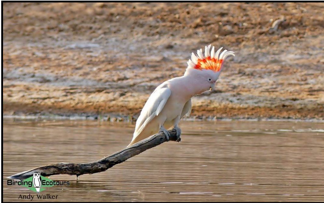
In a country blessed with a myriad of stunning parrots, Pink Cockatoo (formerly Major Mitchell's Cockatoo) takes some beating!