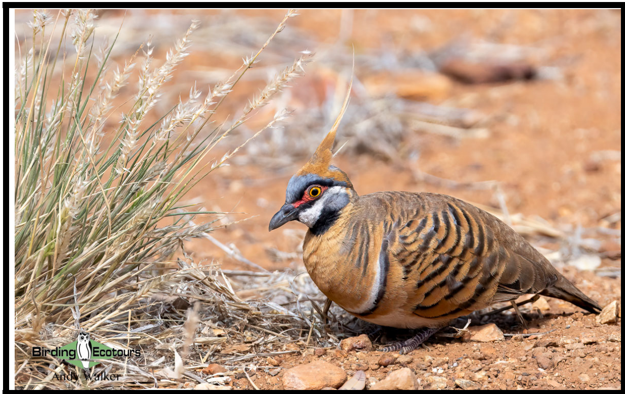
The striking Spinifex Pigeon is one of our targets on this trip.