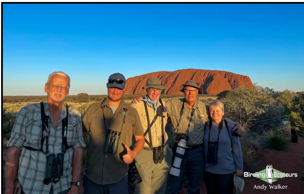
The sight of Uluru as the sun sets is absolutely spectacular and a tour highlight in its own right.