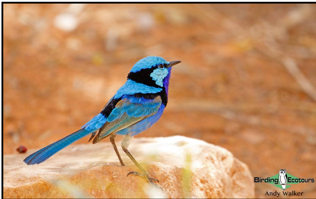
Splendid Fairywren is one of many spectacular species found around Alice Springs.

As with all our other tours this is a small-group tour. The majority of our tour will be based in Alice Springs, though we will also venture further afield to base ourselves near Uluru so we are well placed to enjoy this important feature. We will have a wide range of target birds while here, and will focus on the region's specials such as Spinifex Pigeon, Spinifexbird, Rufous-crowned Emu-wren, Dusky Grasswren, Rufous Grasswren, Banded Whiteface, Grey Honeyeater, Western Bowerbird, Black-breasted Buzzard, Diamond Dove, Grey-headed Honeyeater, Black Honeyeater, Pied Honeyeater, Slaty-backed Thornbill, White-backed Swallow, Crested Bellbird, Black-eared Cuckoo, Budgerigar, Bourke's Parrot, Mulga Parrot, Red-tailed Black Cockatoo, Spotted Harrier, Little Eagle, Wedge-tailed Eagle, Purple-backed Fairywren, Splendid Fairywren, White-winged Fairywren, Red-browed Pardalote, and Painted Finch.