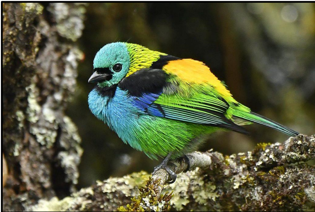
The stunning Green-headed Tanager can be found around Iguazu.