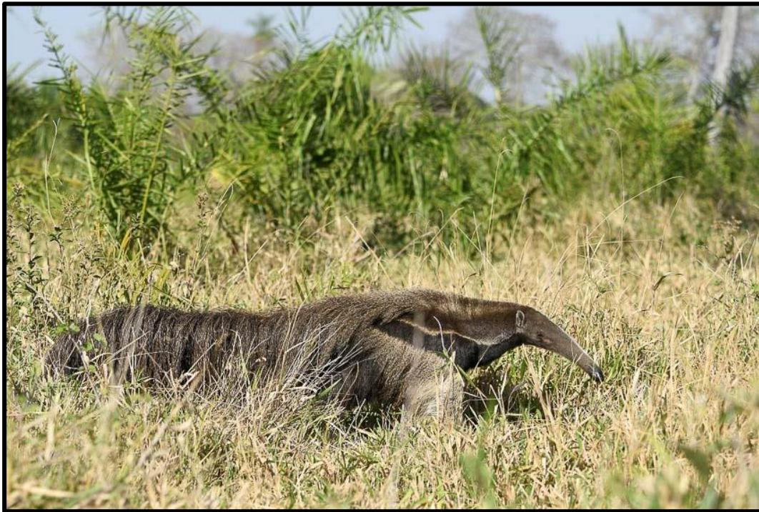
Piuval Lodge is a great place to see Giant Anteater.

Greenish Schiffornis, Rufous Gnateater, Dusky-tailed Antbird, and the most-wanted Black-fronted Piping Guan.