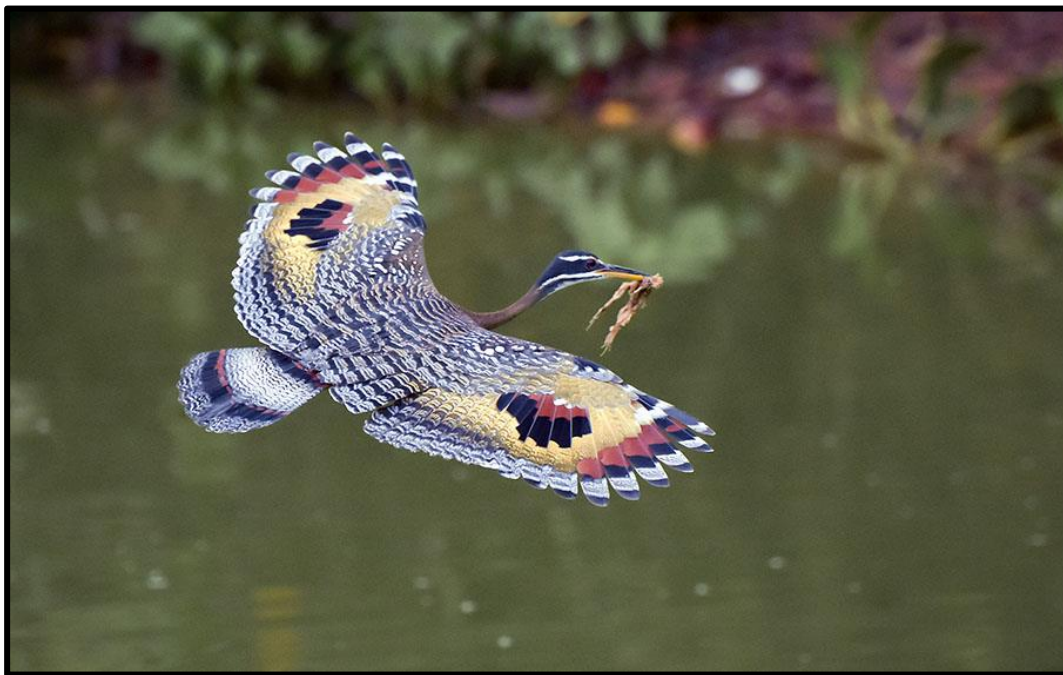
Sunbittern is one of the neotropic's most wanted birds.

We shall have one last morning in the Chapada area where we would try for the Helmeted Manakin plus other birds we might have missed on previous days. Later we shall start our drive towards Pocone in the Pantanal. During the drive is possible to find species such as Greater Rhea, Red-legged Seriema, Crested Caracara, Toco Toucan, Cattle Tyrant, and White-tailed Hawk .