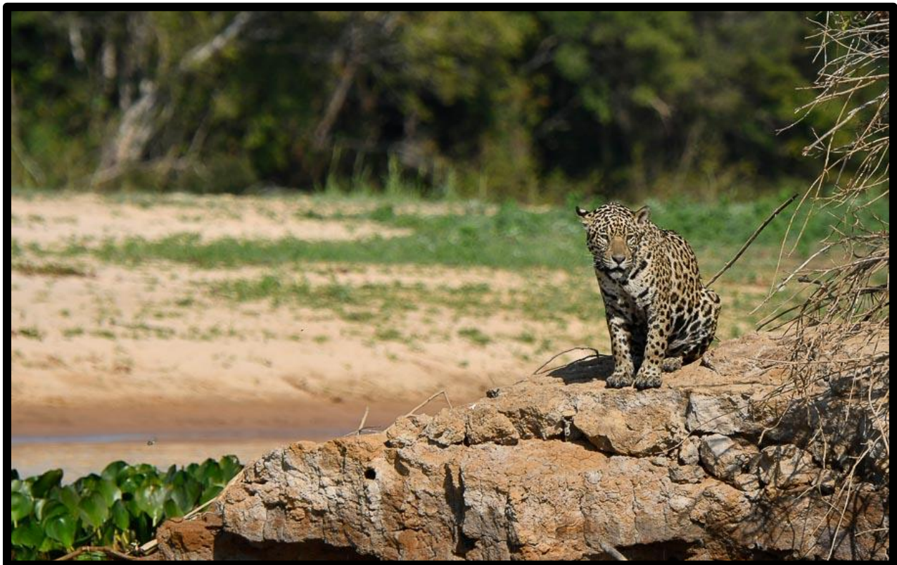
Jaguar is a top target of this fantastic tour.