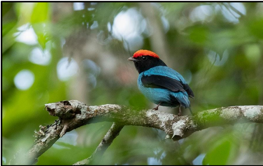
Blue Manakin is another highlight from the Atlantic Forest.