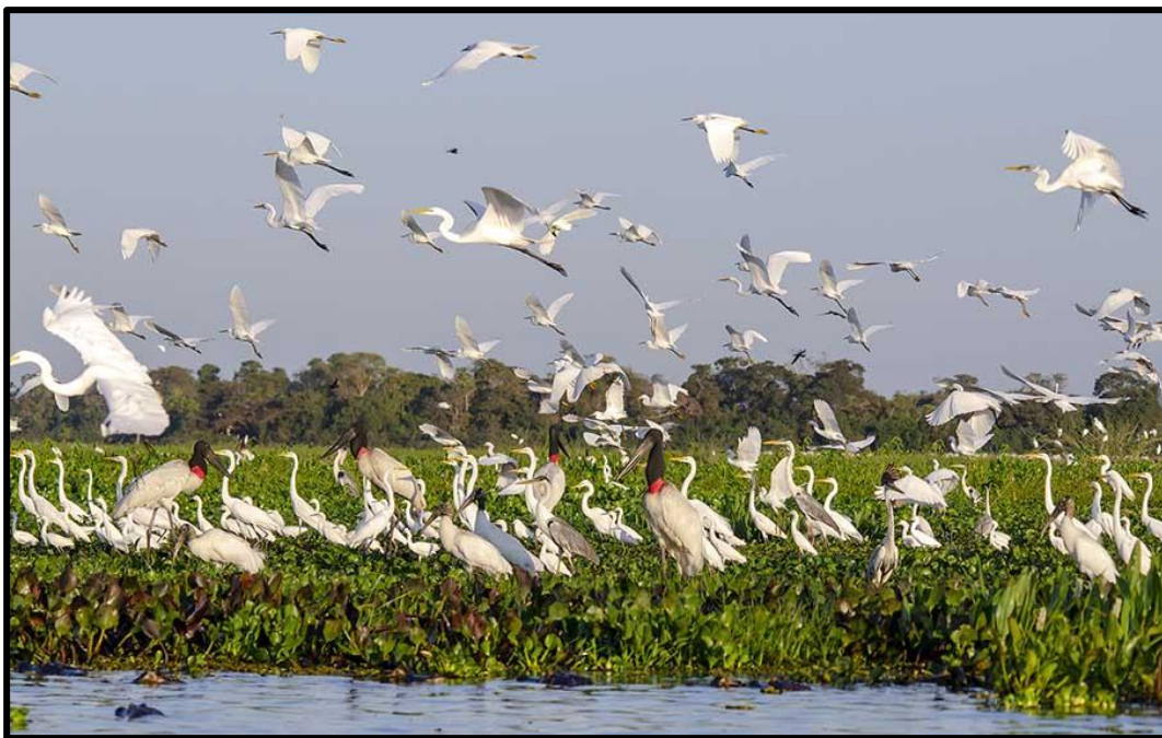
A feast for the eyes in the Pantanal.