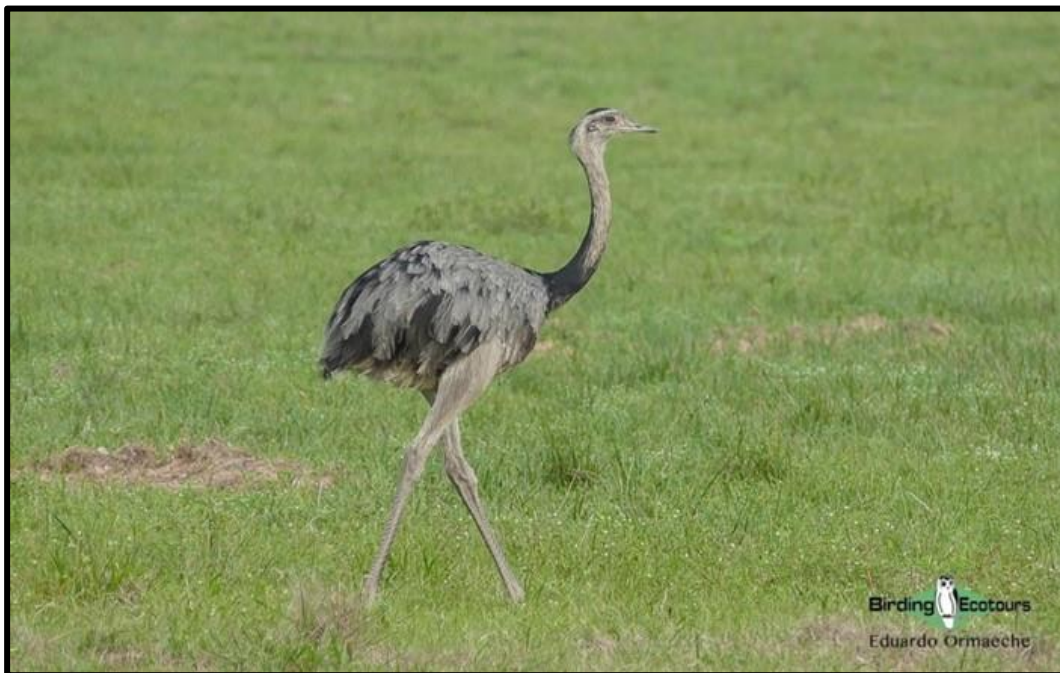
Greater Rhea is commonly seen in the Pantanal and the Cerrado.