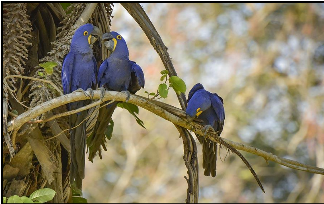
Hyacinth Macaws are always a fan-favorite in the Pantanal.

We will embark on our birding and mammal adventure by exploring the Pantanal, a vast, seasonally flooded wetland, renowned for its incredible concentrations of birds at the end of the dry season. We schedule this tour during this season, when the fish trapped in the shrinking pools of water attract hordes of herons, egrets, storks, and other wetland species. The star of these huge concentrations is the massive Jabiru , towering over a diverse collection of shorter South American waterbirds, such as Sunbittern , Plumbeous , Bare-faced , Green , and Buff-necked Ibises , Grey-cowled Wood Rail and Southern Screamer . There is normally a large diversity of raptors around too, with Snail Kite , Black-collared , Savannah and Crane Hawks regularly encountered. Our river trips provide the opportunity to look for species such as Capped Heron , Sungrebe , the striking Agami Heron , Anhinga and a plethora of kingfishers including Green , Amazon , Ringed , American Pygmy and Green-and-rufous . Other target species include Band-tailed Antbird and, with some luck, the seldom-seen Zigzag Heron . These boat trips also provide the best chances to see Endangered (IUCN) Giant (River) Otters , the largest otter in the world and one of the 'Big Five' South American mammals. This is also the best place on the planet for seeing Jaguar and during the dry season sightings are almost guaranteed. This humongous cat shines brightly as a star of the show on this tour.