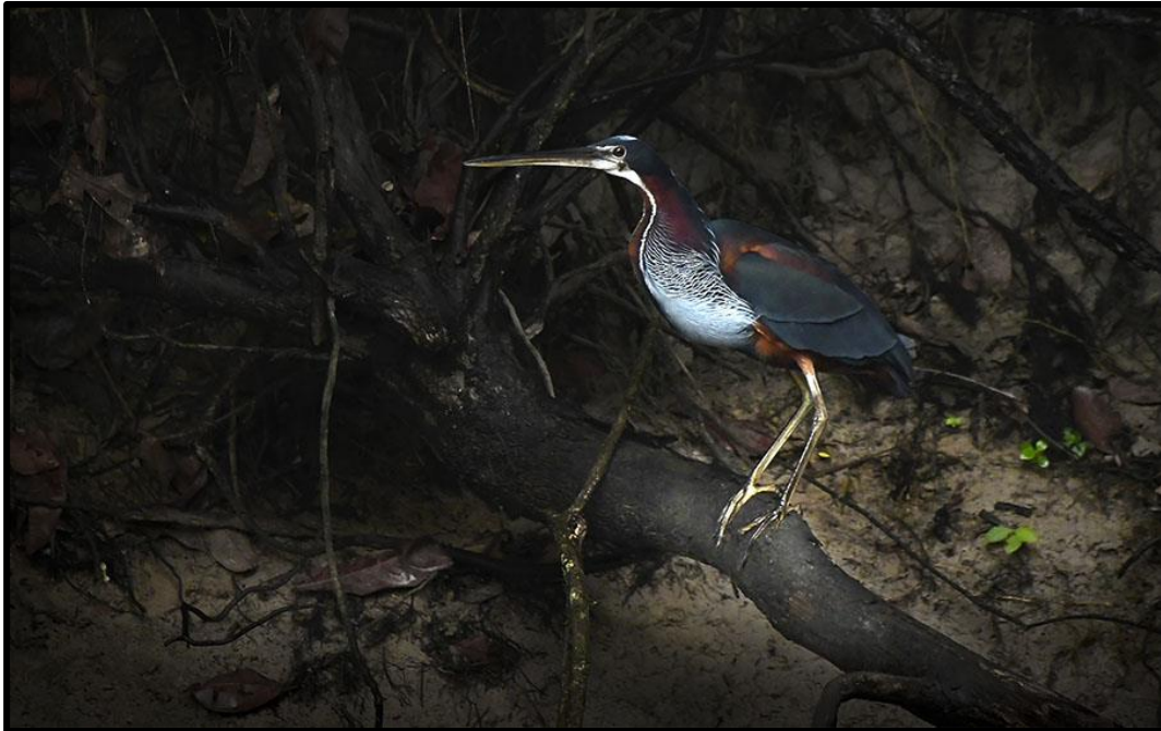
The elusive Agami Heron can be seen in the Pantanal.