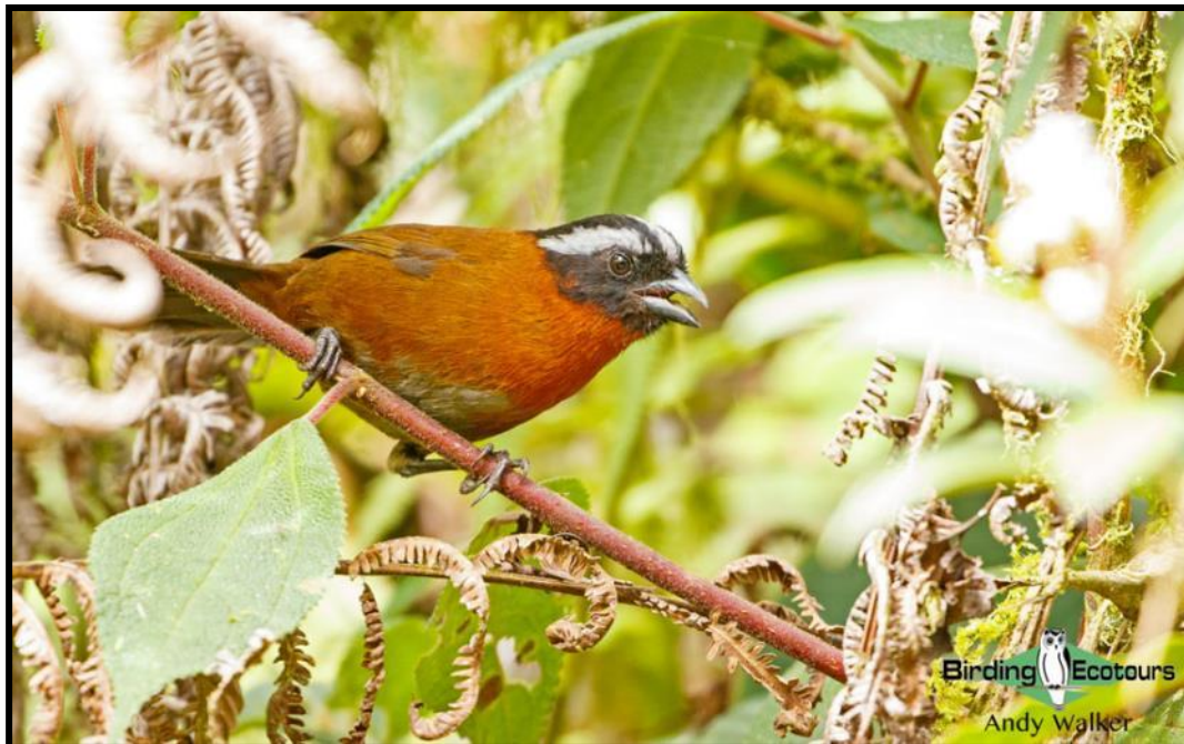
Tanager Finch will be searched for in the ProAves Yellow-eared Parrot Reserve.

We will then leave Medellín and head towards the picturesque town of Jardín in the southwest region of Antioquia, which will be our base from which to explore the ProAves Yellow-eared Parrot Reserve to look for our main target, the Endangered (BirdLife International) Yellow-eared Parrot . Other target species in the area include Tanager Finch , Chami Antpitta (recently split from the Rufous Antpitta complex), Purplish-mantled Tanager , Chestnut-breasted Chlorophonia , and with luck Ocellated Tapaculo and Chestnut-crested Cotinga .