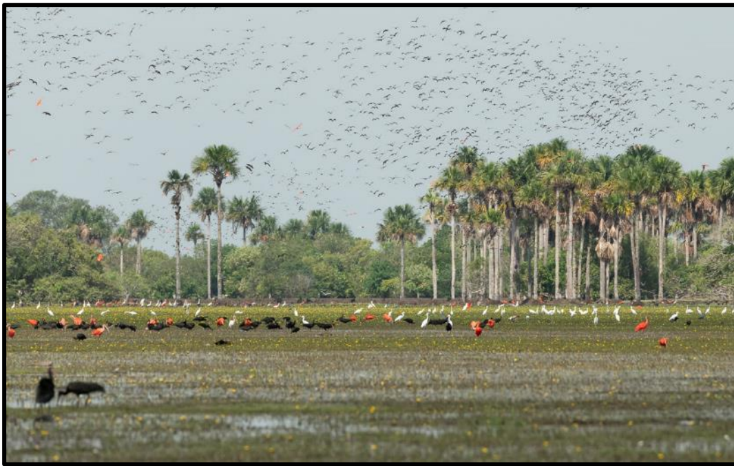
We will find large congregations of waterbirds while in Los Llanos.

Los Llanos are vast tropical grassland plains nourished by the waters of the Orinoco River . This habitat represents an amazing bird and wildlife refuge in northwestern South America. It is reminiscent of the Pantanal in Brazil, due to its high density of aquatic bird species. It was a popular destination among birdwatchers and nature lovers visiting Venezuela in previous decades, but due to the current political and social situation in the country, Venezuela is less popular to visit. The good news, however, is that you can still visit Los Llanos and not miss this incredible habitat, shared by only Colombia and Venezuela.