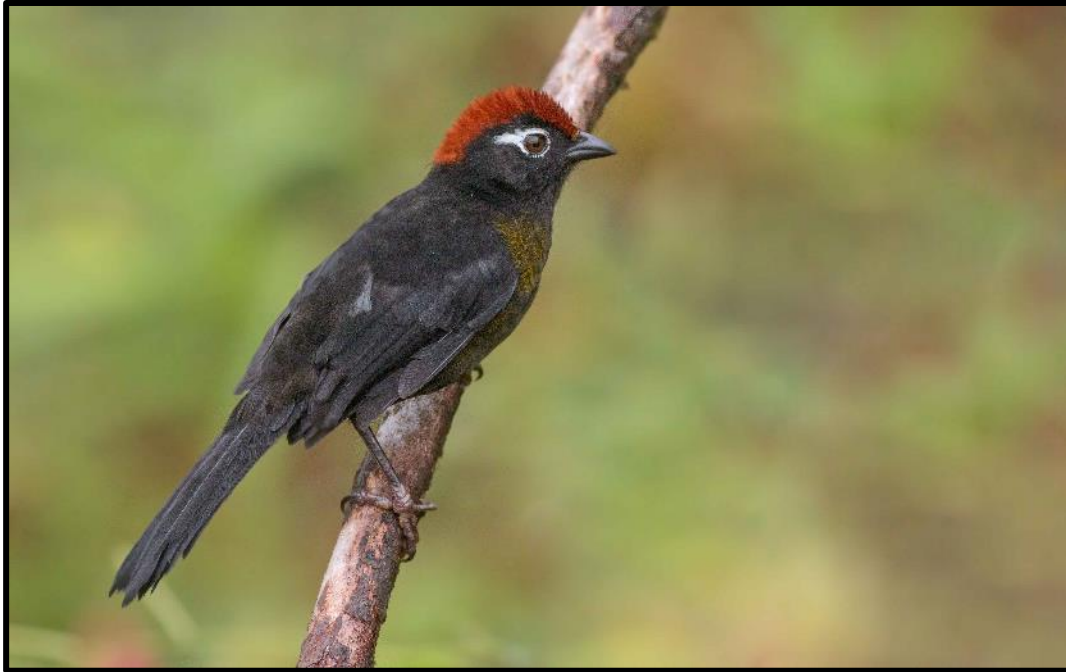
We'll look for the rare White-rimmed Brushfinch along the Trampoline Road.