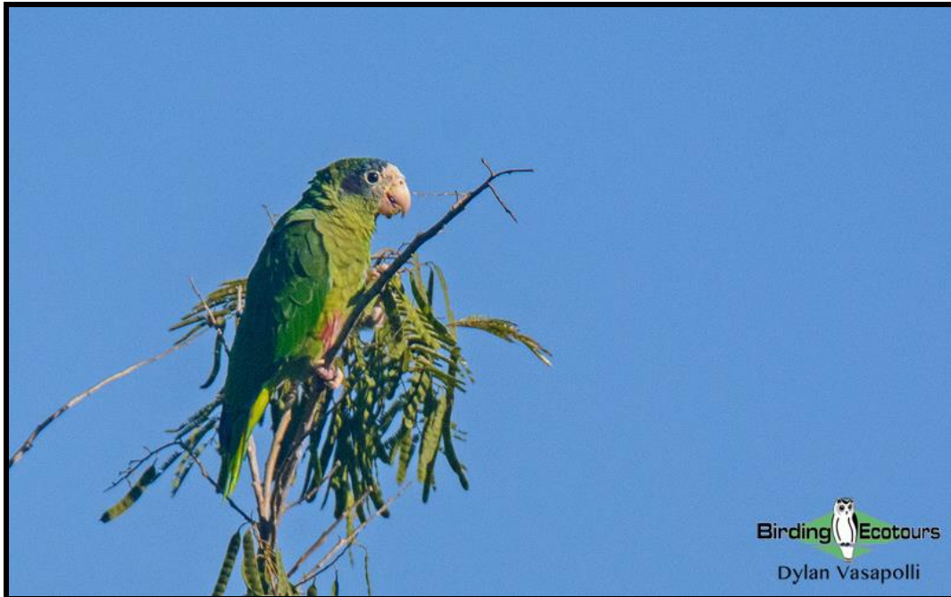
Hispaniolan Amazon is one of the targets on this tour.

Being the second-largest country in the Caribbean, after Cuba , the habitat found throughout the country is diverse and varies from dry scrub to high-altitudinal forest (recalling the cloudforests of the Neotropics ) to humid lowland forest, with many wetlands and marshes present in between. This results in a wealth of birdlife, and 30 species are endemic and confined to the island of Hispaniola, and all but one are readily accessible in the Dominican Republic, with only a single Hispaniolan endemic species being confined to Haiti, which makes up the rest of Hispaniola and is located on the western side of the island. Besides the 30 Hispaniolan endemics, many more species occurring here are found solely in the Greater Antilles , and yet more widespread species are only readily accessible within the Dominican Republic, making this a crucial must-visit destination for any world birder.