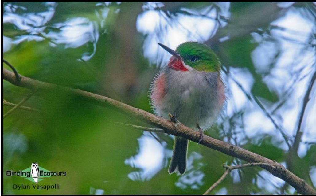
Narrow-billed Tody — another tody we hope to find on this tour.

The pine forests are home to the scarce Hispaniolan Crossbill and Pine Warbler . As we begin descending from the Zapotén sector we will keep an eye out for the rare Golden Swallow , now sadly almost certainly extinct in Jamaica, along with Loggerhead Kingbird . There is a Northern Potoo stakeout along the road, and we are occasionally treated to day views of this bird. Lower down the road, in the foothills, the habitat changes to drier, broad-leaved forest, and here we will search for arguably the country's most difficult endemic, Bay-breasted Cuckoo . This rare and sadly declining species is notoriously difficult to find, and we would count ourselves lucky to see it. Flat-billed Vireo also occurs in this area and is normally a bit easier to find. The agricultural lands on the outskirts of Puerto Escondido are good to search for Hispaniolan Oriole , Greater Antillean Grackle , and occasional flocks of Antillean Siskins , while they also play host to other widespread species such as Common Ground Dove , Smooth-billed Ani , Burrowing Owl , American Kestrel , Olive-throated Parakeet , Northern Mockingbird , and Yellow-faced Grassquit . Our afternoon will be spent birding locally, such as on the Rabo de Gato trail or on the outskirts of Puerto Escondido, or at leisure for those who want a break.