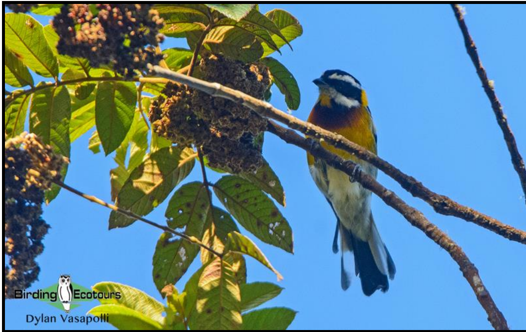
The attractive Hispaniolan Spindalis

billed Vireo , the declining Golden Swallow , Rufous-throated Solitaire , the rare and highly prized La Selle Thrush , Hispaniolan Crossbill , Antillean Euphonia , both Western and Eastern Chat-Tanagers , and the taxonomically odd Green-tailed and White-winged Warblers , along with Hispaniolan Spindalis and Hispaniolan Oriole . The national bird of the country, Palmchat , resides in a family of its own and is another true icon and one of our main targets, fortunately easily seen throughout the country.