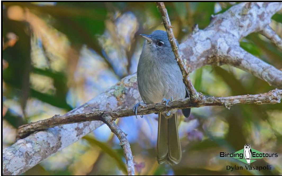
The taxonomically odd Green-tailed Warbler

Overnight: Hodelpa Caribe Colonial , Santo Domingo