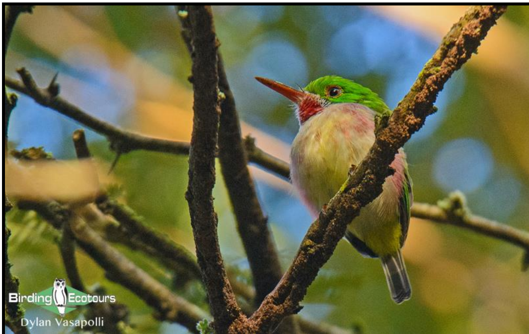
The cute Broad-billed Tody can be seen at the National Botanical Garden.

We will begin our day by visiting the excellent National Botanical Garden located in this sprawling city, where we will spend most of the morning. This garden will give us the perfect start to the tour, allowing us to get familiar with some of the birds and indeed families of this bird-rich Caribbean nation, along with targeting a few sought-after endemics and specialties that are best found here and can be rather tricky elsewhere. The palm trees lining the parking lot will likely give us our first bit of excitement, hosting gregarious Antillean Palm Swifts , and the country's national bird, the monotypic Palmchat . We will then begin investigating the many paths in the garden, and foremost of those will be along the well-treed stream, where we will target the scarce West Indian Whistling Duck , a bird that is very tricky elsewhere in the country. Other species possible include Limpkin , Yellow-crowned Night and Green Herons , Snowy Egret , and Common Gallinule .