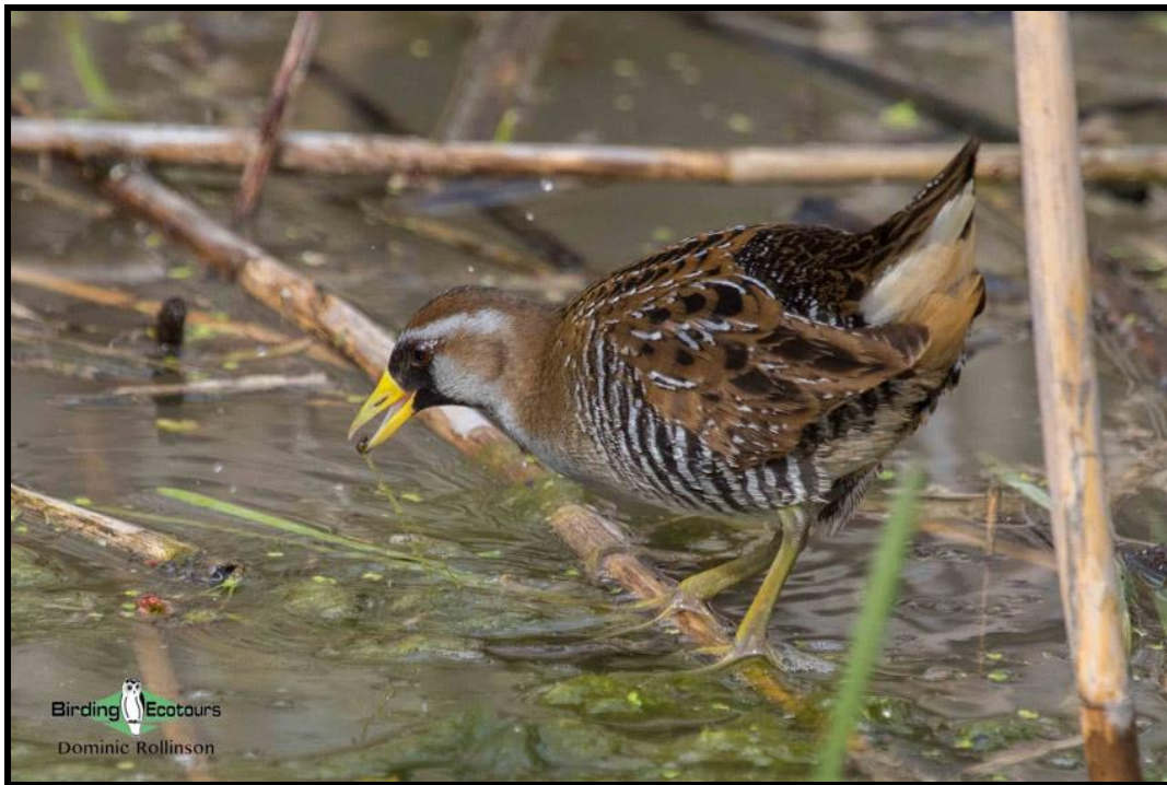
Sora is one of the waterbirds we hope to find at Laguna Rincón.

Overnight: Vista de las Águilas , Pedernales