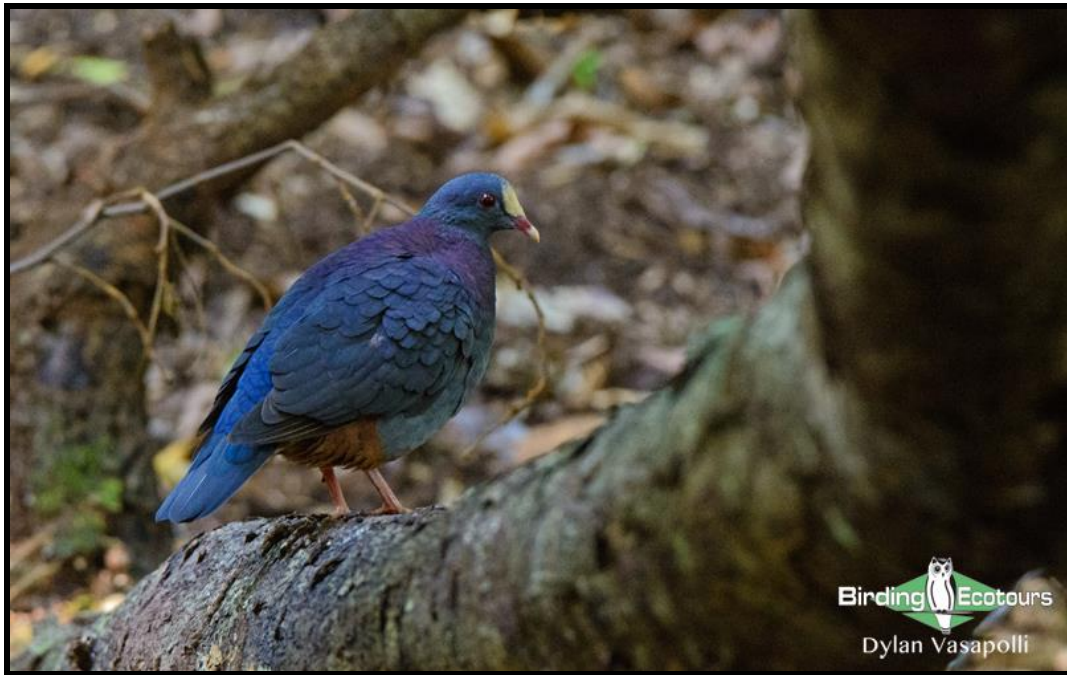
White-fronted Quail-Dove often requires some patience to find.