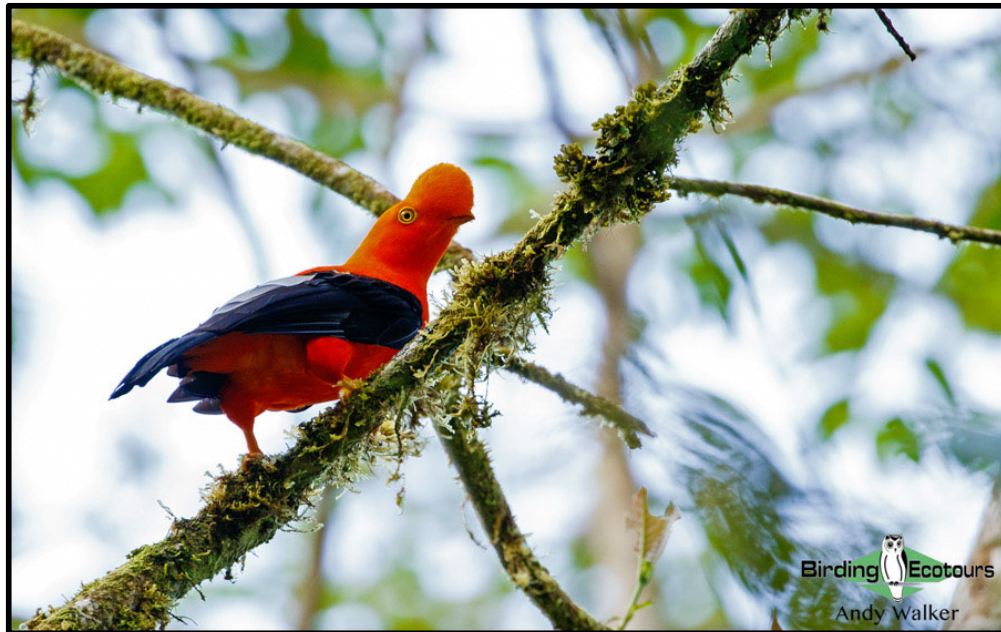
We should be able to find Andean Cocks-of-the-rock at their lek site.