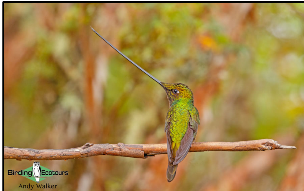
The spectacular Sword-billed Hummingbird

You will arrive at the Mariscal Sucre International Airport in Quito. Your guide will be waiting for you to help with your baggage, take you to your hotel, and go over the schedule for the next days. Dinner is on your own. Overnight: Hotel in Quito