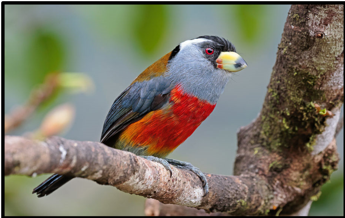
The gorgeous and characterful Toucan Barbet should be encountered on this tour.