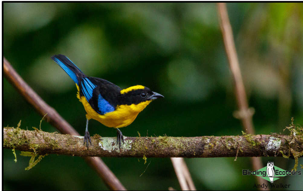
Bellavista Cloudforest is home to the gorgeous Blue-winged Mountain Tanager.

After an early breakfast we will visit the upper portion of the Tandayapa Valley and the Bellavista Cloud Forest Reserve. Here we will look for Toucan Barbet, Green-and-black Fruiteater, Masked Trogon, Blue-and-black Tanager, Blue-winged Mountain Tanager, Strong-billed Woodcreeper, Crimson-mantled Woodpecker, Cinnamon Flycatcher, White-winged Brushfinch, Grey-breasted Wood Wren, Grass-green Tanager, Andean Guan, and White-throated Quail-Dove. We will put all our efforts into localizing the most wanted Ocellated Tapaculo and Tanager Finch.