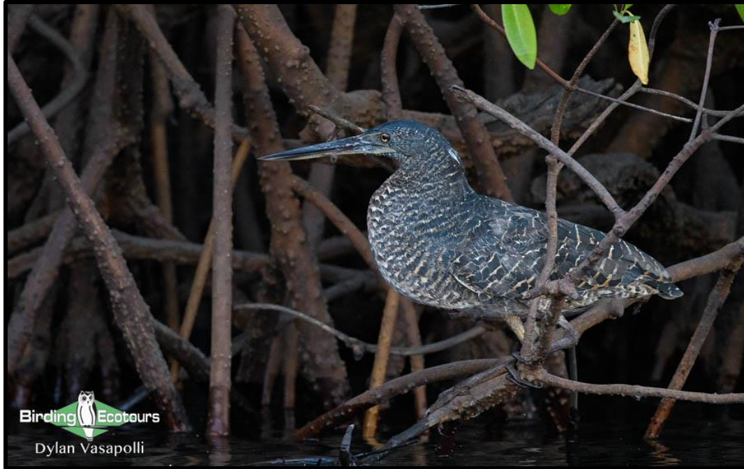
White-crested Tiger Heron is a rare inhabitant of Loango.