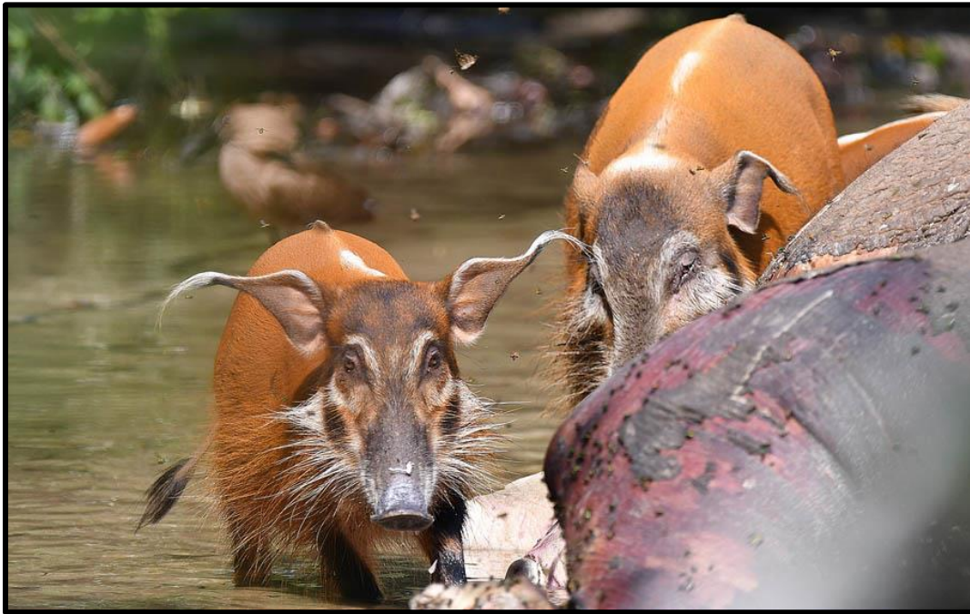
Red River Hog is a mammalian target whilst we're in the amazing Loango National Park.

Blue-breasted and Black-headed Bee-eaters , Yellow-throated Tinkerbird , Black-casqued Hornbill , Yellow-billed Oxpecker (often on mammals), Snowy-crowned Robin-Chat , Grey-rumped Swallow , and Long-legged Pipit . While some of the more common and widespread species of the area include Great Egret , Woolly-necked Stork , Palm-nut Vulture , African Skimmer , Little Tern , Grey and Rock Pratincoles , White-fronted Plover , Water Thick-knee , Grey Parrot , Giant and Pied Kingfishers , Yellow-breasted Apalis , Rufous-vented Paradise Flycatcher , Swamp Boubou , and African Pied Wagtail .