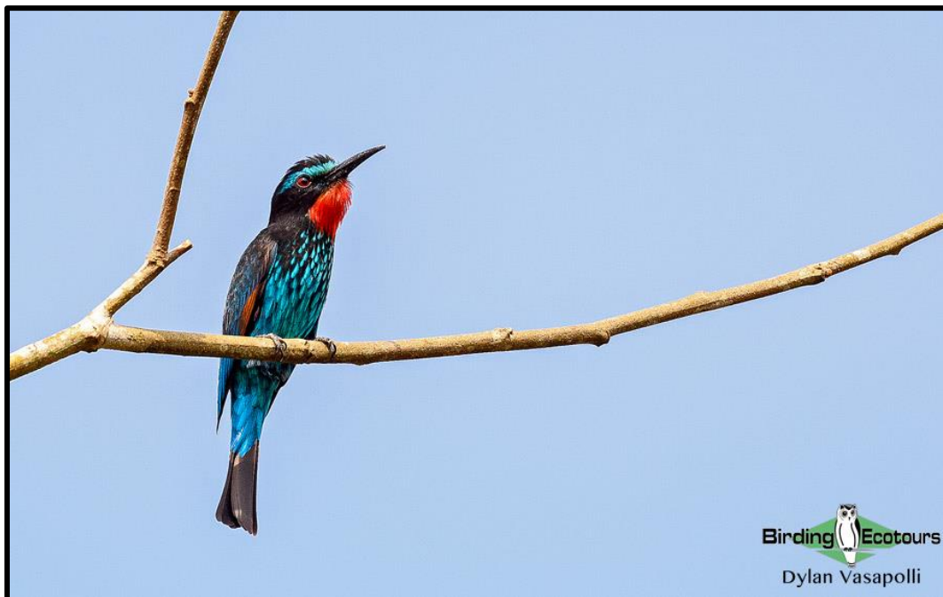
The splendid Black Bee-eater occurs throughout the country.