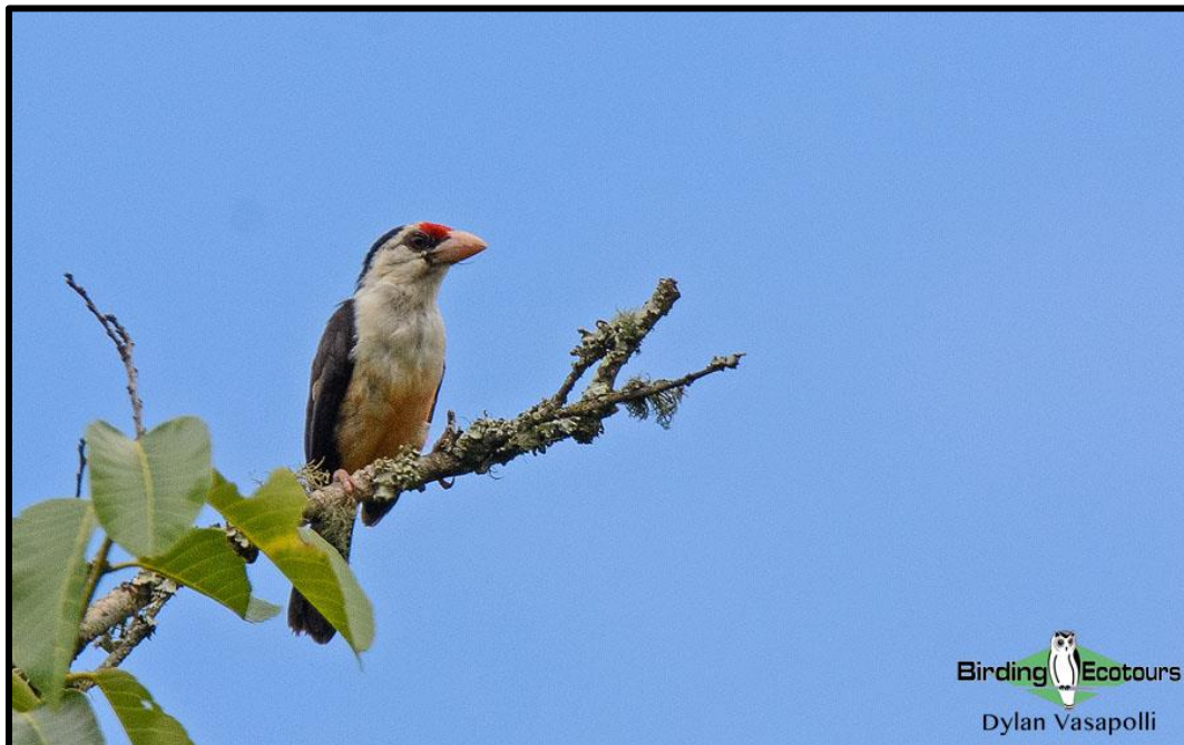
The scarce Black-backed Barbet occurs in the wooded portions of the Batéké Plateau.