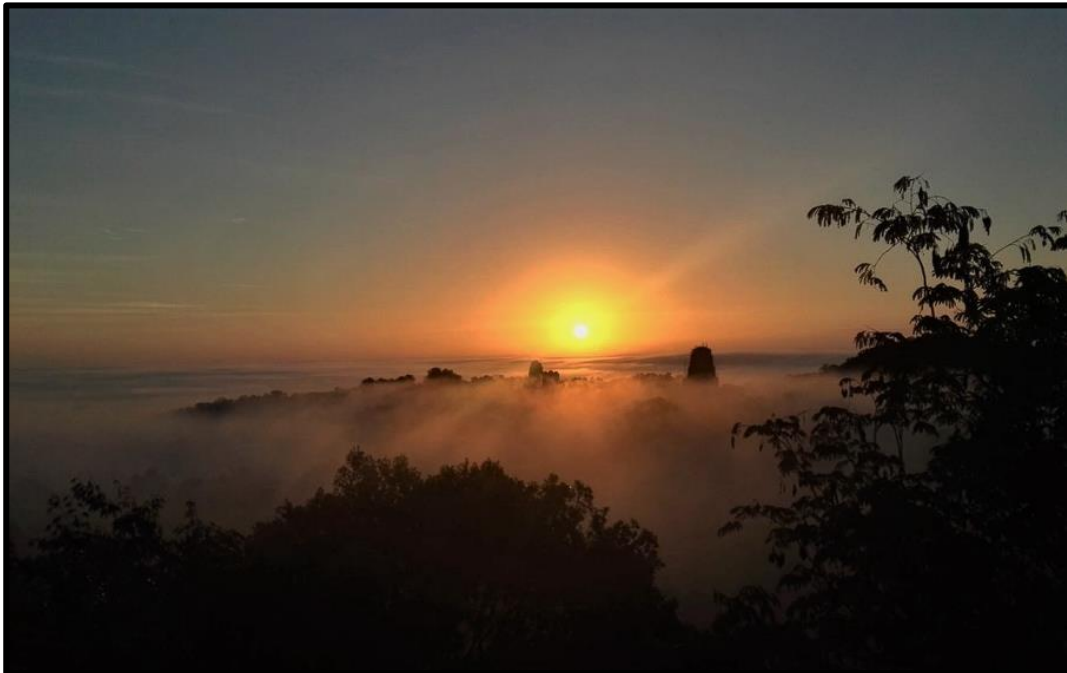
An impressive sunrise in Tikal National Park.