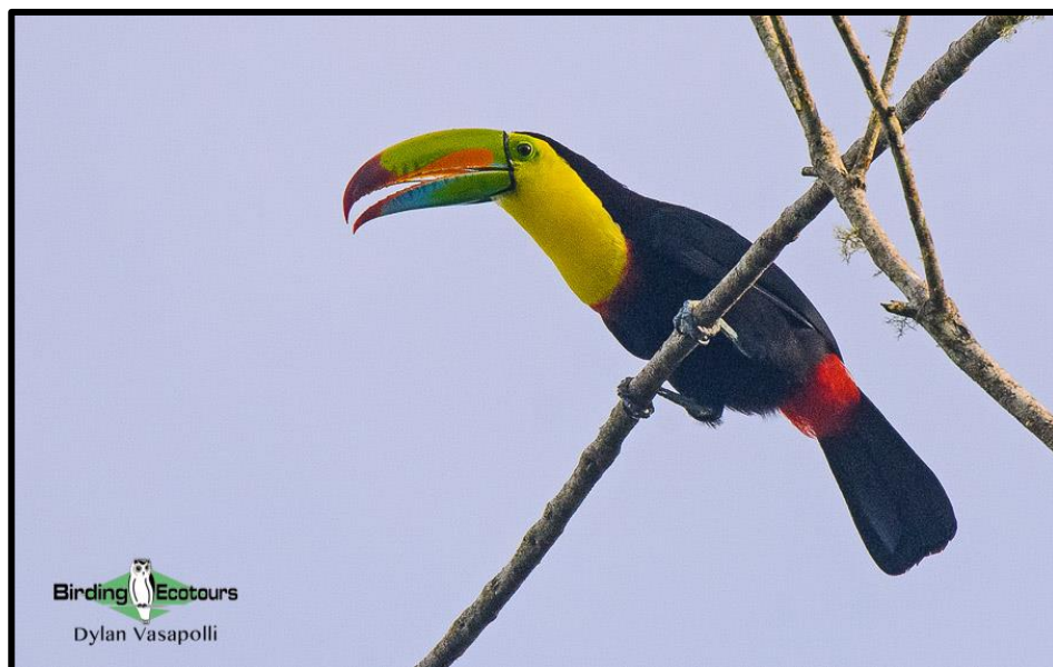
Keel-billed Toucan is abundant in the Tikal National Park.

We invite you to join us on our comprehensive Guatemala: Tikal and Mayan Rainforest Highlights tour for a wonderful birding and cultural experience which can also be combined with our preceding Guatemala itinerary .