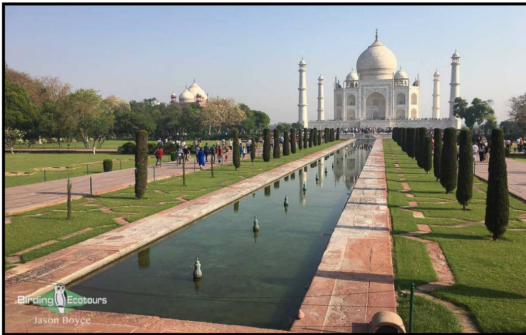
The majestic Taj Mahal