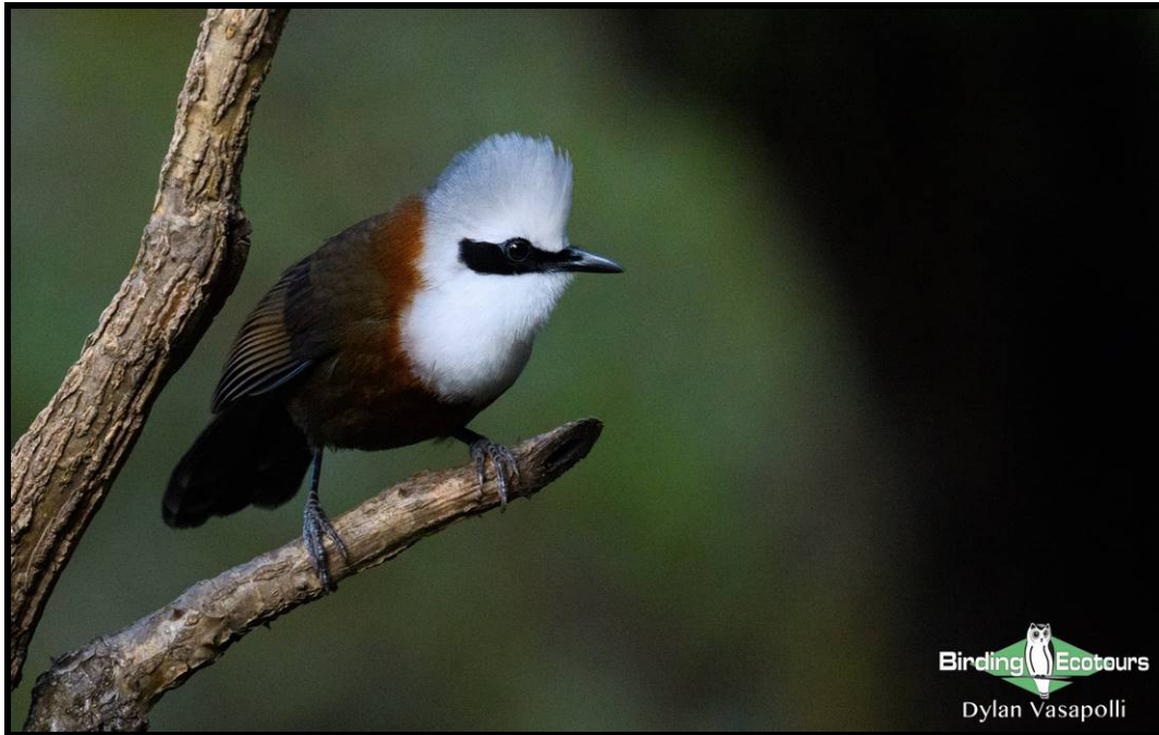
White-crested Laughingthrush can be seen moving through the undergrowth.