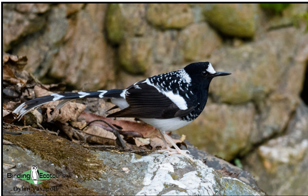
The Spotted Forktail is one of the most beautiful in the whole family.