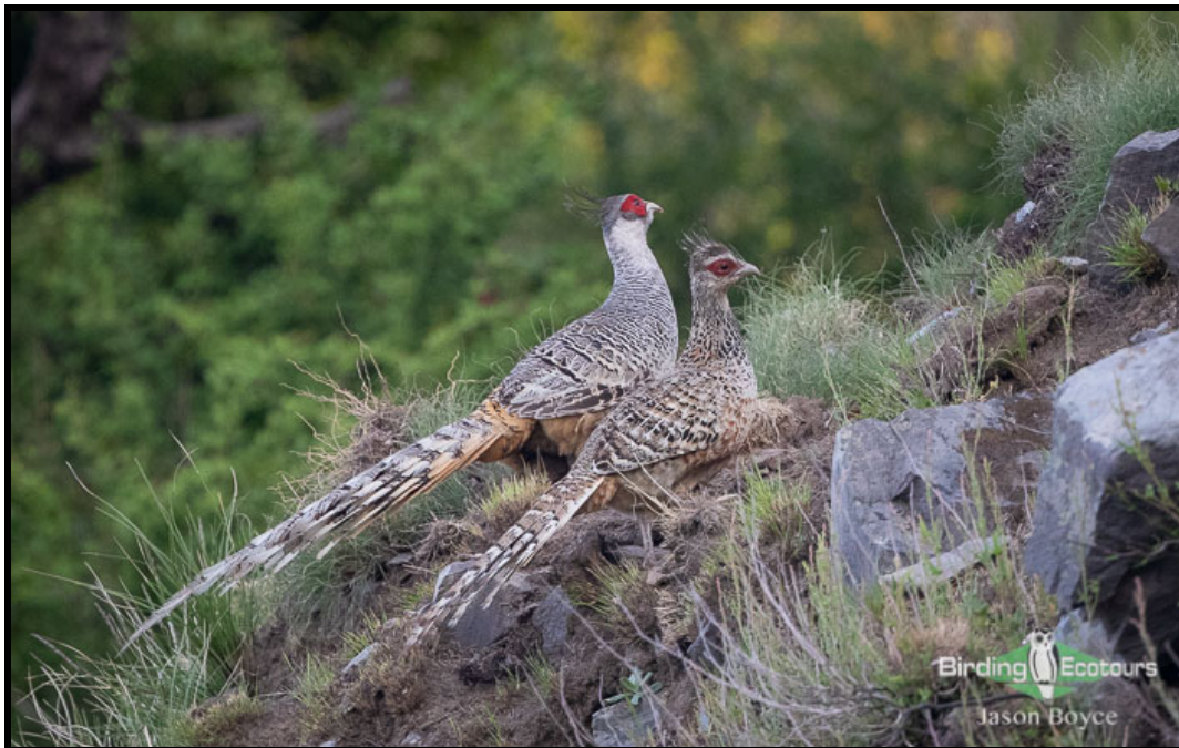
A pair of the prized Cheer Pheasant found above our base in Pangot