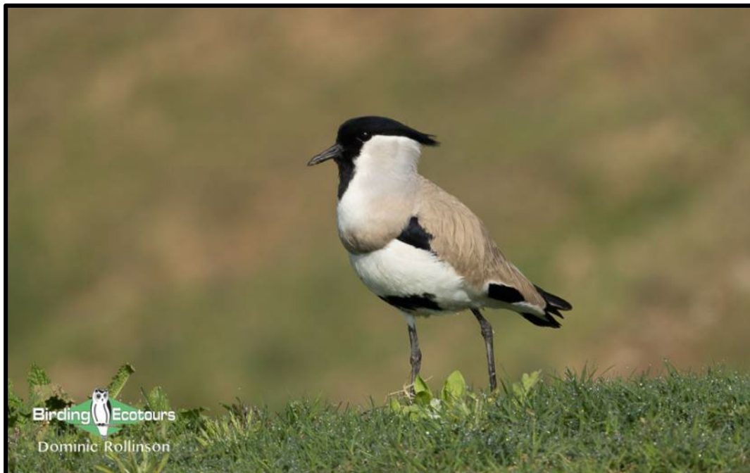
The stunning River Lapwing can be found on the rivers around Nameri National Park.