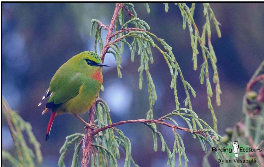
The spectacular Fire-tailed Myzornis provides an incredible hit of color.

wide elevational range to maximize our chances for the most exciting species and mixed-flocks/bird-waves on offer here. Barwings, yuhinas, laughingthrushes, and related species are likely to be evident, such as Red-faced Liocichla , Himalayan Cutia , Fire-tailed Myzornis , Blue-winged Minla , Red-billed Leiothrix , Silver-eared Mesia , Rusty-fronted and Streak-throated Barwings , Long-tailed and Beautiful Sibias , White-naped , Whiskered , and Rufous-vented Yuhinas , Golden-breasted Fulvetta , and Blue-winged , Bhutan , and Black-faced Laughingthrushes . Beautiful Nuthatch and Rusty-flanked Treecreeper along with Yellow-cheeked and Sultan Tits are likely to be in the bird-waves. A range of parrotbills too could be on offer, with Black-headed , Pale-billed and Brown Parrotbills all possible. Some color and further quality might be provided by Ward's Trogon , Red-headed Trogon , Yellow-billed Blue Magpie , Rufous-necked Hornbill , and Scarlet Finch .