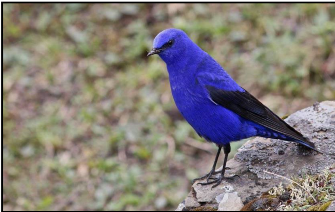
Grandala is a rather striking bird of the high-elevation zone.

Today will be a very exciting and memorable day as we visit a wide range of habitats and elevations. After an early start we will head up to around 4,200 meters (14,108 feet) on the famous Sela Pass – one of the highest drivable mountain passes in all of the Himalayas. Here in the alpine meadows, we will focus on some very special, highly sought, and seriously stunning montane species such as Blood Pheasant, Snow Partridge, Himalayan Monal, Himalayan Vulture, Snow Pigeon, Grandala, Hodgson's Redstart, Alpine Accentor, Tibetan Serin, Plain Mountain Finch, Himalayan White-browed Rosefinch, Spotted Laughingthrush, Rufous-breasted Bush Robin, and White-browed Tit-warbler.