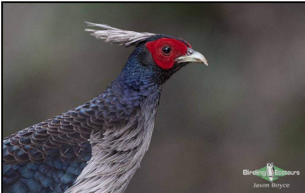
A fantastic portrait of a male Kalij Pheasant .

The more scrubby and wooded areas in and around the national park hold Siberian Rubythroat , Common Green Magpie , Kalij Pheasant , Red Junglefowl , Common Emerald Dove , White-rumped Shama , Rufous Woodpecker , Grey-headed (Black-naped) Woodpecker , Fulvous-breasted Woodpecker , Speckled Piculet , White-browed Scimitar Babbler , Greater Necklaced , Lesser Necklaced , and Rufous-necked Laughingthrushes , Maroon Oriole , Blue-eared Barbet , Great Barbet , Verditer Flycatcher , and Smoky Warbler .