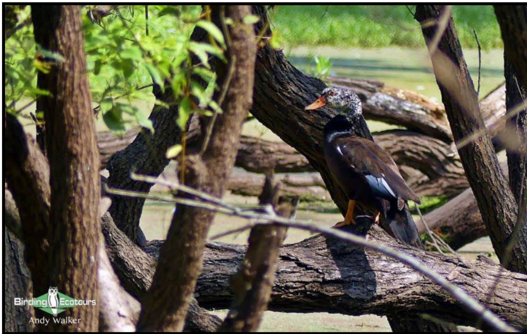
The shy, secretive, and rare White-winged Duck can be found, with luck, in swampy forest areas in Nameri National Park.

We start this exciting tour in the largest city in Assam, Guwahati, situated on the bank of the Brahmaputra River. From here, we will head into the undisturbed wilderness of the Himalayan foothills of Nameri National Park . This area protects numerous species, and we will look for special birds including at least two that are classified as Endangered by IUCN, Greater Adjutant and White-winged Duck (a secretive forest duck). Nameri also hosts many other interesting birds, such as Great Hornbill , Wreathed Hornbill , Red-breasted Parakeet , Grey-headed Fish Eagle , Great Stone-curlew , River Tern , Small Pratincole , Bengal Bush Lark , and Sand Lark .