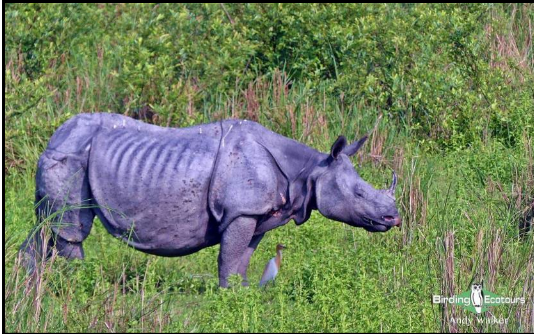
The Greater One-horned (Indian) Rhinoceros is an incredible sight.

A fine suite of mammals also occurs in Kaziranga National Park, and we will look for Greater One-horned (Indian) Rhinoceros, Asian Elephant, Gaur, Wild Water Buffalo, Barasingha (Swamp Deer), Sloth Bear , and Western Hoolock Gibbon . With some luck we may even come across the rare and secretive Bengal Tiger, Indian Leopard, Clouded Leopard, Jungle Cat, Fishing Cat , or Leopard Cat while here. Our visit in and around this national park is sure to be a very interesting, bird-and-wildlife-packed time.