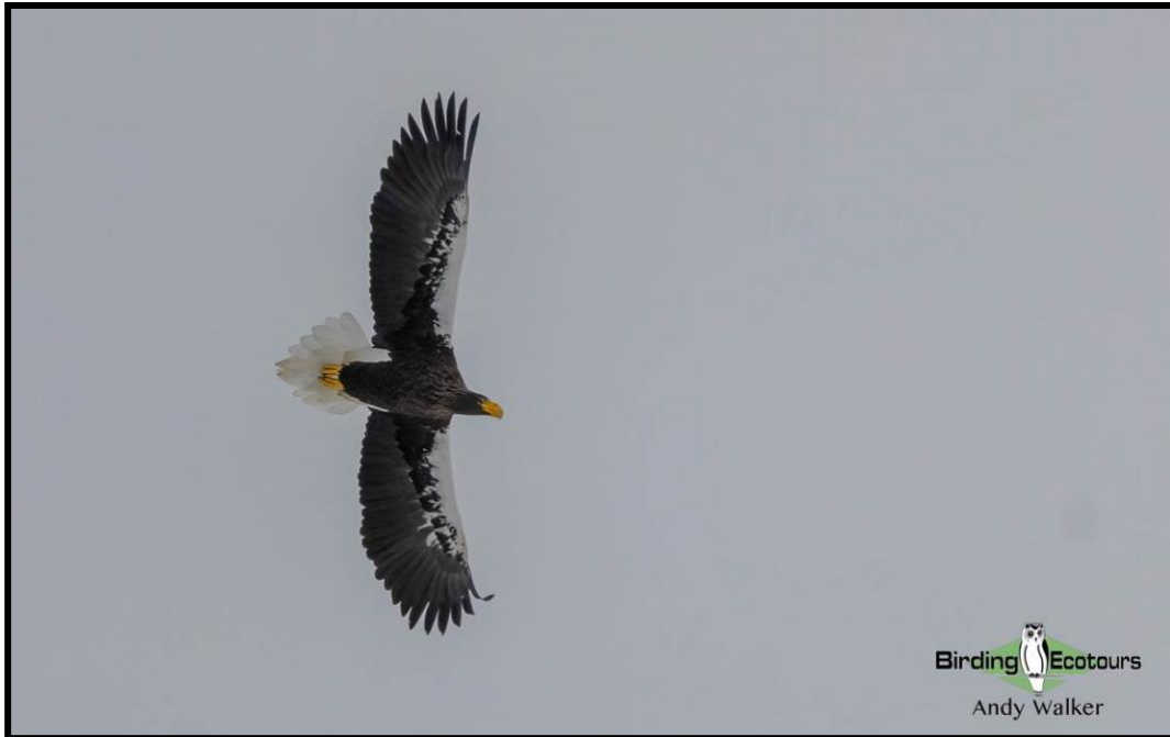
The list of spectacular birds in Japan is long and Steller's Sea Eagle is normally right at the top of this list.