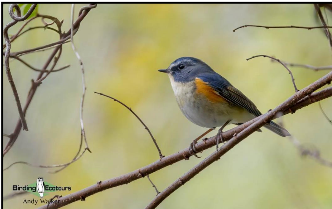
Sightings of the beautiful Red-flanked Bluetail are always a highlight.

We often see interesting passerines in the area too, such as Bull-headed Shrike , (Eastern) Rook , Daurian Jackdaw , Carrion Crow , Varied Tit , Chinese Penduline Tit , Eurasian Skylark , Zitting Cisticola , Asian House Martin , White-cheeked Starling , Russet Sparrow , Red-flanked Bluetail , Brown-headed Thrush , Pale Thrush , Olive-backed Pipit , Red-throated Pipit , Siberian Pipit , and almost a dozen bunting species, including Yellow-throated Bunting , Rustic Bunting , Common Reed Bunting , and Ochre-rumped Bunting .