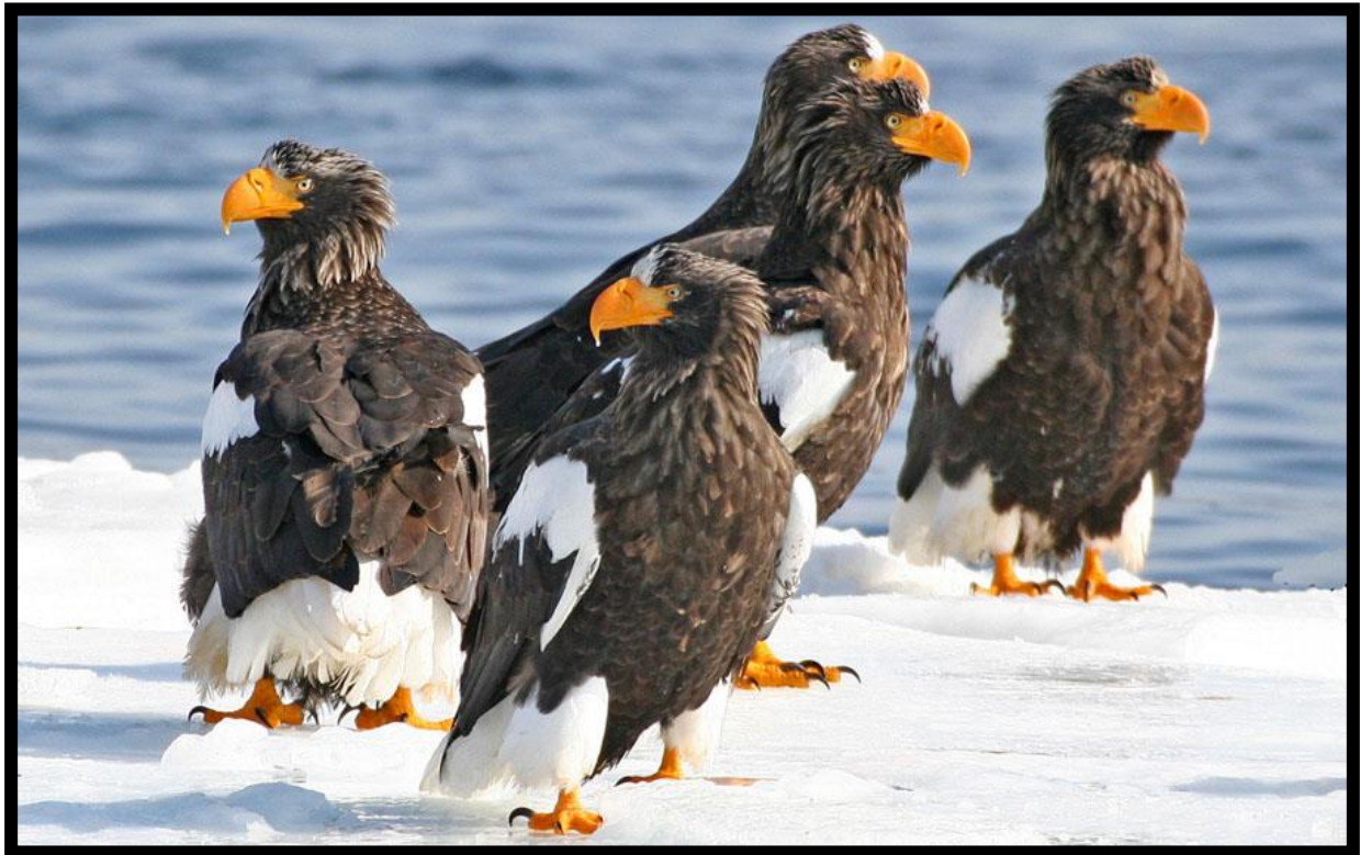
Steller's Sea Eagle is one of the many spectacular highlights of this Japanese winter birding tour.