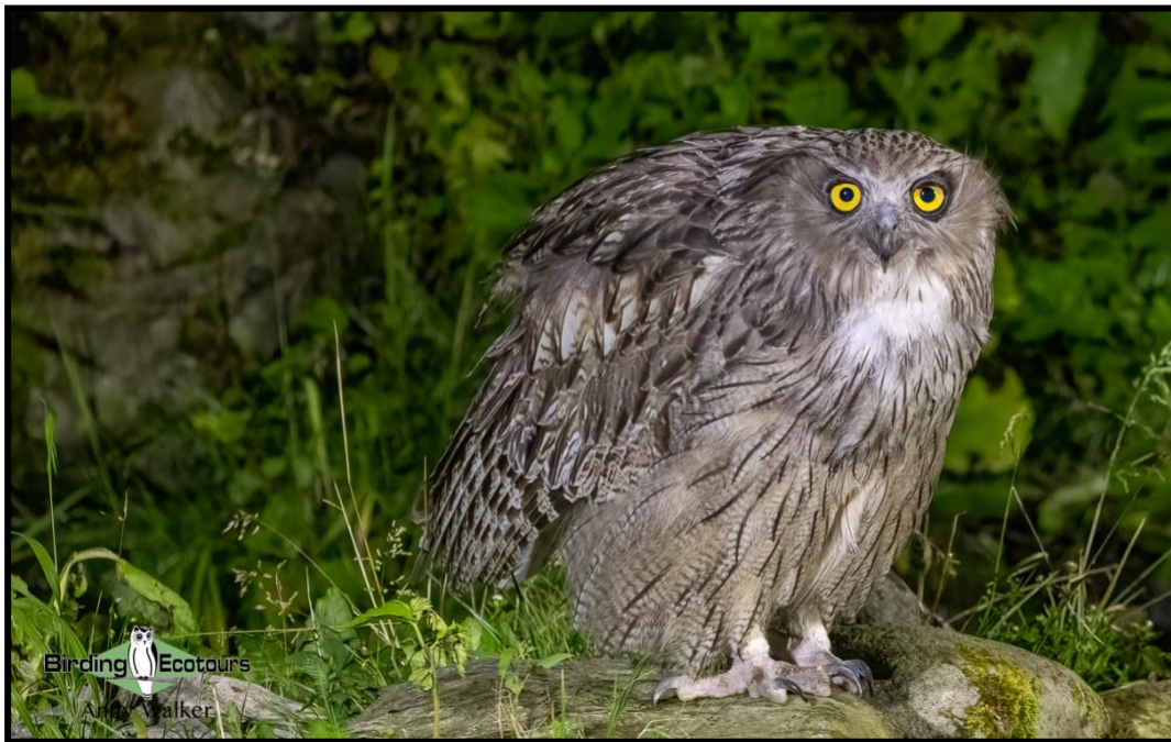
Blakiston's Fish Owl is one of the special targets on this tour.

This trip could well be one of the tour highlights (and that is quite something, given what we will have already experienced!). Along with the sea eagles, we could find other exciting species like White-tailed Eagle , Harlequin Duck , Long-tailed Duck , Stejneger's Scoter , Black Scoter , Common Goldeneye , Common Murre (Common Guillemot), Thick-billed Murre (Brünnich's Guillemot), Spectacled Guillemot , Long-billed Murrelet , Ancient Murrelet , Least Auklet , Crested Auklet , Rhinoceros Auklet , Black-tailed Gull , Vega Gull , Slaty-backed Gull , Glaucous Gull , Glaucous-winged Gull , Common (Kamchatka) Gull , Red-throated Loon (Red-throated Diver), Black-throated Loon (Black-throated Diver), Pacific Loon (Pacific Diver), Pelagic Cormorant , and Japanese Cormorant .