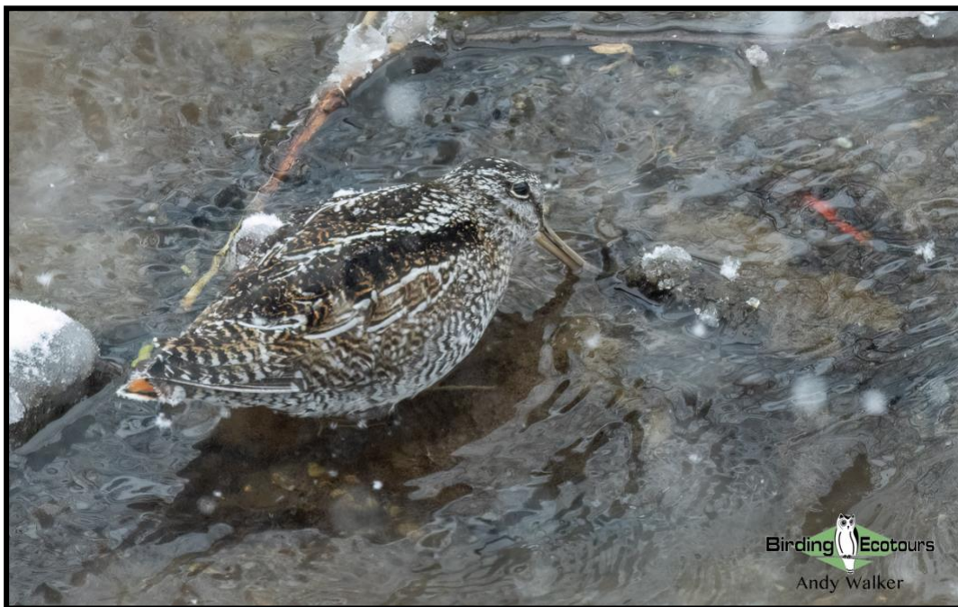
The rarely seen Solitary Snipe can be found on the river around our accommodation at Yoroushi.