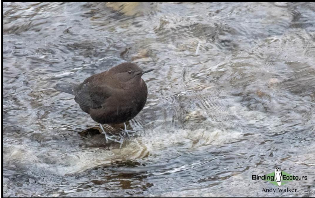
We will seek out Brown Dipper in suitable rivers during this tour.