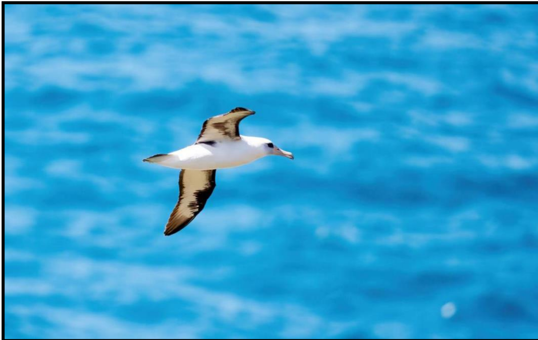
Laysan Albatross can be found on the sea around Miyake-Jima.