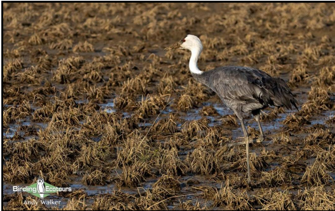
The striking Hooded Crane will be enjoyed in huge numbers.

Izumi is home to the famed Izumi Crane Observation Centre , and this is one of the main reasons for our visit to the area and we will spend some time birding from the observation tower. This part of Japan is famous worldwide for its winter flock of almost 15,000 cranes! Most of the flock is made up of Hooded Cranes , with White-naped Cranes being the next most abundant. Annually the flock also occasionally holds low numbers of Common Crane , Demoiselle Crane , Sandhill Crane , or even the Critically Endangered ( BirdLife International ) Siberian Crane , so we will carefully scan through the vast flocks to see what may be lurking among the masses!