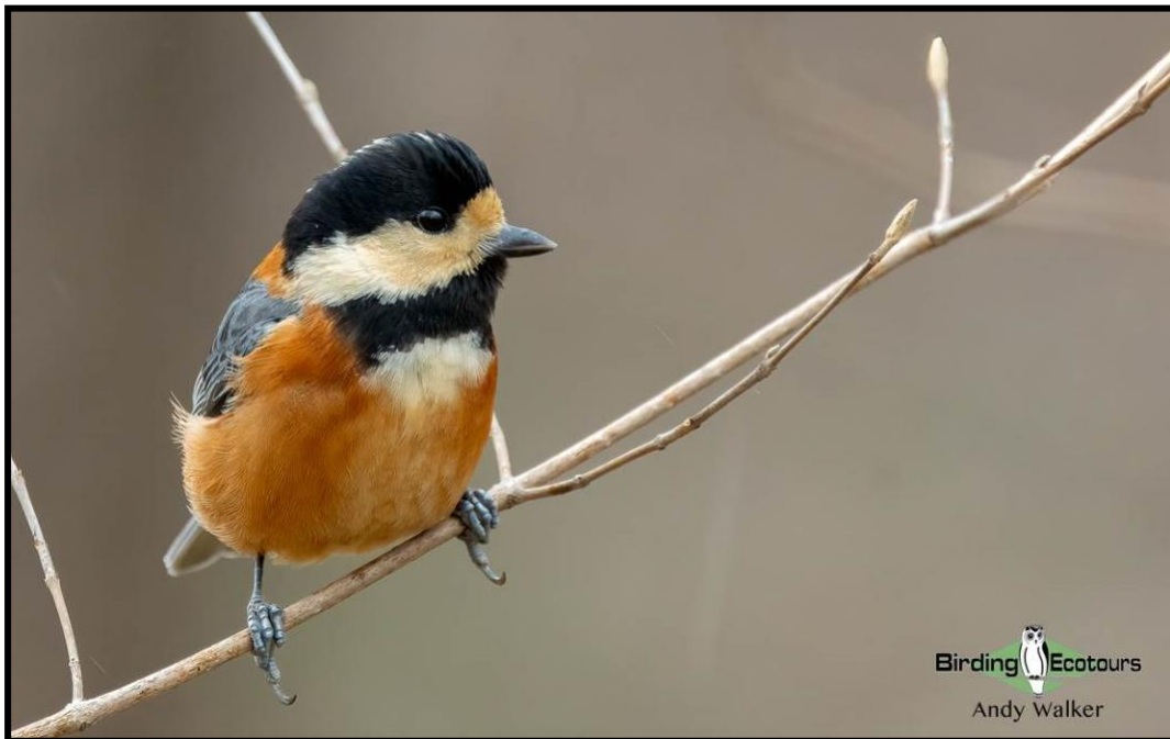
The gorgeous Varied Tit will be searched for in woodland areas.