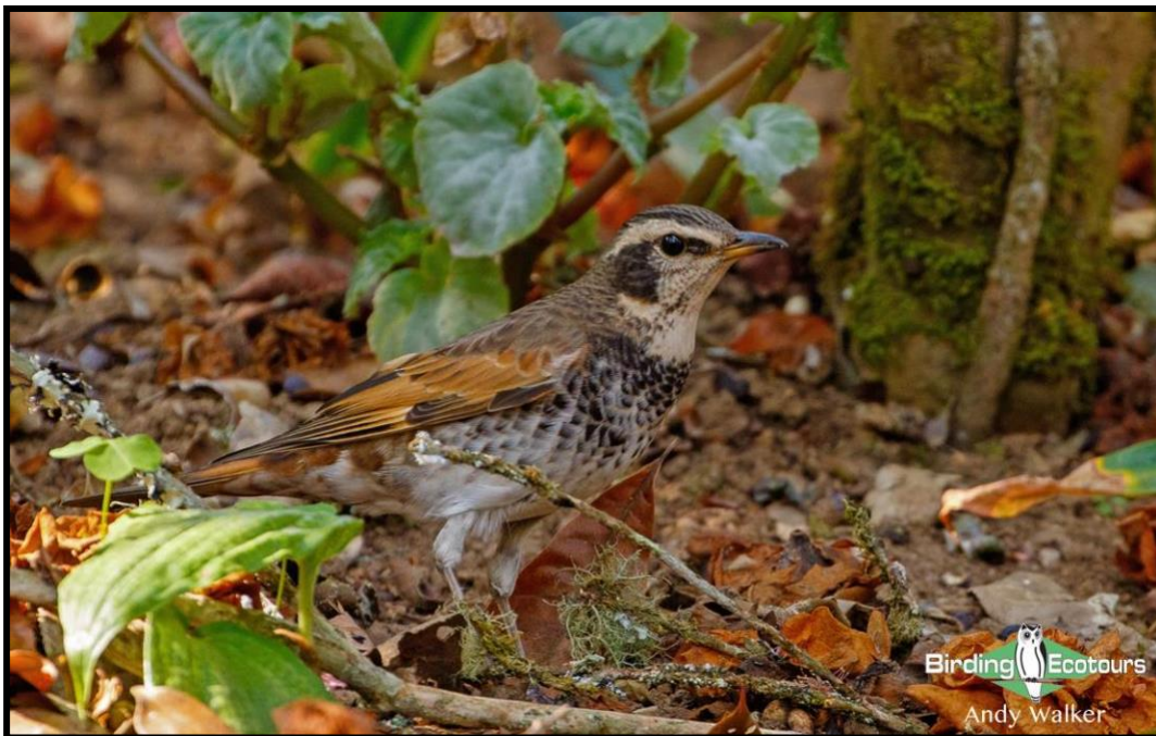
The highly camouflaged Dusky Thrush foraging on the ground.