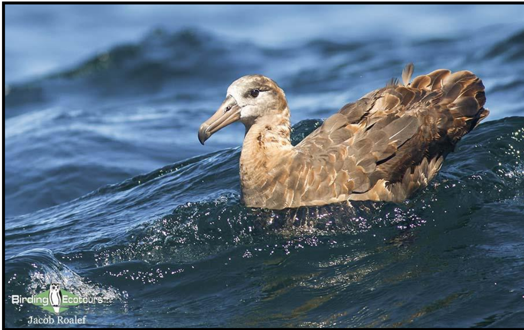
Black-footed Albatross is one of three albatross species possible on this Japanese birding tour.

The final leg of this Japanese birding trip will be on and around the island of Honshu, home to Tokyo. We will meander through the forests, hills, and lakes of central Honshu to seek out specials such as Japanese Pygmy Woodpecker , Japanese Green Woodpecker , Varied Tit , and perhaps, if we are lucky, the shy and endemic Copper Pheasant . We include visits to lakes to look for Baikal Teal and Mandarin Duck , and to a valley where endemic Japanese Macaque and Japanese Serow (a goat-antelope) make their winter home. We will end our tour with a birding trip to Miyake-Jima ( Miyake Island ), a volcanic island in the Izu Archipelago , located approximately 110 miles (180 kilometers) southeast of Tokyo. This trip will give us opportunities for Izu Thrush , Owston's Tit , and Izu Robin on the island, as well as Black-footed Albatross , Laysan Albatross , Short-tailed Albatross , and Tristram's Storm Petrel out at sea.