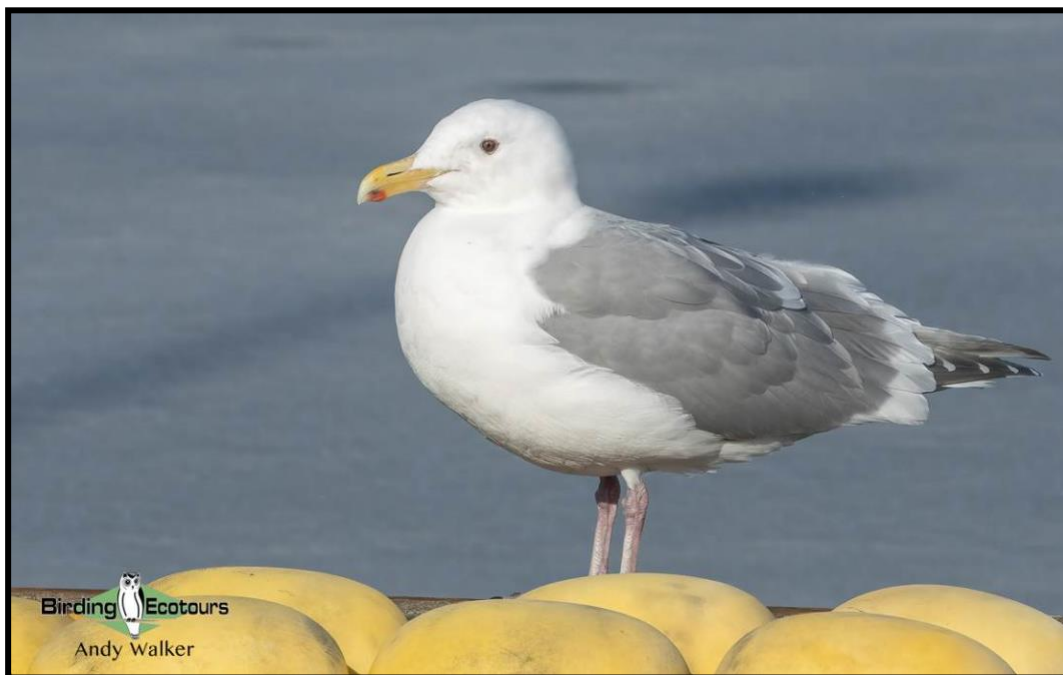
Gulls abound in Japan, such as this Glaucous-winged Gull.