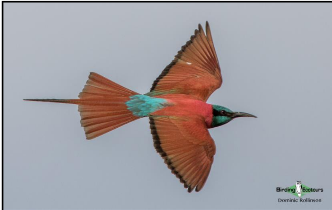
The vivid colors of Northern Carmine Bee-eater will leave you awestruck.

After a two-hour boat ride, we have an hour or so to search for terrestrial beauties here like Eastern Violet-backed Sunbird , Spotted Palm Thrush and Abyssinian Roller among others, before we break for lunch. In the late afternoon we resume birding, now along the cliffs, looking for Hemprich's Hornbill , Bristle-crowned Starling , Verreaux's Eagle , and Rock Hyrax , the eagle's main prey. With the help of a local naturalist, we'll walk along the famous Tugen Hills, known for their great diversity of raptors and owls, as well as interesting passerines. Here we hope to find Three-banded Courser , Slender-tailed Nightjar , Greyish Eagle-Owl , Verreaux's Eagle-Owl , Pearl-spotted Owlet , Lichtenstein's Sandgrouse , White-bellied Canary , Brown-tailed Rock Chat , Jackson's Hornbill , Speckle-fronted Weaver , White-billed and White-headed Buffalo Weavers , Dark Chanting Goshawk , African Grey and Nubian Woodpeckers , Red-and-yellow and D'Arnaud's Barbets , and Purple Roller , and many others.