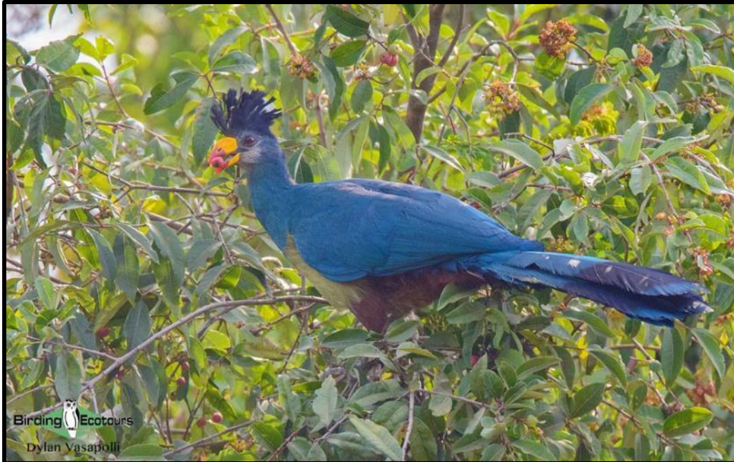
Great Blue Turaco is loud and conspicuous in Kakamega Forest.