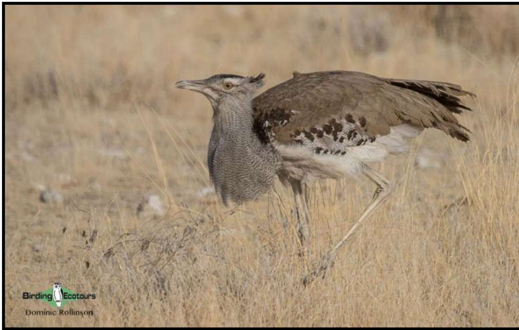
The massive Kori Bustard is often seen strolling across the open plains.

This morning, we'll depart for the famed Maasai Mara National Reserve, contiguous with the Serengeti just across the border in Tanzania. The drive will already present some special rewards, like a sudden surprising, stunning outlook from a viewpoint at the top of the escarpment over the width of the Great Rift Valley , with Rock Hyraxes also enjoying the view. All kinds of spectacular birds along with large (and small!) game animals abound, including Grey Crowned Crane , Secretarybird , Common Wildebeest , Thomson's Gazelle , Plains Zebra , Impala , Black-backed Jackal , Common Duiker , Vervet Monkey , and even (Maasai) Giraffe – roaming freely in the fields and using the roads together with the traffic, long before we even enter any game reserve.