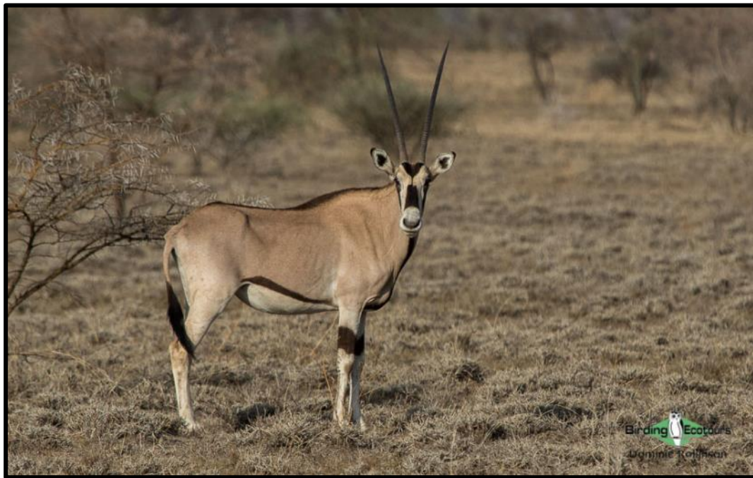
Samburu National Reserve holds large numbers of game animals, such as this impressive Beisa Oryx .