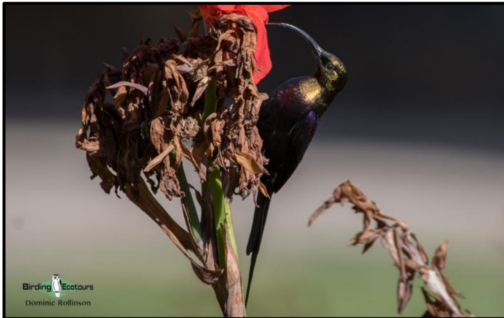
Tacazze Sunbird is one of the many beauties we will look for at Thomson's Falls.

We'll depart, after breakfast, for Ol Pejeta Wildlife Conservancy , allowing time to search for several key species along the way. We will also have a stopover at Thomson's Falls at Nyahururu which is one of Kenya's highest towns, at 7,700 feet (2,360 meters) above sea level. Just outside the town lies Thomson's Falls on the Ewaso Narok River. It falls an impressive 230 feet (72 meters), with the mist feeding the dense forest below. At Thomson's Falls we're likely to see Chestnut-winged and Slender-billed Starlings , Rock Martin , Grey Cuckooshrike , Kikuyu White-eye , and Tacazze and Collared Sunbirds . We will have our lunch here before proceeding to Ol Pejeta, however we will have a stop en route at Wajee Camp to look for the Vulnerable (IUCN) Kenyan endemic Hinde's Babbler as well as Holub's Golden Weaver .