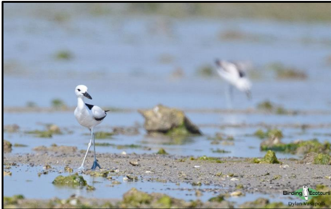
We may be lucky enough to encounter Crab-plover along the Indian Ocean coastline.

Kenya has a spectacularly diverse array of habitats packed into a small area. These range from humid tropical lowland forests with localized denizens such as Sokoke Scops Owl near the idyllic Indian Ocean coastline (which boasts Crab-plover ), to snow-capped mountains at over 16,000 feet (5,000 meters) above sea level! In between the sea and the high mountains are vast arid savannas and grasslands that are famous for their endless herds of wildlife, opportunistic predators such as Africa's big cats, and a myriad of colorful bird species. Then there are the Great Rift Valley scarps and flamingo-filled lakes, highland grasslands, the Taita Hills, a staggeringly bird-diverse tropical rainforest in the form of Kakamega and last but not least the papyrus-lined Lake Victoria, the continent's biggest lake.