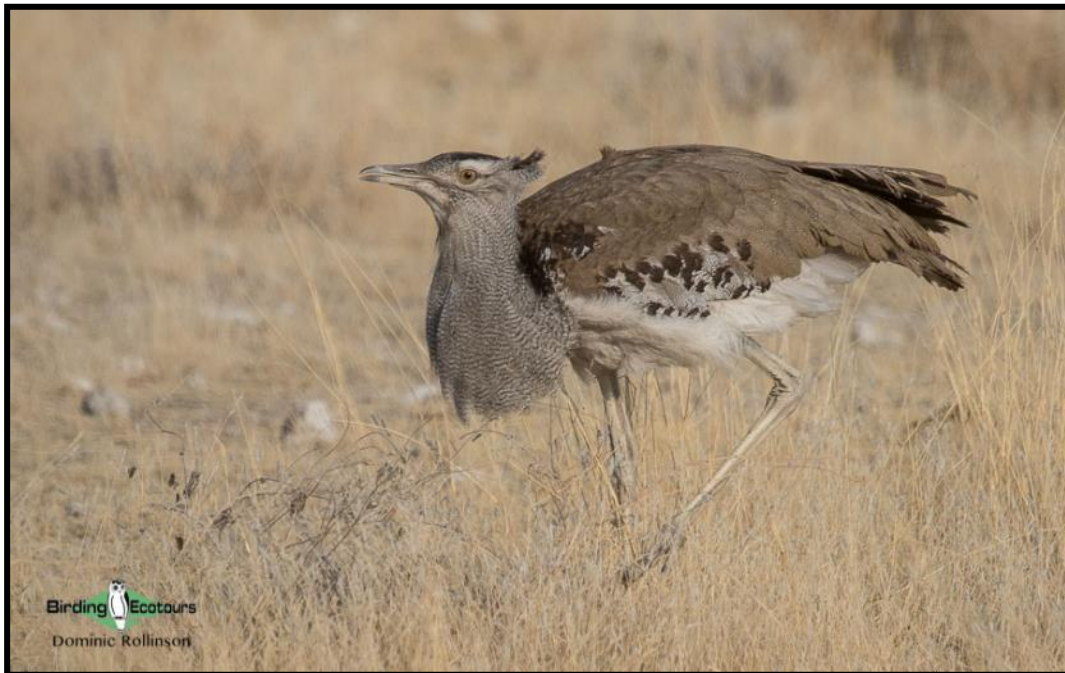
The massive Kori Bustard is often seen strolling across the open plains.

This morning, we'll depart for the famed Maasai Mara National Reserve, contiguous with the Serengeti just across the border in Tanzania. The drive will already present some special rewards, like a sudden surprising, stunning outlook from a viewpoint at the top of the escarpment over the width of the Great Rift Valley , with Rock Hyraxes also enjoying the view. All kinds of spectacular birds along with large (and small!) game animals abound, including Grey Crowned Crane , Secretarybird , Common Wildebeest , Thomson's Gazelle , Plains Zebra , Impala , Black-backed Jackal , Common Duiker , Vervet Monkey , and even (Maasai) Giraffe – roaming freely in the fields and using the roads together with the traffic, long before we even enter any game reserve.