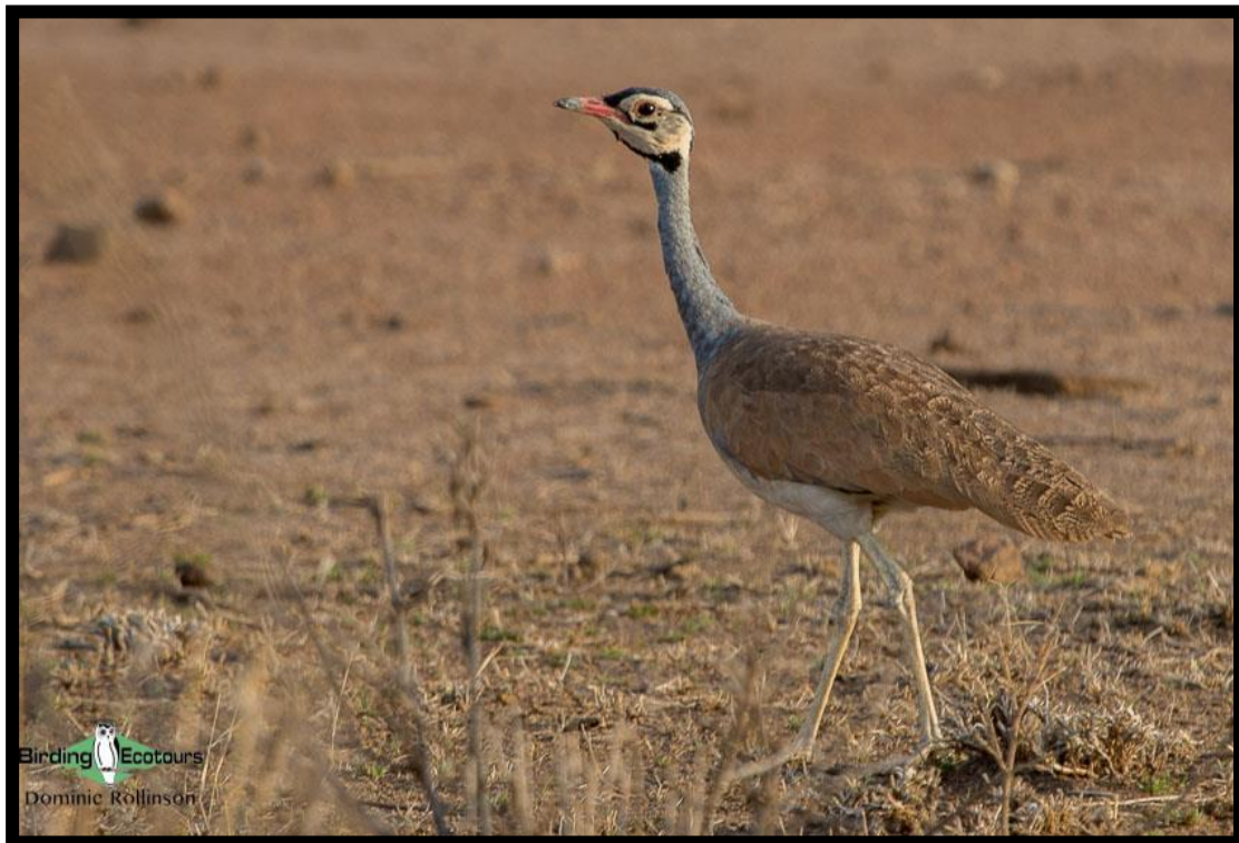
White-bellied Bustard should be seen on the plains of the Maasai Mara.

06 – 30 SEPTEMBER 2024 15 JULY – 08 AUGUST 2025