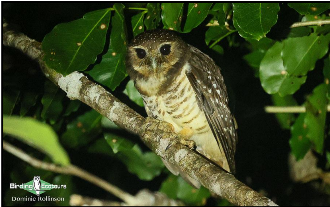
White-browed Owl can be found in Berenty Reserve.

The small, private Berenty Reserve, situated at the southern tip of Madagascar, is one of the island's best-known and most frequently visited nature reserves. Stretching along the Mandrare River, it is composed of deciduous riverine gallery forest and a small stretch of spiny forest, where virtually all the plants are covered in thorns. Although most famous for its dense lemur populations, with hundreds of individuals per square kilometer (research on lemurs has been continuing here for more than three decades), the reserve is also a haven for birdwatchers, boasting a high number of endemic species. With luck we might be able to find Banded Kestrel , Madagascan Sandgrouse , Torotoroka Scops Owl , Sickle-billed Vanga and perhaps even Madagascan Cuckoo-Hawk here. This tour also includes a visit to Andohahela National Park where we will search for the rare and localized Red-tailed Newtonia .