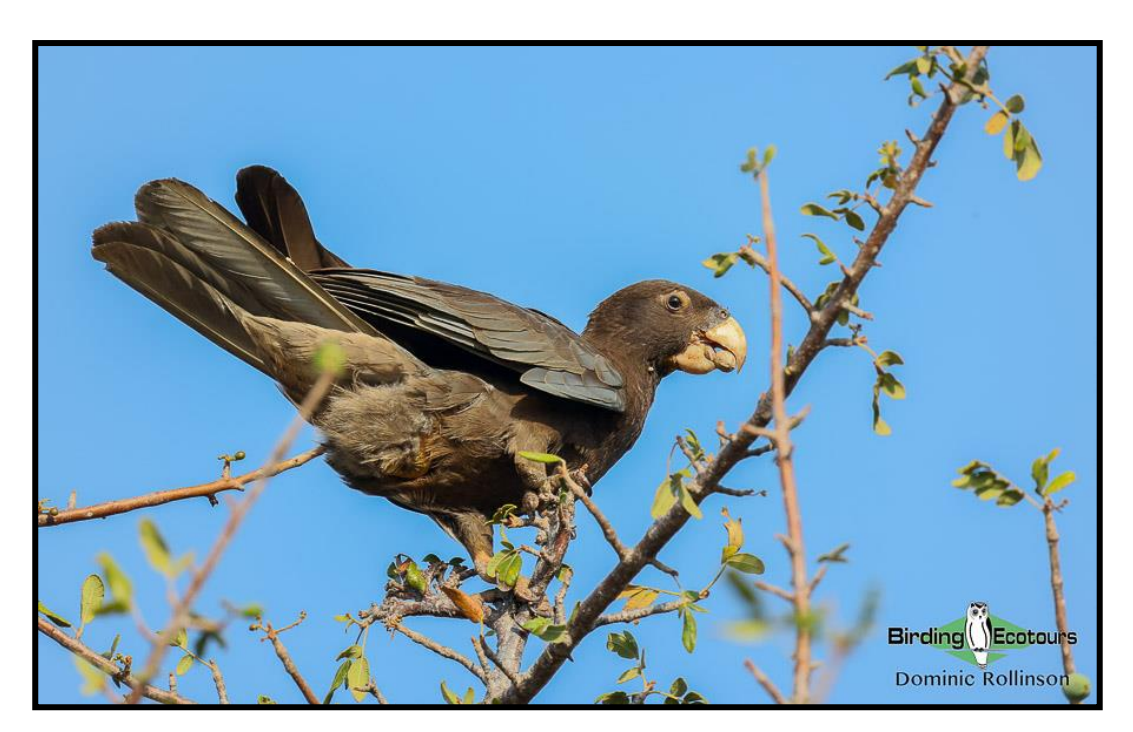
The huge Greater Vasa Parrot can be seen at several sites on this tour.

Please note that the itinerary cannot be guaranteed as it is only a rough guide and can be changed (usually slightly) due to factors such as availability of accommodation, updated information on the state of accommodation, roads, or birding sites, the discretion of the guides, and other factors. In addition, we sometimes have to use a different guide from the one advertised due to tour scheduling or other factors.