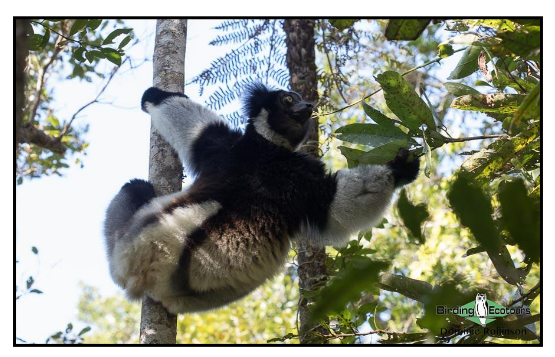
Indri , Madagascar's largest lemur species.

Madagascar, our world's fourth-largest island is, quite simply, unique. Four bird families and five mammal families (including the lemurs) are endemic to this massive island, and half the world's chameleons, along with weird and wonderful endemic plant families, and tons of other wildlife can all be found here. An astonishing 120 bird species are endemic – including such exotic groups as vangas, ground rollers, Cuckoo Roller , couas, asities, and mesites. Lemurs vie for attention, from the tiny mouse lemurs to the marvelous sifakas and the amazing Indri with its deafening calls that resound through the forest. Our tour visits a range of habitats: grasslands, dry deciduous woodland, the bizarre spiny forest with its odd octopus trees ( Didiera madagascariensis ) and elephant's foot trees ( Pachypodium rosulatum ), lush eastern rainforest, as well as lagoons and mudflats. The birds that we'll look for include the roadrunner-like Long-tailed Ground Roller and the stunning Pitta-like , Scaly , and Rufous-headed Ground Rollers as well as the highly prized Subdesert Mesite , the unforgettable Giant Coua , the astounding Velvet Asity , and Madagascar Ibis , to name just a handful. We invite you to join us on a special tour to an amazing island!