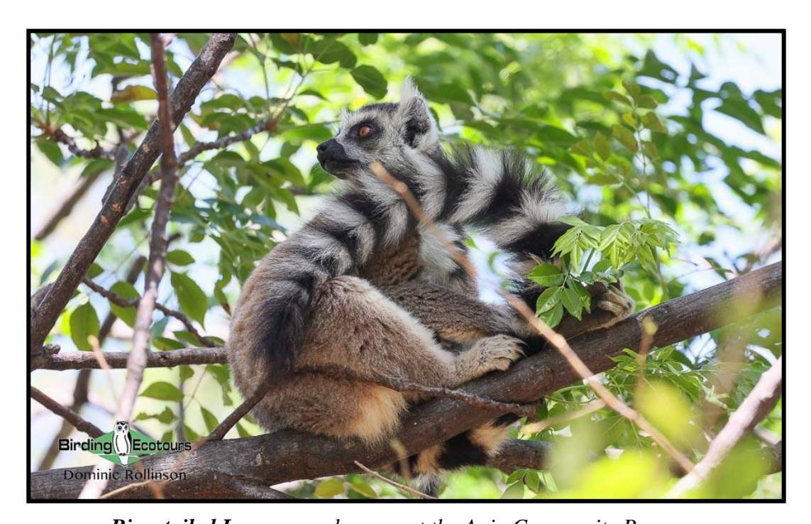
Ring-tailed Lemur may be seen at the Anja Community Reserve.