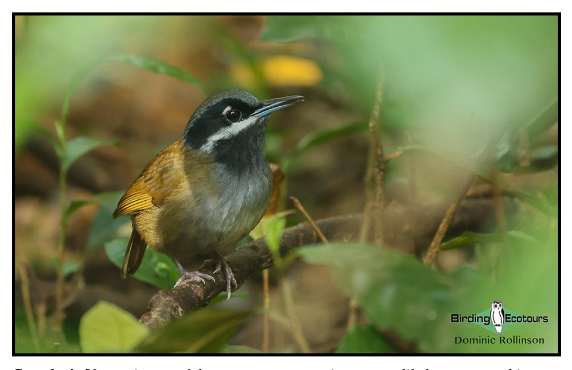
Crossley's Vanga is one of the many vanga species we are likely to see on this tour.