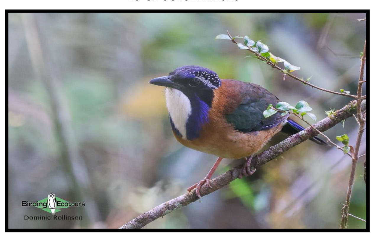
Pitta-like Ground Roller is a member of one of the four endemic avian families of Madagascar which we will be looking for on this tour.