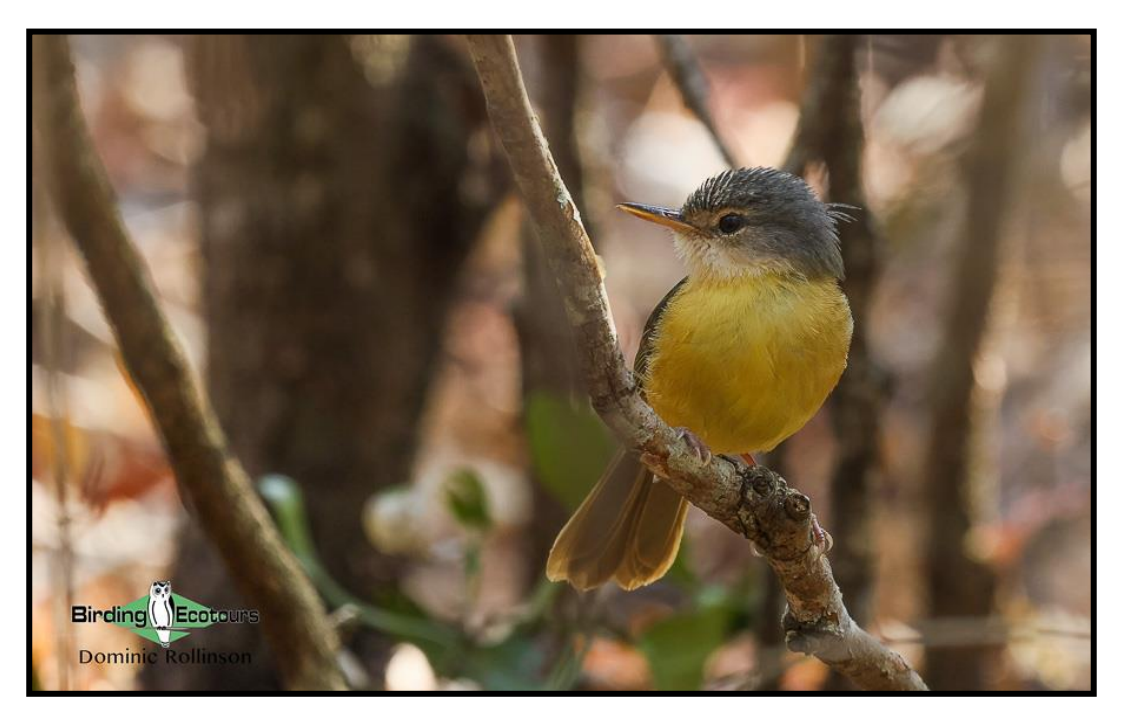
The range-restricted Appert's Tetraka can be seen in Zombitse National Park.