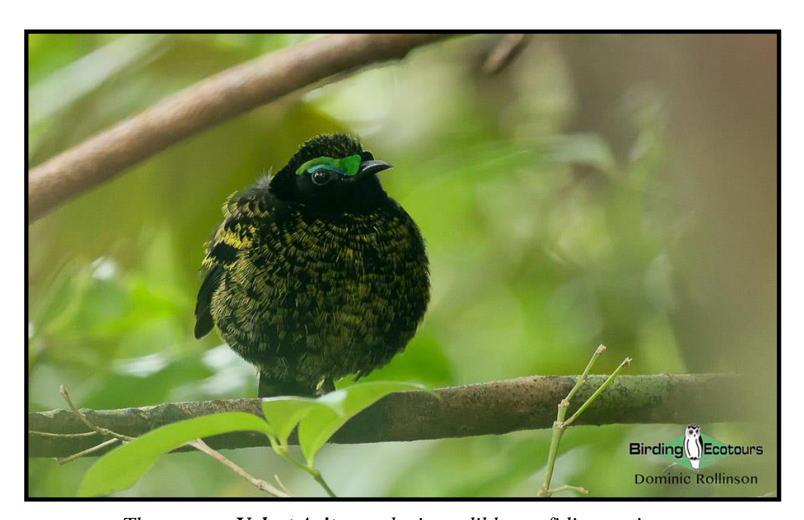
The strange Velvet Asity can be incredibly confiding at times.