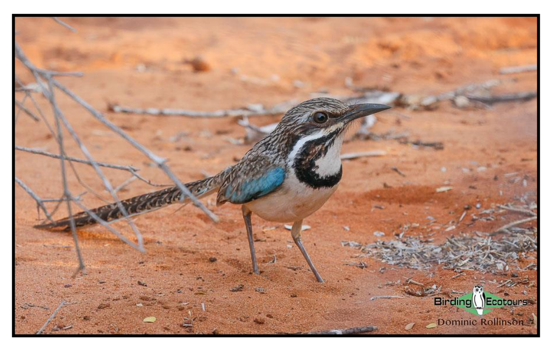
Long-tailed Ground Roller occurs in the spiny forest near Isalo.

Overnight: Arboretum d'Antsokay, near Toliara