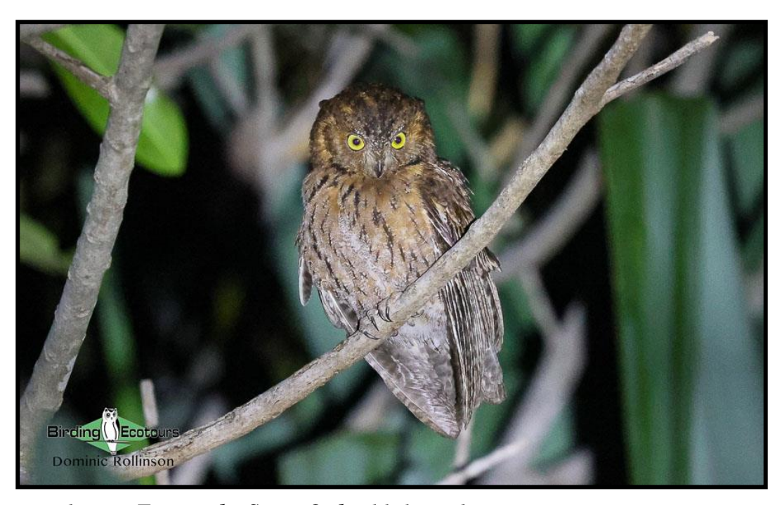
The cute Torotoroka Scops Owl is likely on the Berenty Reserve extension.

Although most famous for its dense lemur population, with hundreds of individuals per square kilometer (research on lemurs has been ongoing here for more than three decades), Berenty Reserve is also a haven for birdwatchers, boasting a high number of endemic species. With luck we might be able to find Madagascar Sandgrouse, Madagascar Green Pigeon, Torotoroka Scops Owl, and perhaps even Madagascar Cuckoo-Hawk.