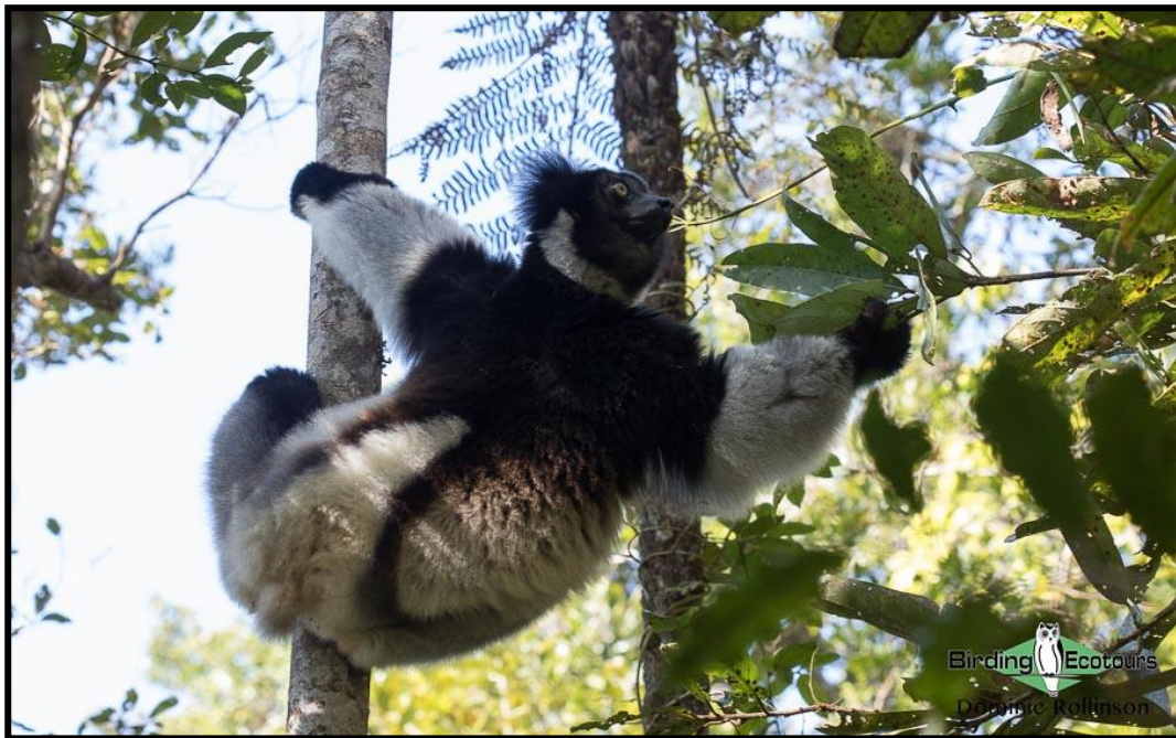
Indri, Madagascar's largest lemur species.

Madagascar, our world's fourth-largest island is, quite simply, unique. Four bird families and five mammal families (including the lemurs) are endemic to this massive island, and half the world's chameleons, along with weird and wonderful endemic plant families, and tons of other wildlife can all be found here. An astonishing 120 bird species are endemic – including such exotic groups as vangas, ground rollers, Cuckoo Roller , couas, asities, and mesites. Lemurs vie for attention, from the tiny mouse lemurs to the marvelous sifakas and the amazing Indri with its deafening calls that resound through the forest. Our tour visits a range of habitats: grasslands, dry deciduous woodland, the bizarre spiny forest with its odd octopus trees ( Didiera madagascariensis ) and elephant's foot trees ( Pachypodium rosulatum ), lush eastern rainforest, as well as lagoons and mudflats. The birds that we'll look for include the roadrunner-like Long-tailed Ground Roller and the stunning Pitta-like, Scaly , and Rufous-headed Ground Rollers as well as the highly prized Subdesert Mesite , the unforgettable Giant Coua , the astounding Velvet Asity , and Madagascar Ibis , to name just a handful. We invite you to join us on a special tour to an amazing island!