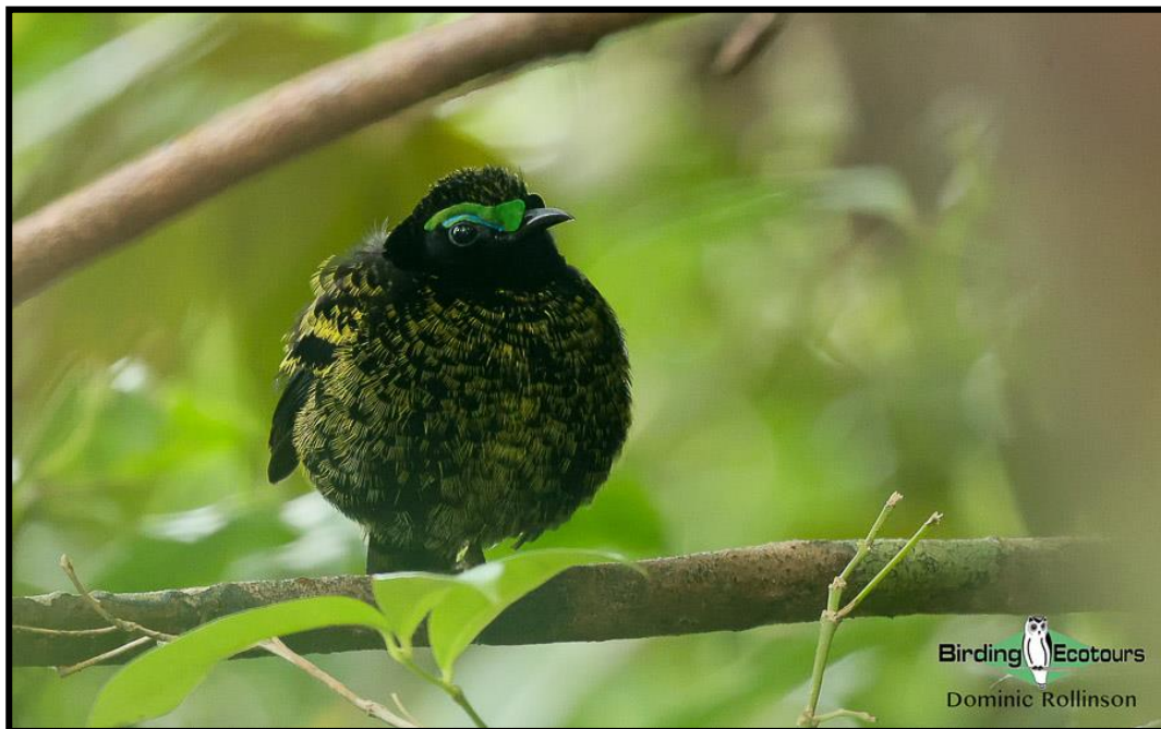
The strange Velvet Asity can be incredibly confiding at times.