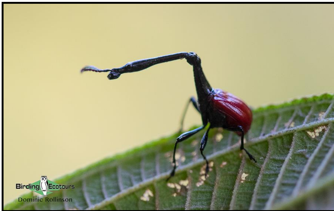
Giraffe-necked Weevil - Madagascar is well-known for its bizarre-looking wildlife.