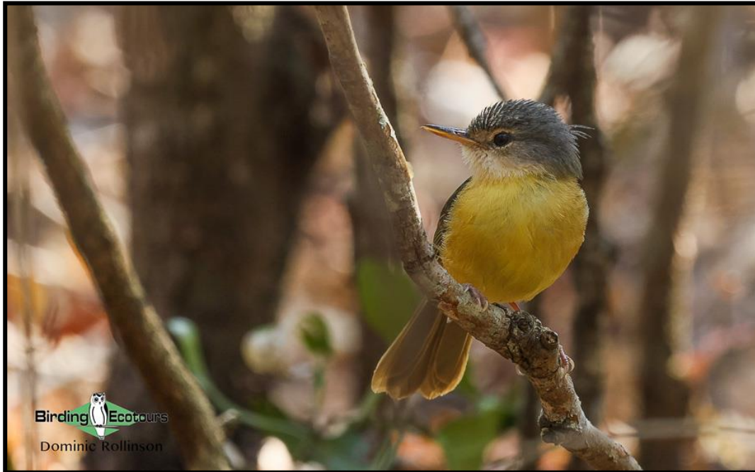
The range-restricted Appert's Tetraka can be seen in Zombitse National Park.