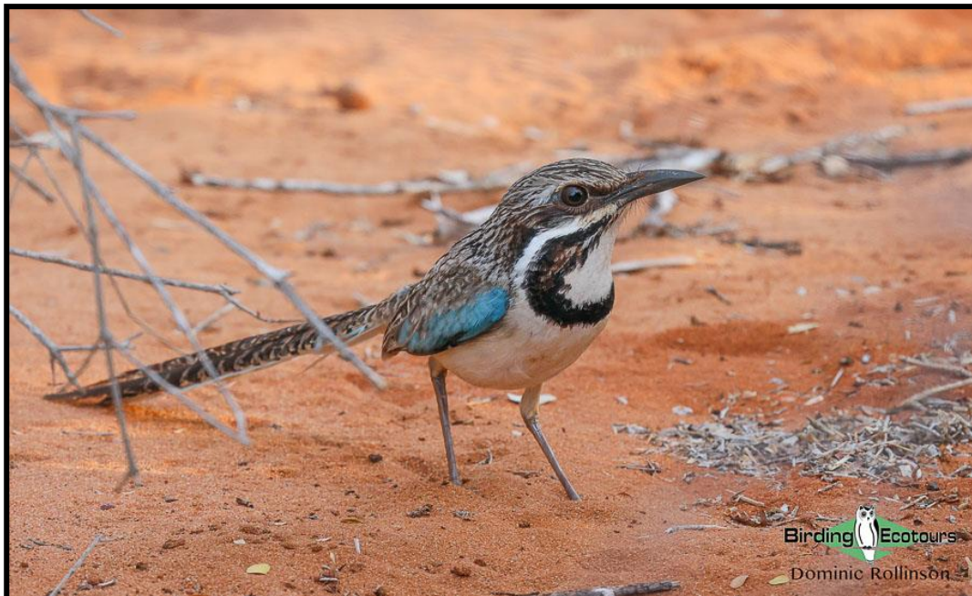
Long-tailed Ground Roller occurs in the spiny forest near Isalo.

Overnight: Arboretum d'Antsokay, near Toliara