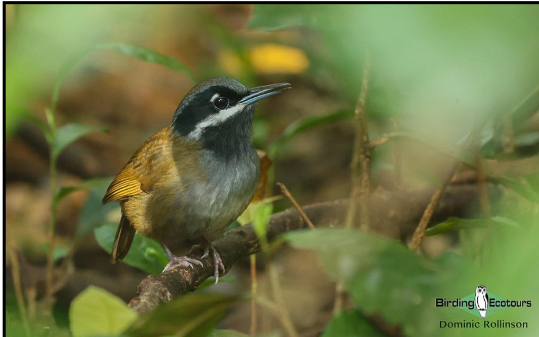
Crossley's Vanga is one of the many vanga species we are likely to see on this tour.