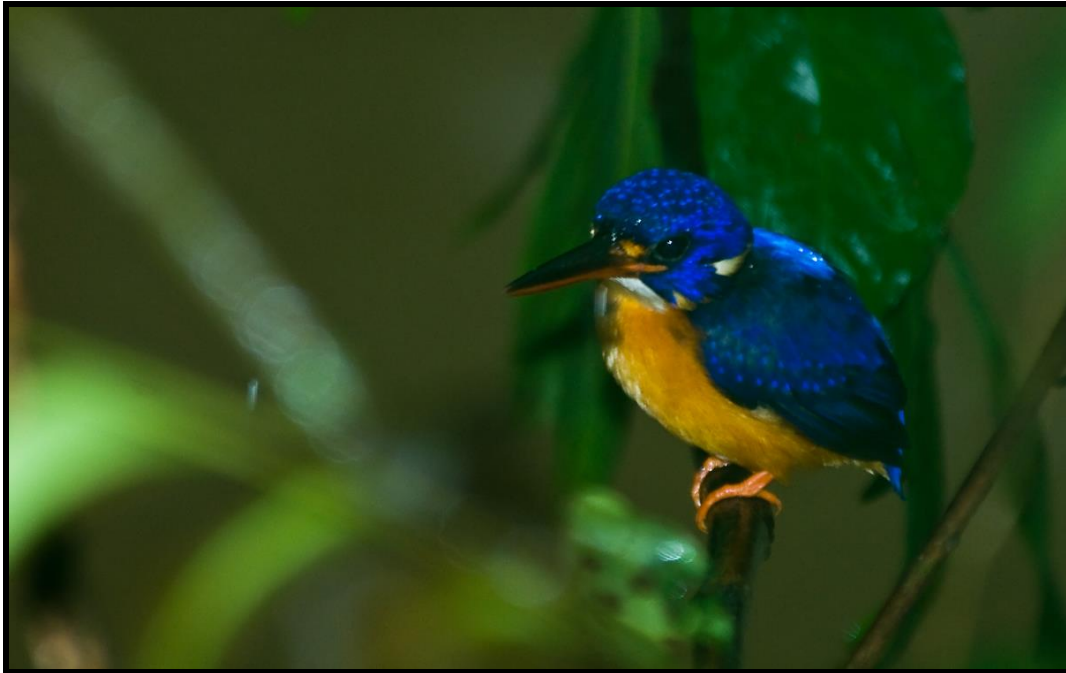
New Britain Dwarf Kingfisher is one of several regional endemic species we will look for on our New Britain birding tour.