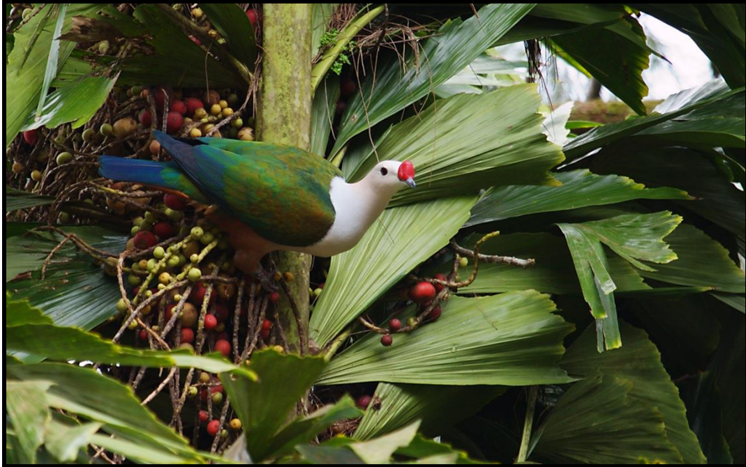
The striking Red-knobbed Imperial Pigeon will be a target while birding in New Britain.