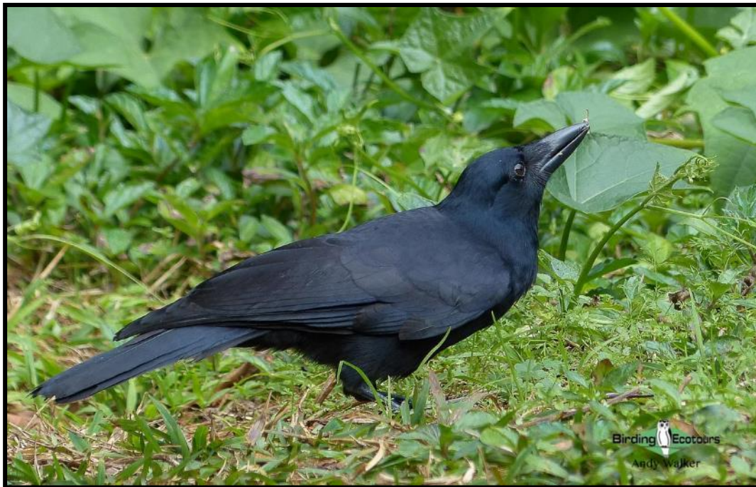
New Caledonian Crow is a fascinating species because it uses tools to forage.

This small group, short tour visits the island of Grande Terre, New Caledonia, and focuses on the many exciting endemic birds found across the island. New Caledonia is an ancient island archipelago comprised of over 100 islands of Gondwanan (continental) origin, our tour visits the largest island of Grande Terre. Starting in Nouméa the capital city, we travel north along the western coastline to Bourail while exploring some of the most picturesque national parks on the island, before finishing back in Nouméa. Most of the island is covered in tropical evergreen forest at higher elevations, while savanna and maquis dominate the lower elevations. Most famous for being the home of the unique Kagu (a highly sought-after monotypic family), Grande Terre hosts over 20 endemic birds as well as about a dozen more Melanesian endemics. We will spend time birding dense evergreen forests in the stunning Parc des Grandes Fougères (Great Tree Fern Park), various wetlands and coastal sites, and maquis and dry forests of La Farino reserve and the extensive Parc de la Rivière Bleue. Parc de la Rivière Bleue is renowned to birdwatchers, being the home of our prime target and New Caledonia's endemic star bird, the charismatic Kagu . We have two full days within the park to ensure a good chance of seeing this iconic species well.