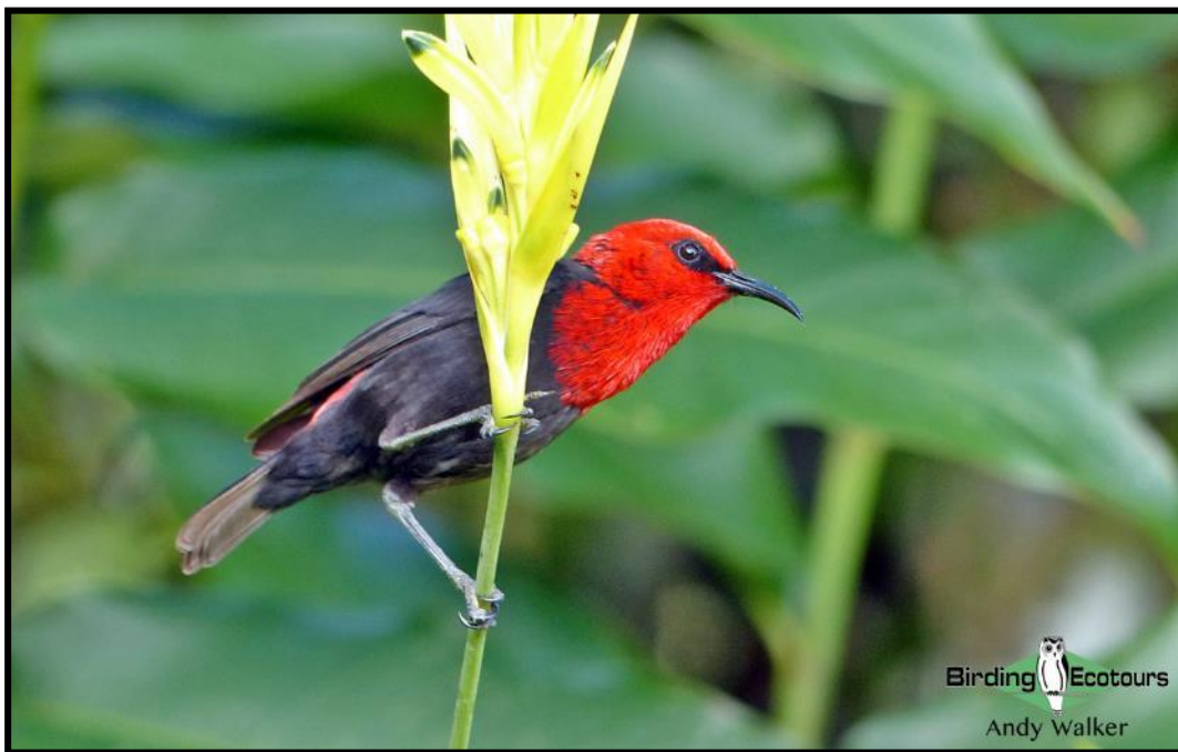
The striking Cardinal Myzomela can be found on the smaller islands of Lifou and Ouvea.

If you would like to extend your time in New Caledonia, we can offer extensions to visit either, or both, of the nearby islands of Lifou and Ouvea (both part of New Caledonia). These islands are home to several endemic and range-restricted species not found on the main island of Grande Terre such as Ouvea Parakeet , Small Lifou White-eye , Large Lifou White-eye , Red-bellied Fruit Dove , Melanesian Whistler , Cardinal Myzomela , and Blue-faced Parrotfinch . Please just ask us about these optional extras and we would be happy to help.