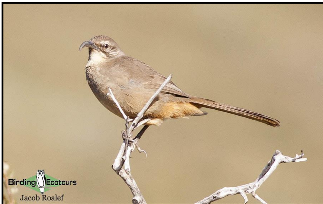
California Thrasher is typically found in thickets and shrubs.