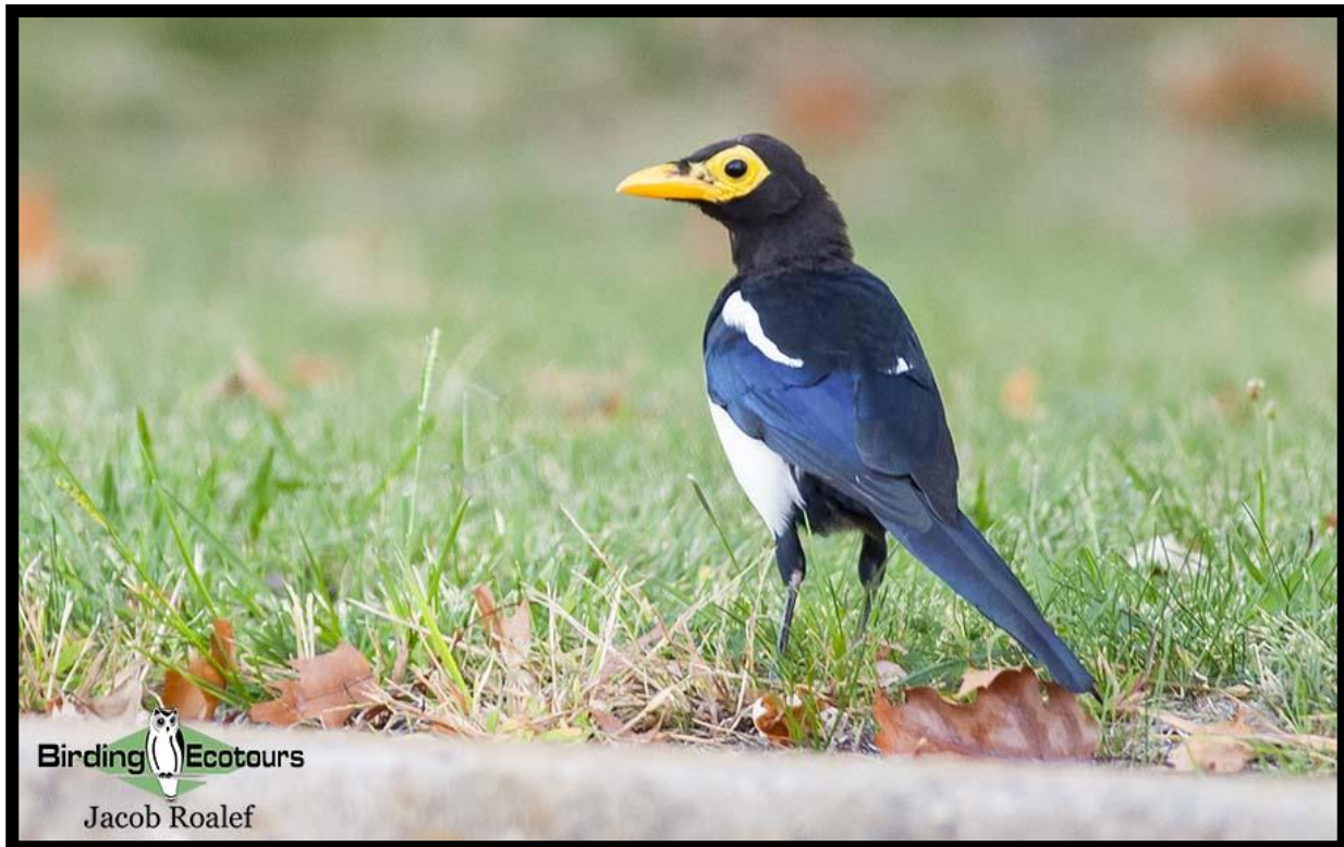
The bold Yellow-billed Magpie is a top target and endemic to California.