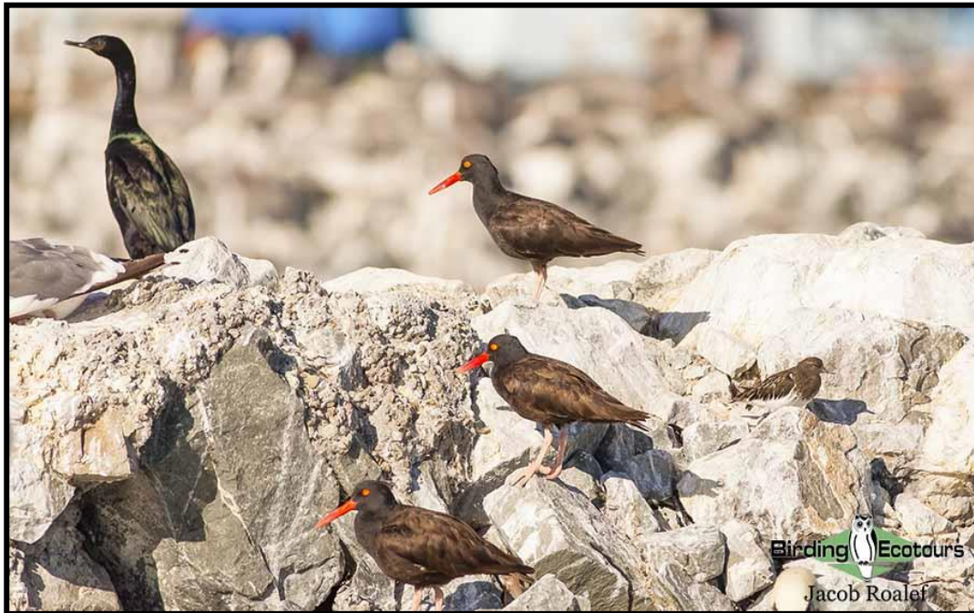
A typical coastal mix of Pelagic Cormorant, Black Oystercatchers, and Black Turnstone.