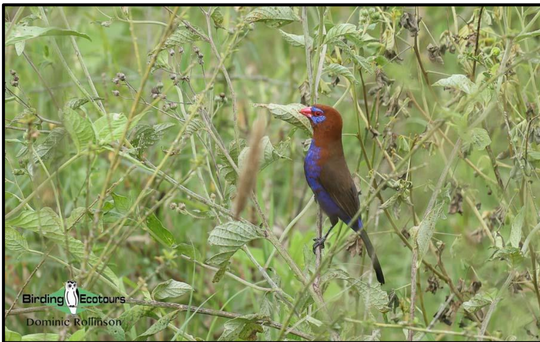
The gorgeous Purple Grenadier is readily encountered in northern Tanzania.

After breakfast we will make our way out of Arusha and arrive at Lake Manyara National Park in the late morning. Here we usually add quite a number of birds to our list and will enjoy a picnic lunch while being distracted by many exciting bird species. In the forested areas we'll be on the lookout for Narina Trogon , Grey Cuckooshrike , Mountain Wagtail , Crowned Hornbill , and the huge Silvery-cheeked Hornbill , among others. In the more open woodland, we should hopefully find Spotted Palm Thrush , Red-and-yellow Barbet , White-bellied Tit , Banded Parisoma , Rufous Chatterer , Rufous-tailed Weaver , Steel-blue and Straw-tailed Whydahs , and Purple Grenadier . The reserve is particularly good for raptors and some of our targets today include Lappet-faced and White-backed Vultures , Bateleur , Crowned Eagle , African Hawk-Eagle , African Goshawk , Verreaux's Eagle-Owl and the diminutive Pearl-spotted Owlet .