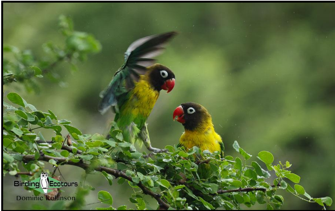
The endemic Yellow-collared Lovebird is one of our many colorful targets on this trip.

This northern Tanzania birding tour is designed to give you the opportunity to experience the real Africa , given just 10 days. Where else can you see Leopard, Cheetah, Lion , and a hundred spectacular bird species in a single day? Where else can you see Africa's highest mountain ( Kilimanjaro ) and two of the world's most famous game parks (the Serengeti and the spectacular Ngorongoro Crater )? This northern Tanzania birding tour not only offers an impressive diversity of localized bird species but also incredible wildlife sightings, most importantly the mind-blowing wildebeest migration through the Serengeti, which simply must be seen to be believed!