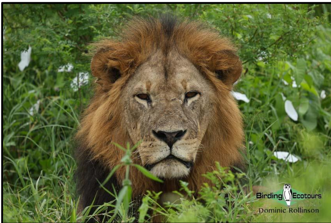
The Serengeti supports large numbers of Lions.

This morning we embark on a spectacular journey that few people will ever forget. If you've never been to Africa before, you're likely to be amazed by African Elephant , African Buffalo , and the sheer number of bird species. After an exciting drive we'll reach the Serengeti, where we enjoy the huge and impressive wildebeest migration, not to mention the large numbers of Plains Zebras and Thomson's Gazelles . Other megafauna that we'll search for include Topi , Common Eland , Grant's Gazelle , Bohor Reedbuck , and Masai Giraffe . This is one of the best places on the planet to see big cats – we've sometimes seen Lion , Leopard , and Cheetah in a single day, as well as some of the smaller cats such as Serval and Caracal . Finding a kill should allow us to see a good number of vulture species, such as Rüppell's , White-backed , Lappet-faced , White-headed , and Hooded Vultures .