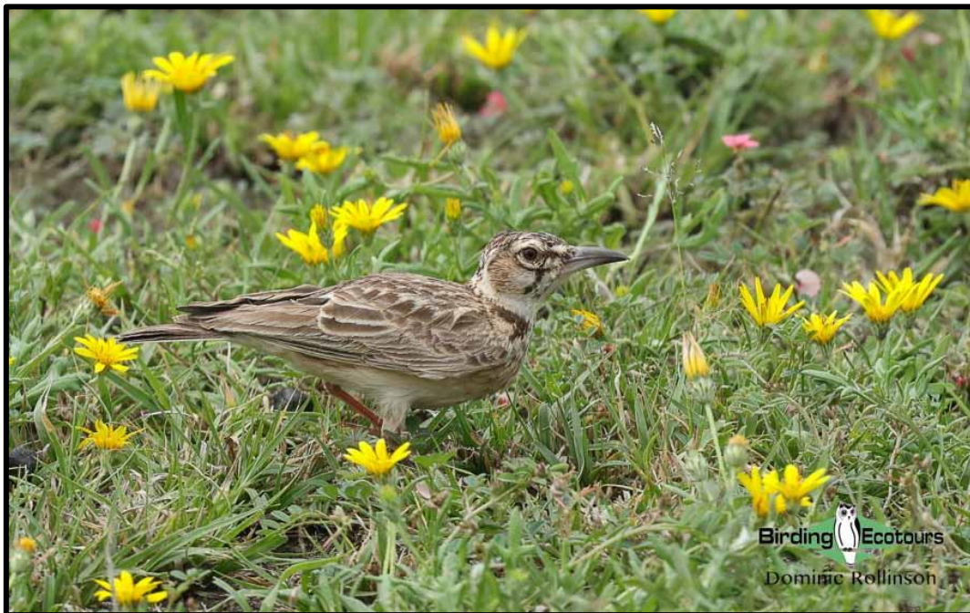
The distinctive Short-tailed Lark will be searched for alongside the rare Beesley's Lark .

We will spend time birding the (aptly named) Lark Plains for the rare and localized Beesley's Lark (less than 200 remaining) along with a host of other lark species, including Fawn-colored, Short-tailed, Athi Short-toed, and Rufous-naped Larks and Fischer's Sparrow-Lark . Other species for which we keep an eye out for on the plains include Kori Bustard, Eastern Chanting Goshawk, Greater Kestrel, Temminck's and Double-banded Coursers, Yellow-throated and Chestnut-bellied Sandgrouse, Abyssinian and Capped Wheatears, Taita Fiscal , and numerous others.