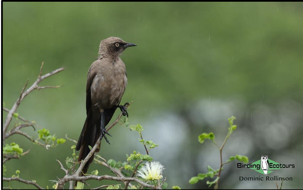
Ashy Starlings are numerous in Tarangire National Park.