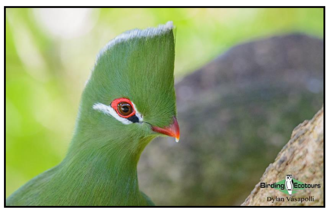
Getting good photos of Knysna Turaco will be one of our major objectives in the Garden Route.

We begin our South Africa birding and photo tour in the Garden Route – an idyllic area of green forests and beautiful lakes that you truly will not want to leave. Here, we'll probably find the jewel-like Half-collared Kingfisher, the gorgeous (there is no better word for it) Knysna Turaco with its green body and scarlet wings, and a rich diversity of other birds – plus some nice mammals, as always. You could spend two weeks just here, photographing birds and other wildlife and of course the stunning scenery.