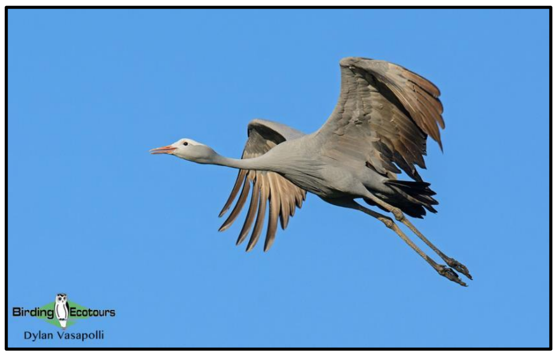
The Western Cape is a stronghold for Blue Cranes , South Africa's national bird.

Overnight: De Hoop Collection, De Hoop National Park