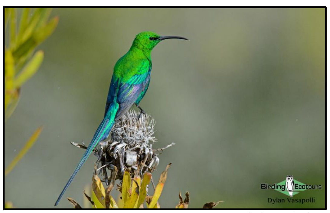
Flowering proteas are popular with birds, such as this Malachite Sunbird.

Today we will spend the day to the east of Cape Town in the Hottentots Holland Mountains, where we will be targeting several <u>Cape endemics</u>. The drive to our destination is a spectacular one; the route straddles the False Bay coastline, with dramatic fold mountains on the opposite side. During the drive we may get lucky with sightings of whales in False Bay, such as Bryde's Whales . Our first stop will be at the quaint coastal town of Rooi Els, where we will search the rocky mountain slopes for Cape Rockjumper . Other important birds to look for on the slopes include Cape and Sentinel Rock Thrushes , Cape Siskin , Ground Woodpecker , and perhaps Verreaux's Eagle overhead. The thicker fynbos nearby will be searched for Cape Sugarbird (frequently posing on top of Protea flowers), Orange-breasted and Malachite Sunbirds , Cape Bulbul , Grey-backed Cisticola , and Karoo Prinia . Victorin's Warbler also occurs in this habitat, although visuals of this skulking fynbos endemic are usually brief.