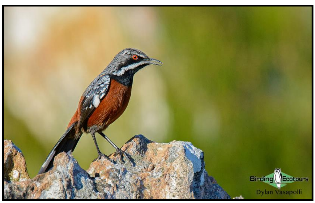
Cape Rockjumper is one of the most prized birds on this tour!

Eventually we head back to the coast – but this time the west coast. In the <u>West Coast National Park</u> and other great sites, we hope to encounter Common Ostrich , Black Harrier , Southern Black Korhaan , Cape Penduline Tit , Grey-winged Francolin , and other stunning (and often very localized) birds. We will also look for new mammals, such as the west coast endemic Heaviside's Dolphin , the strange Rock Hyrax (which looks like a large rodent but is more closely related to elephants), and others.