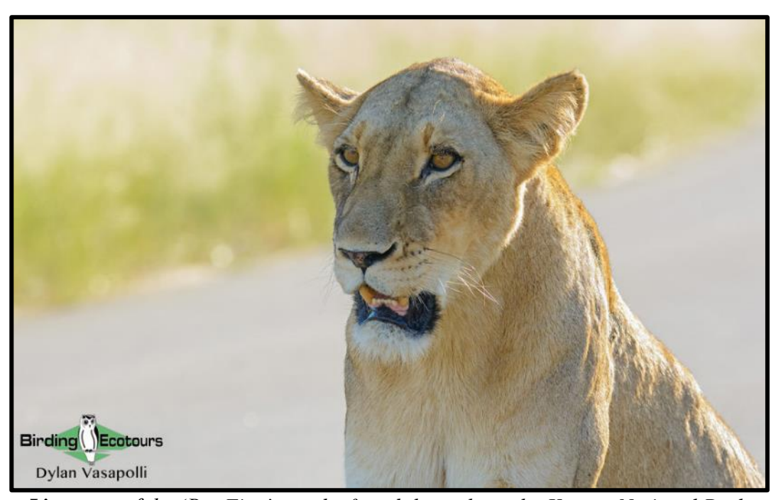
Lion , one of the 'Big Five', can be found throughout the Kruger National Park.

Depending on flight times this morning, we may have time for some last-minute forest birding, targeting anything we may have missed over the last couple of days. Cape Town International Airport is only a 20-minute drive from our accommodation, from where we will take a flight to the Kruger Mpumalanga International Airport for the Kruger National Park leg of this trip.