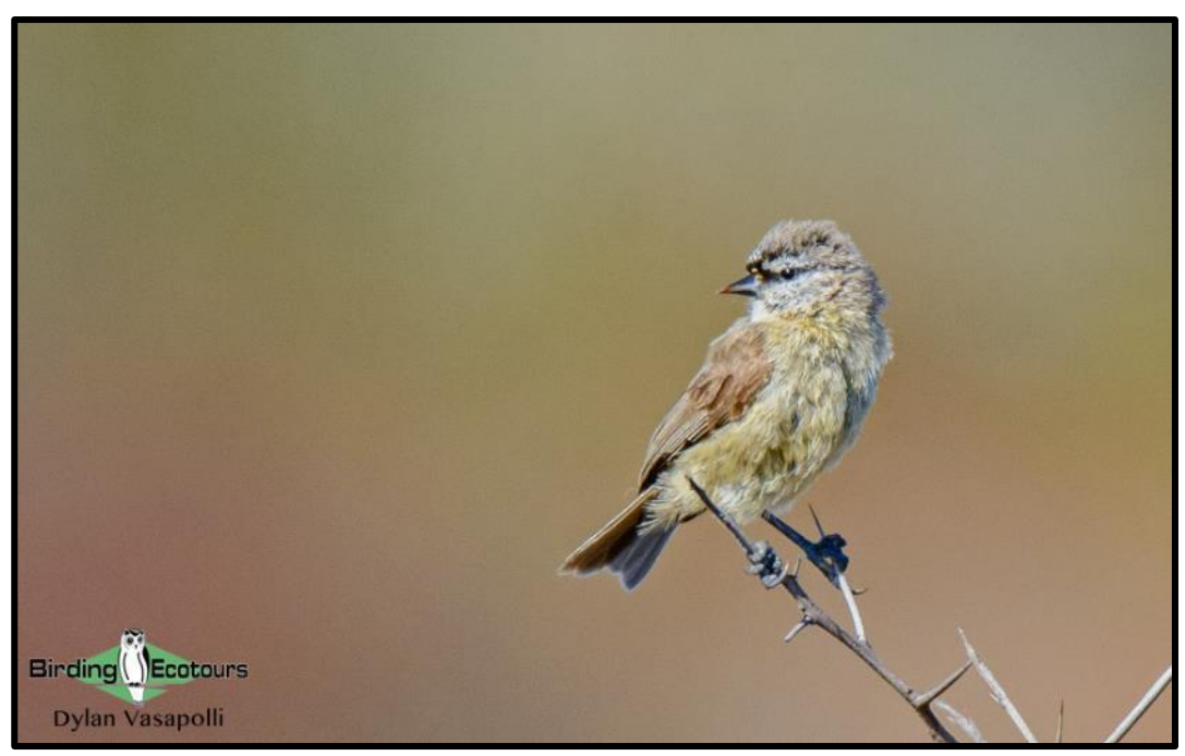
The tiny Cape Penduline Tit can be reliably seen in the West Coast National Park.