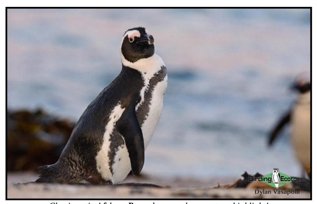
Charismatic African Penguins are always a tour highlight!

From Cape Town, we fly to the Kruger Mpumalanga International Airport, and begin the second part of this exciting photo trip. Here we spend five days at one of Africa's greatest game parks, the <u>Kruger National Park</u>. We have a good chance of photographing the "<u>Big Five</u>" as well as a host of other, smaller mammals. <u>Kruger</u> is one of the richest national parks for mammals on the entire African continent. What's more, it also has over 500 bird species, most of which are extremely easy to see in the dry woodlands and savanna – you will see multiple species of brightly colored and spectacular rollers, bee-eaters, storks, eagles, vultures, hornbills, and more.