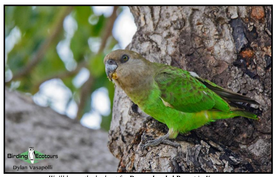
We'll be on the lookout for Brown-headed Parrot in Kruger.

Kori Bustard, Martial Eagle, Bateleur, Saddle-billed Stork, Verreaux's Eagle-Owl, Southern Ground Hornbill, and Lappet-faced Vulture, while the smaller, more colorful species include Brown-headed Parrot, Greater Blue-eared Starling, Lilac-breasted Roller, Grey-headed Bushshrike, White-browed Robin-Chat, Scarlet-chested Sunbird, Blue Waxbill, Golden-breasted Bunting and a host of kingfishers, barbets, bee-eaters, hornbills, and weavers – and so much more. The above-mentioned species are just a small sampling of some of the exciting possibilities that await us in Kruger – this truly is an incredibly diverse area, with over 500 bird species and 100 mammal species recorded from within the reserve.