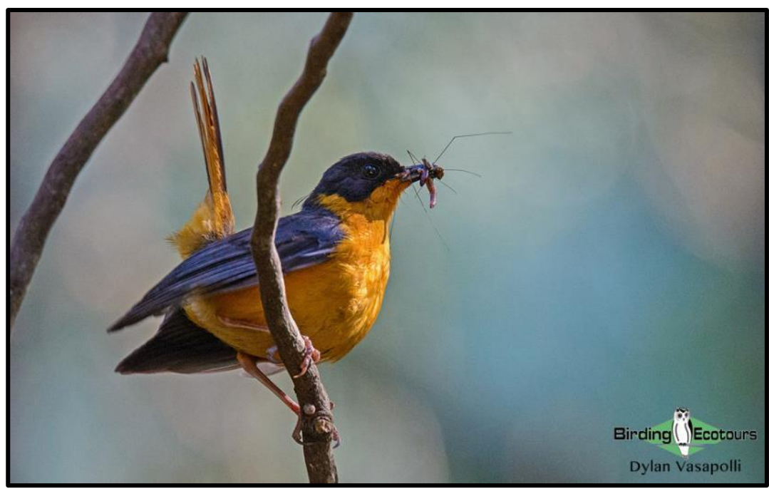
The bright Chorister Robin-Chat occurs in the forests of the Garden Route.