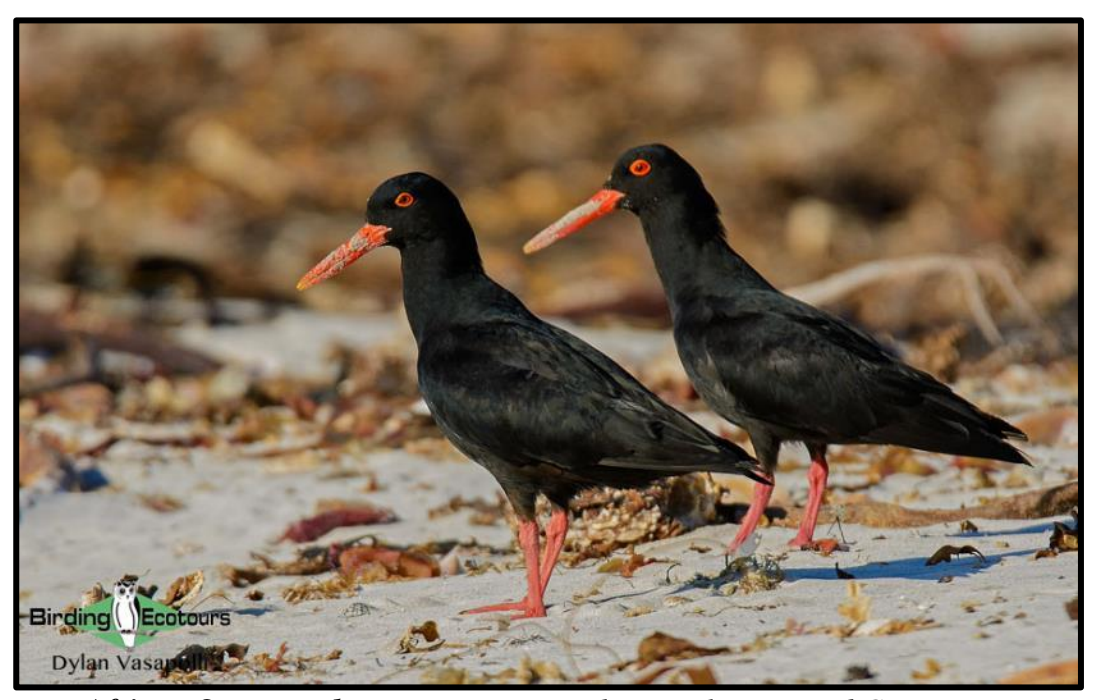
African Oystercatchers are present on the coastline around Cape Town.

Overnight: Fernwood Manor, Newlands (or similar)