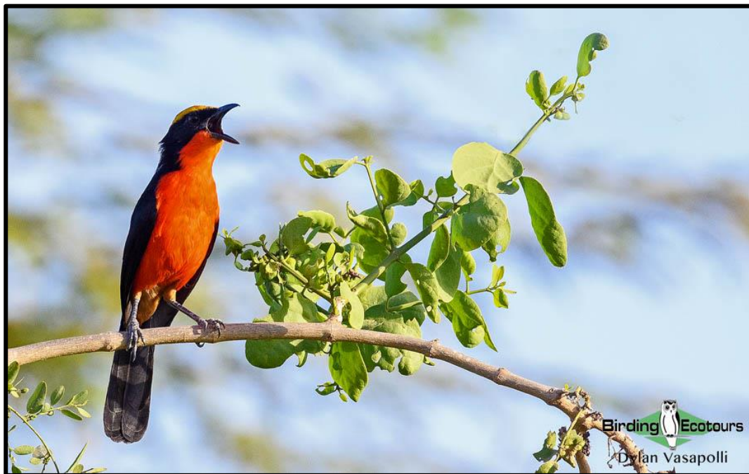
Vibrant Yellow-crowned Gonoleks add much to the surrounding arid landscapes.