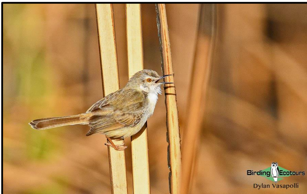
River Prinia is another important target species here – fortunately they are common!