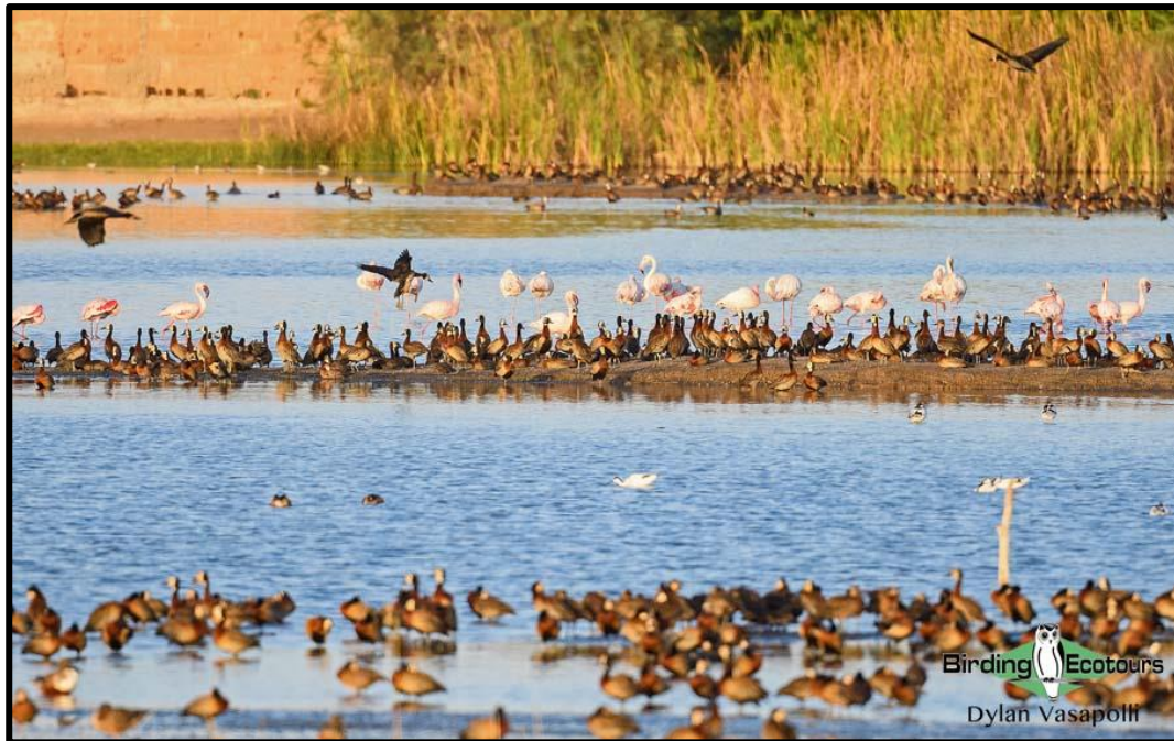
The Djoudj wetlands support vast numbers of birds.

Overnight: Campement Villageois du Djoudj