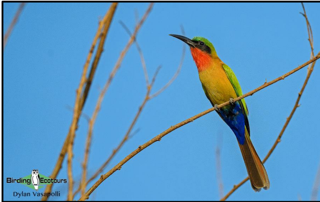
Bright Red-throated Bee-eaters will also feature from our boat trips at Wassadou.