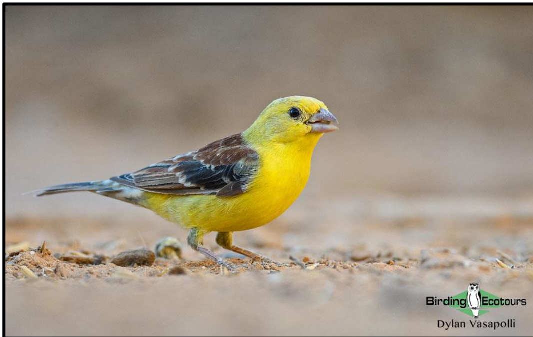
Sudan Golden Sparrows are a common sight in the far northern parts of Senegal.