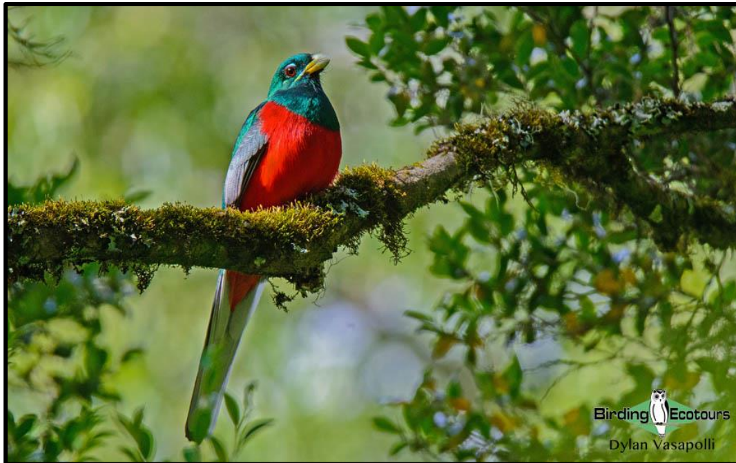
We have a number of chances to see the stunning Narina Trogon on this tour!

We have specially crafted this unusually comprehensive birding tour of mega-diverse (from both a bird and mammal point of view) Eastern South Africa, allowing us sufficient time to adequately cover and explore all the key areas, without compromising on rushed visits which lack the time required to both find and enjoy the birds on offer. To further add to the experience, this tour uses open-top safari vehicles for the two full days in the Kruger National Park which ensures guests make the most of their time in the African bush. As always, we also err on the side of superior accommodation, and we therefore call this a “premium” tour yet the overall price is still reasonable mainly because South Africa is arguably the best value country on the entire continent.