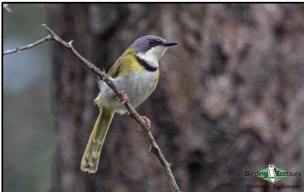
Rudd's Apalis is another Zululand specialty we should get whilst traversing the region!

Overnight: St Lucia Wetlands Guest House, St Lucia