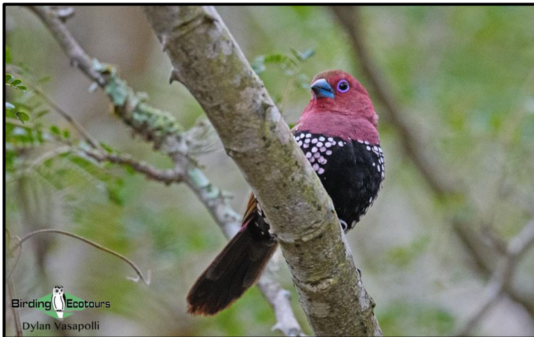
Pink-throated Twinspot is one of the specials of the Zululand region.

Zululand, probably the most bird-diverse corner of South Africa, is next on our agenda, and not only does it have a great many species, but there are several very localized ones, basically only occurring here and in southern Mozambique – e.g. Pink-throated Twinspot , Lemon-breasted Canary and Neergaard's Sunbird . This also is big mammal country and one of the world's strongholds for Black and White Rhinoceros , is very good for Leopard , and also hosts a variety of mammals not likely to be seen in Kruger – including Samango Monkey , Nyala , the absolutely tiny Suni antelope, etc.