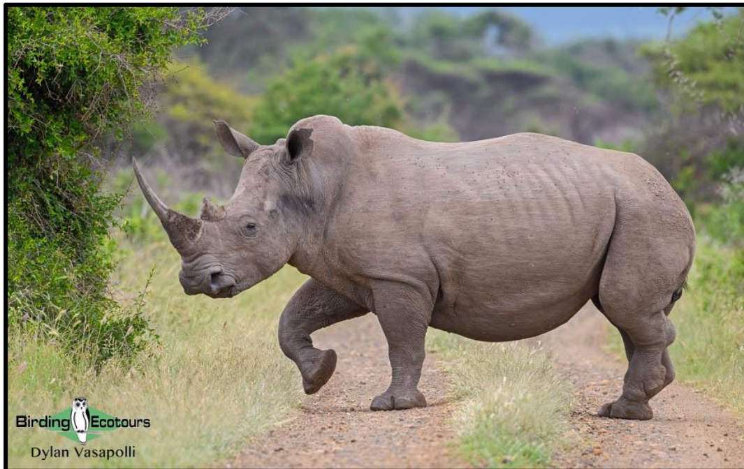
Whilst in Kruger, mammals, such as this White Rhinoceros , are major targets!

Overnight: Skukuza Rest Camp or similar, Kruger National Park