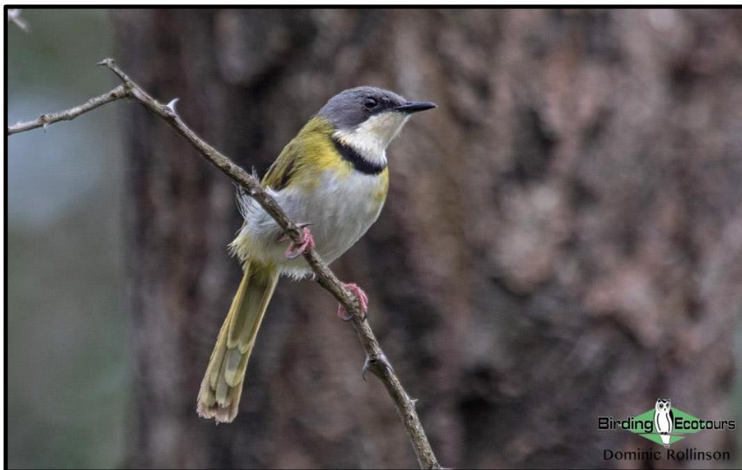
Rudd's Apalis is another Zululand specialty we should get whilst traversing the region!

Overnight: St Lucia Wetlands Guest House, St Lucia