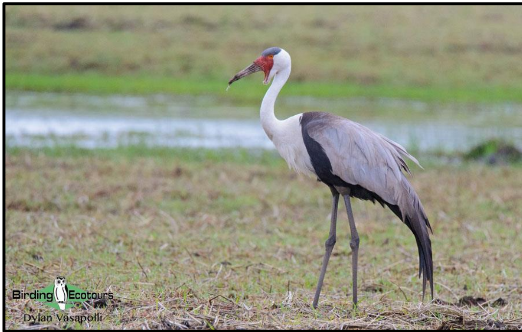
Wattled Crane is a rare species in South Africa, and will be a major target on this tour!

Overnight: Birds of Paradise B&B, Eshowe