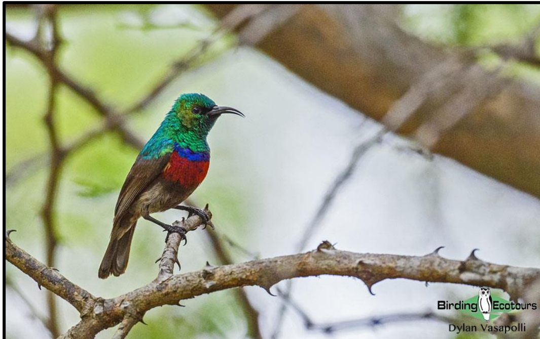
The rare Neergaard's Sunbird is one of the top targets of Mkhuze, and indeed the tour!

Other species to be found here include the likes of the sought-after African Pygmy Goose and African Openbill while more regular birds include White-faced Whistling Duck , Black Crake , Water Thick-knee , African Jacana , Whiskered Tern , African Spoonbill , Squacco and Black Herons and Pied Kingfisher . The trees on the edge of the pan support the dazzling Broad-billed Roller , along with an array of woodpeckers, kingfishers, barbets, honeyguides, bushshrikes, flycatchers, robins, sunbirds and weavers. Pel's Fishing Owl do occur in the area, but are nomadic and very rarely seen, and are more reliable on our tour to the Okavango Delta in Botswana/northern Namibia .