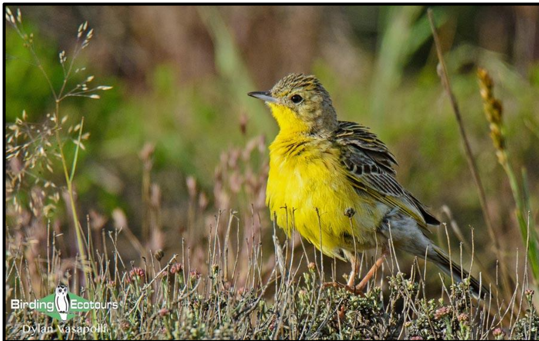
The highly sought-after endemic Yellow-breasted Pipit can be seen around Wakkerstroom!

Overnight: Forellenhof Guest Farm, Wakkerstroom