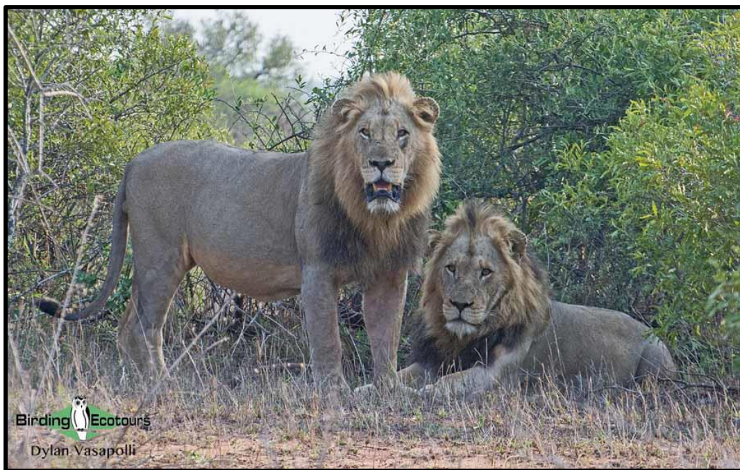
Majestic Lions , one of Africa’s most iconic mammals, should be seen on this tour!

This subtropical (eastern) South Africa birding tour provides a representative sample of the very best that African birding can offer. Large numbers of species will be seen (the typical bird list for this adventure is in the range of 400 – 450 species for our October departures when migrants are present). Among these many birds, we encounter a lot of South African endemics such as the numerous localized denizens of the scenically spectacular Drakensberg Escarpment (the imposing “Barrier of Spears” as locals call it). Apart from yielding hundreds of bird species, this dream African experience also provides the possibility of seeing Lion, Cheetah, Leopard, African Elephant, White and Black Rhinoceros, Hippopotamus, Giraffe, Burchell’s Zebra , multiple antelope species, Nile Crocodile , and many other large (and small) animal species, with breathtaking scenery as a backdrop. We also often get feedback that the accommodation on this tour is great and indeed South Africa has an unsurpassed infrastructure of brilliant value B&Bs/lodges as well as good roads, compared to anywhere else in Africa.