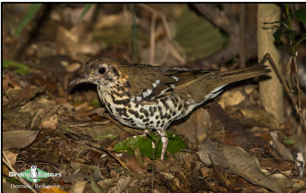
The scarce Spotted Ground Thrush is a big target while we’re based in Eshowe.

Overnight: Birds of Paradise B&B, Eshowe