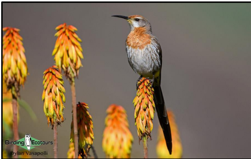
Gurney's Sugarbird is one of many highly sought-after birds occurring in the Drakensberg!