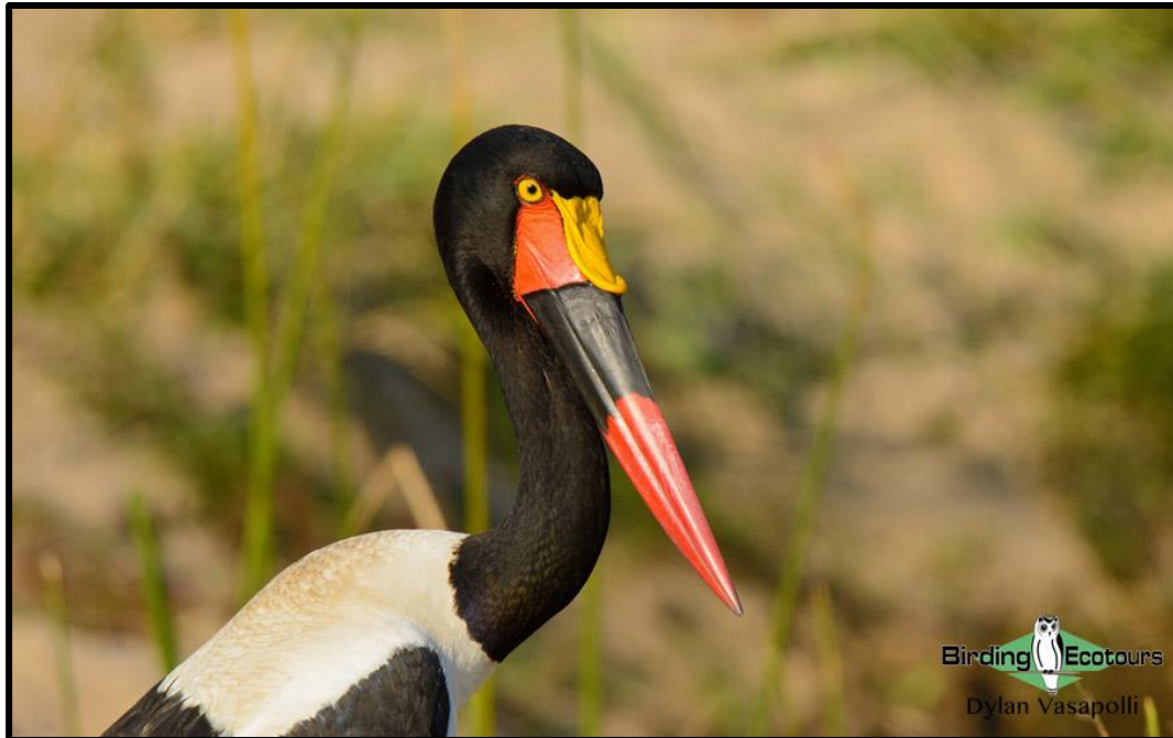
Kruger is home to a vast array of birds as well, including the Saddle-billed Stork!