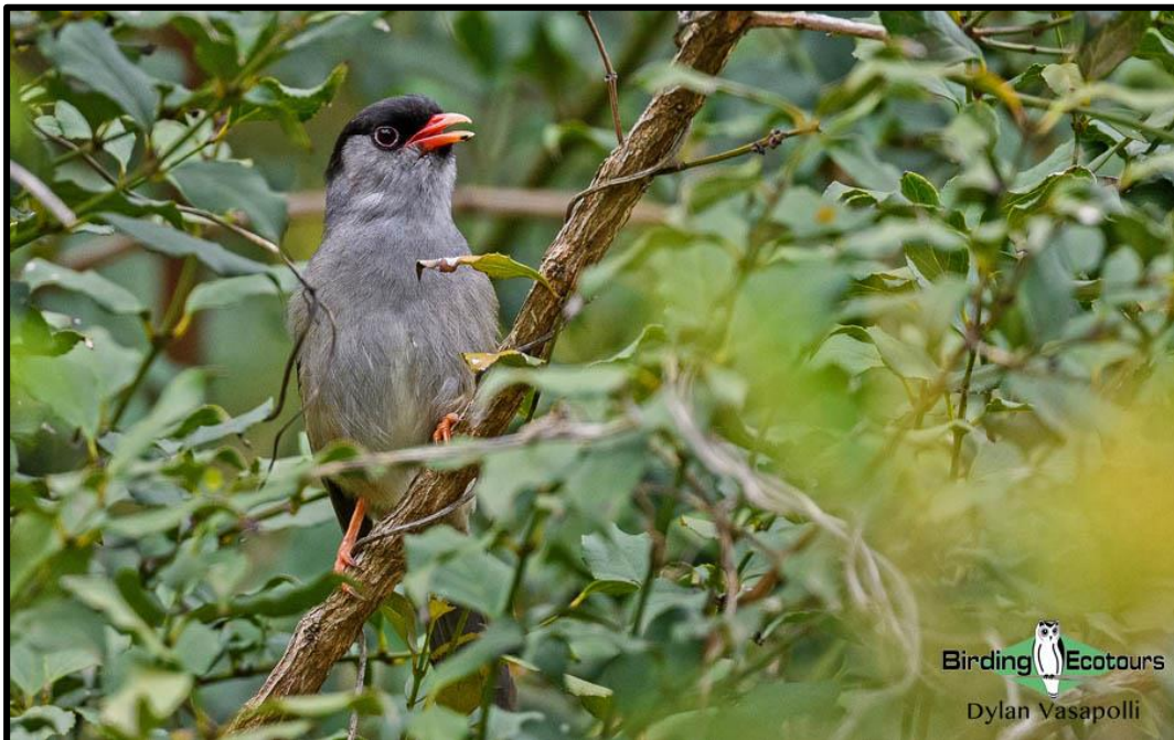
The secretive Bush Blackcap occurs in the foothills of the Drakensberg Mountains!