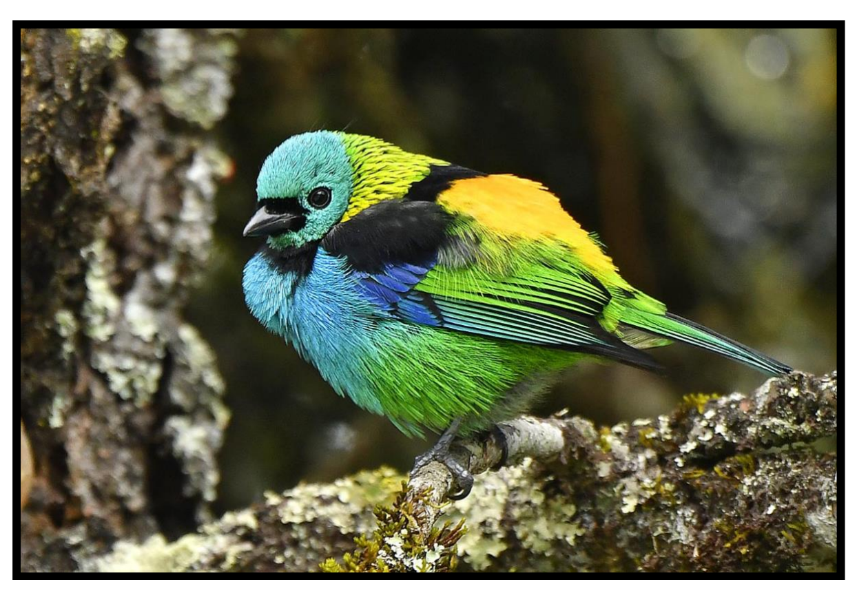
Green-headed Tanager is one of the many tanagers we will target on this tour.