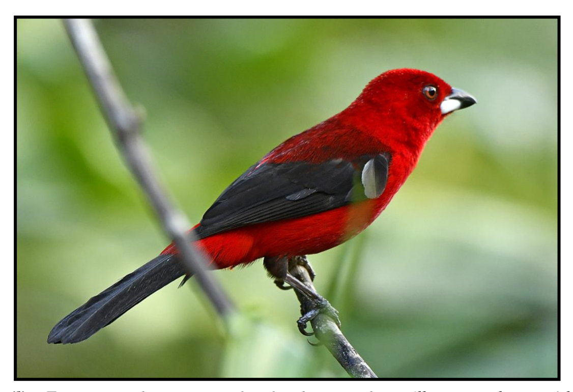
Brazilian Tanager, another outrageously colored tanager that we'll target on this tour.