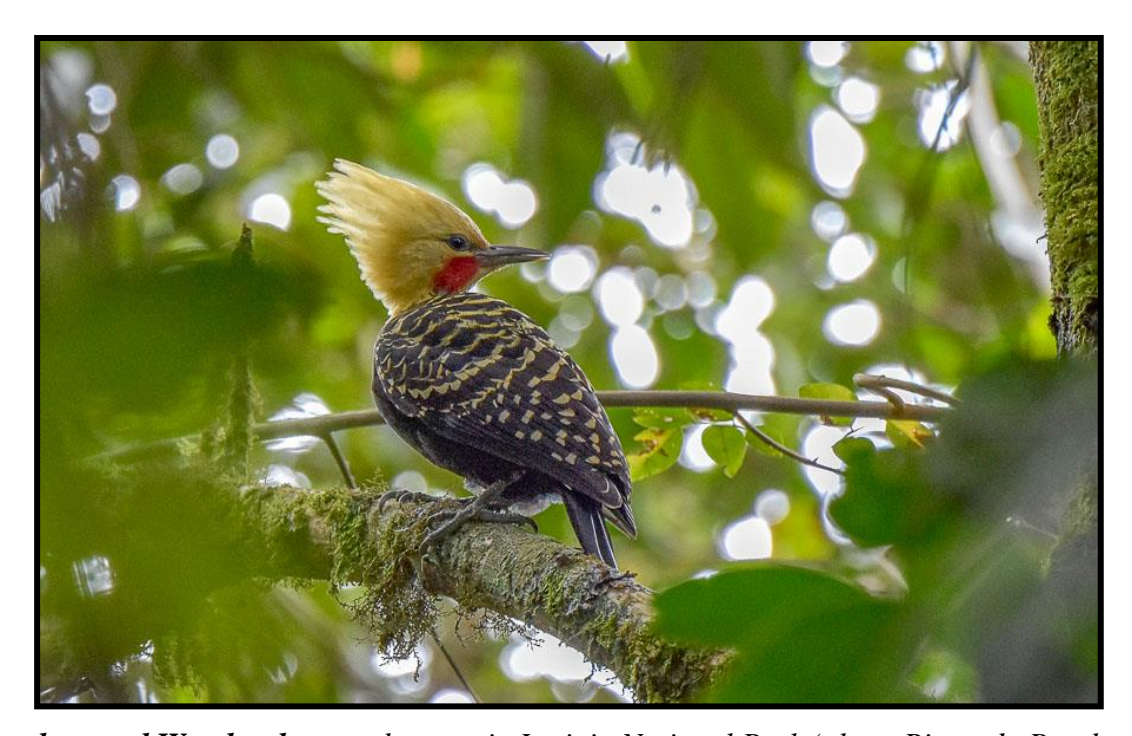
Blond-crested Woodpecker can be seen in Itatiaia National Park.