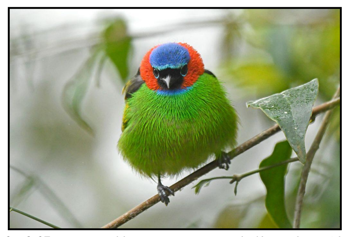
Red-necked Tanager — one of the many tanager species we should see on this tour.

Overnight: Casa Pica Pau, Intervales State Park