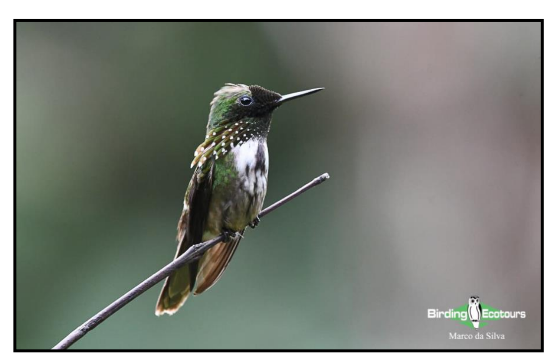
Festive Coquette is one of the many specials we will look for around Ubatuba.

We then will continue to the well-known Ubatuba area, where we will be delighted by species such as Blond-crested Woodpecker, Bare-throated Bellbird, Spotted Bamboowren, Forktailed Tody-Tyrant, and Festive Coquette.