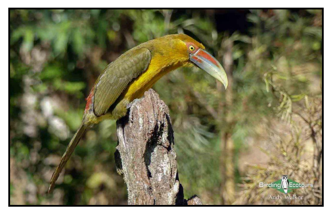
Several toucans and toucanets can be seen on this tour, including Saffron Toucanet.