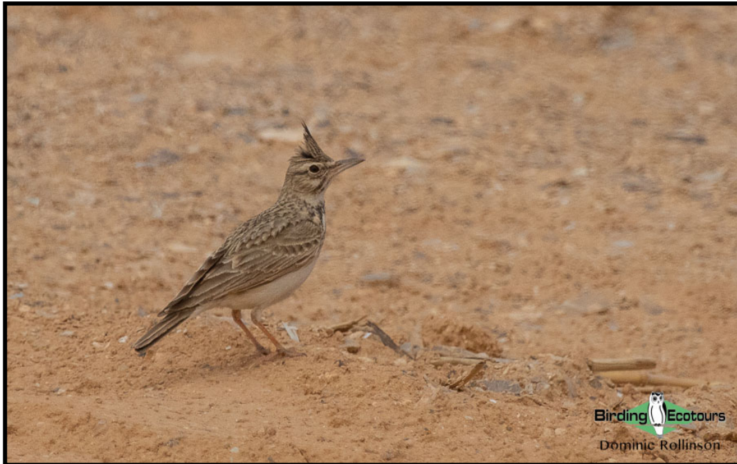
The grazing pastures around Tarifa are an excellent area for Crested Lark .