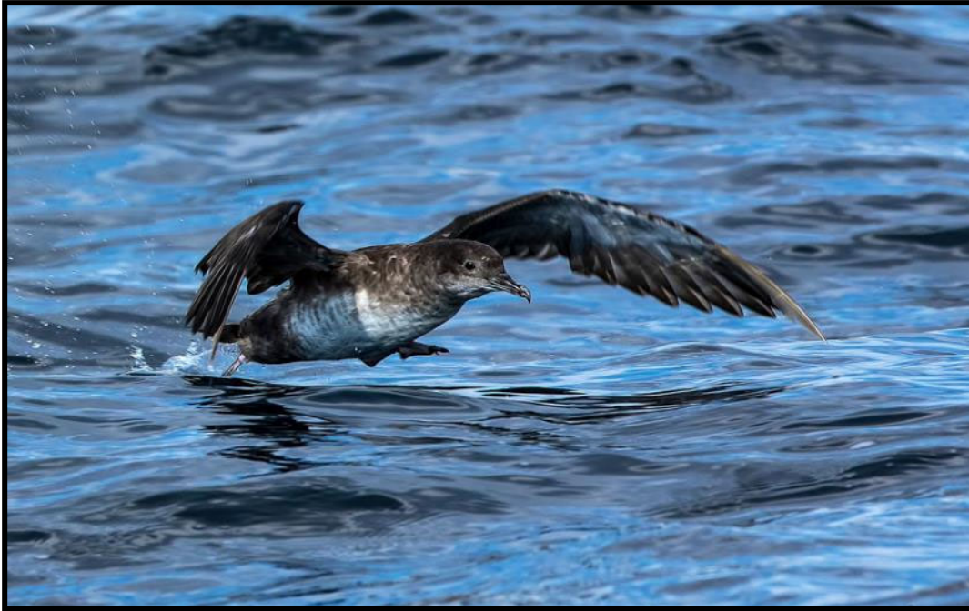
Our pelagic trip will give us excellent views of seabirds like Balearic Shearwater.