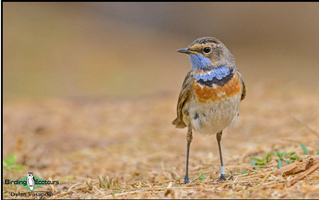
We may find the colorful Bluethroat on this tour.

We are also in suitable terrain to search for Iberian Ibex . This fantastic-looking goat is split into four subspecies, two of which are extinct, with the subspecies in the Gredos area being known as Western Spanish (Gredos) Ibex.