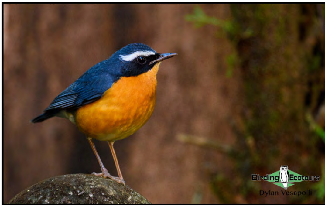
We will look on the ground for the gorgeous Indian Blue Robin .