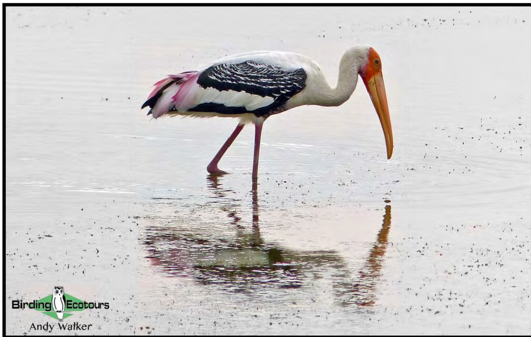
Painted Stork can be seen in Udawalawe National Park.

The birds on offer here include Sri Lanka Woodshrike, White-bellied Sea Eagle, Green Bee-eater, Blue-faced Malkoha, Coppersmith Barbet, Yellow-eyed Babbler, Rosy Starling, Jacobin Cuckoo, Grey-bellied Cuckoo, Jerdon's Bush Lark, Ashy-crowned Sparrow-Lark, Indian Pitta, White-browed Fantail, Little Swift, Brahminy Starling, Paddyfield Pipit, Blyth's Pipit, Orange-breasted Green Pigeon, Spot-billed Pelican, Yellow-wattled Lapwing, Painted Stork, Woolly-necked Stork, Indian Peafowl, Indian Robin, Black-winged Kite, and Indian Stone-curlew. Migrant species like Red-rumped Swallow (with paler red belly and rump). Western Yellow Wagtail, White Wagtail, and Citrine Wagtail may show up too.