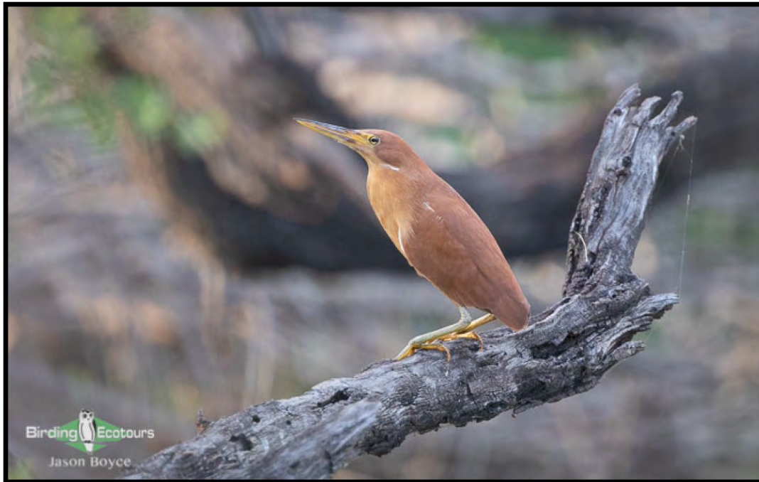
Cinnamon Bittern can be seen at Bundala National Park.

Western Reef Heron, Striated Heron, Little Egret, Black-headed Ibis, Glossy Ibis, Eurasian Spoonbill, Black-necked Stork, Little Cormorant, Indian Cormorant, Oriental Darter, Spot-billed Pelican, Yellow-wattled Lapwing, Black-tailed Godwit, Garganey, Northern Pintail, Northern Shoveler, Caspian Tern, White-winged Tern, Whiskered Tern, Common Tern, Greater Crested Tern, Lesser Crested Tern, Little Tern, Brown-headed Gull, and Greater Flamingo. Other species possible in the area include Clamorous (Indian) Reed Warbler, Eurasian Hoopoe, Ashy-crowned Sparrow-Lark, Brown Fish Owl, Yellow-crowned Woodpecker, and Ashy Drongo.