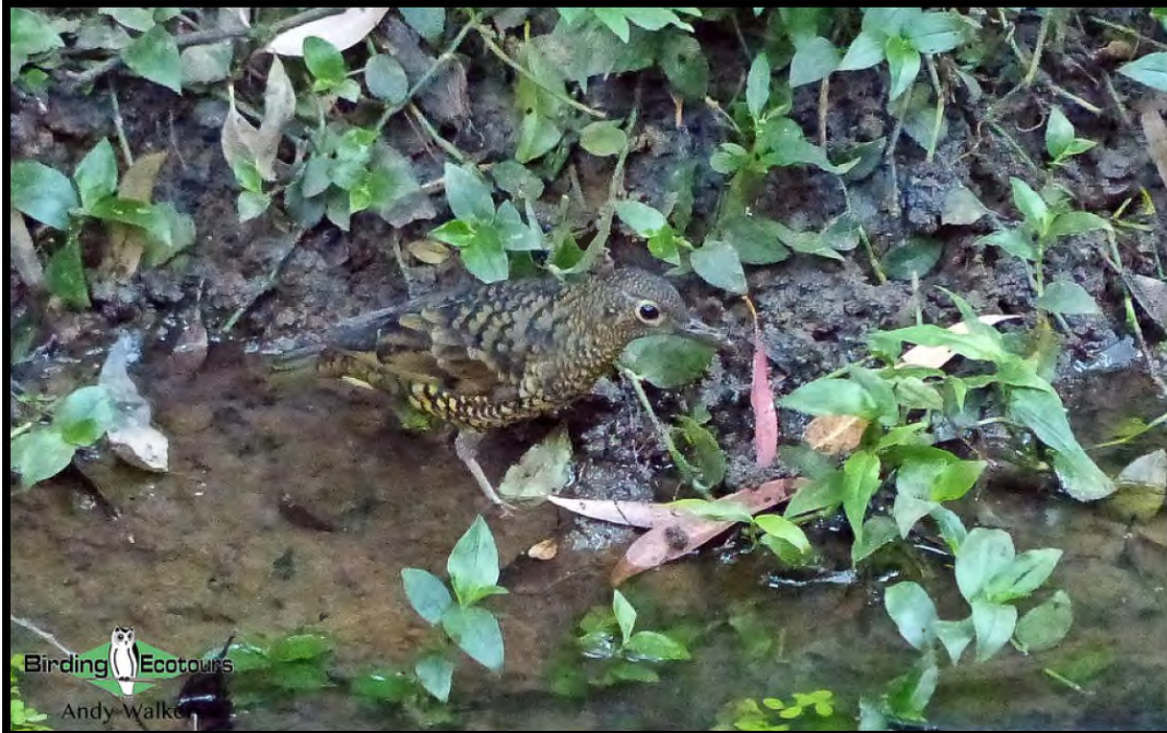
The secretive Sri Lanka Thrush , another highly sought endemic that skulks along the ground