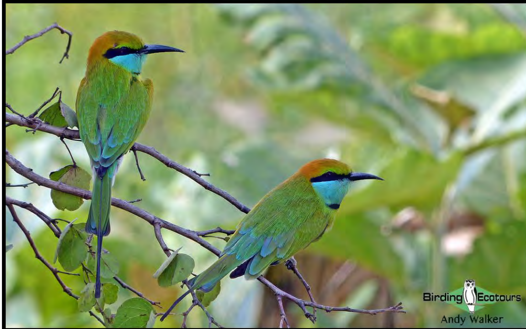
Green Bee-eater is one of the species we hope to encounter in Udawalawe National Park.

As dusk approaches we will look for Indian Nightjar and Jerdon's Nightjar in the scrub near our accommodation, likely serenaded by a chorus of Indian Pittas as the sun sets.