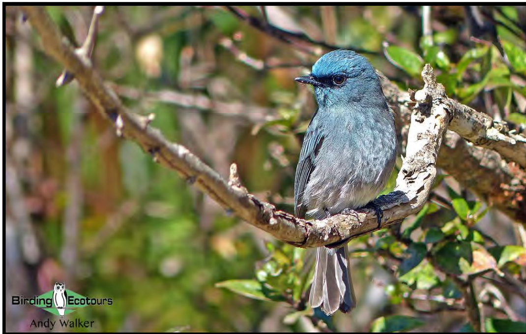
The endemic Dull-blue Flycatcher is found in the mountains of Sri Lanka.