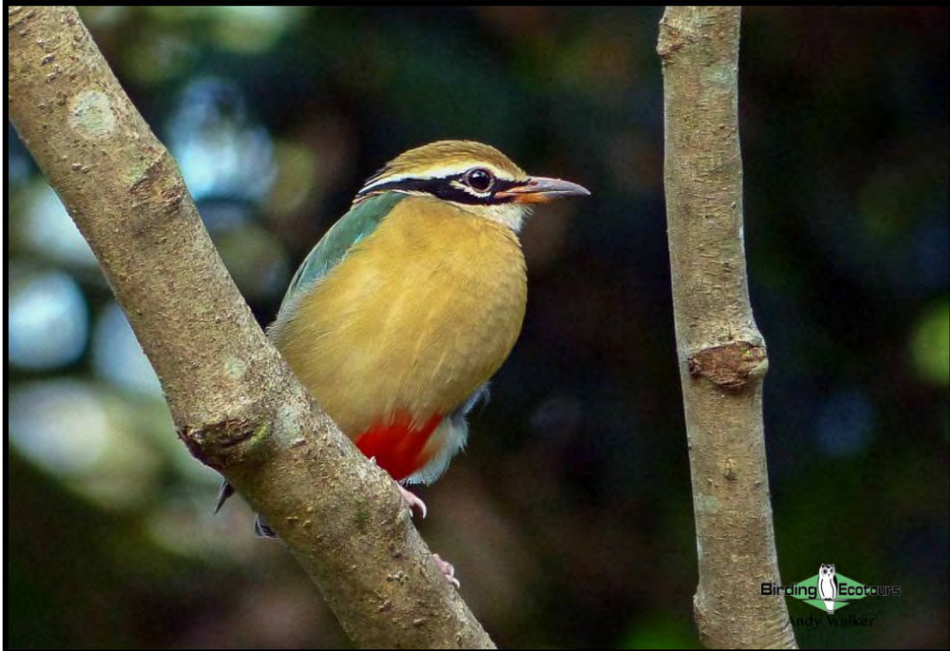
The stunning Indian Pitta spends its non-breeding season in Sri Lanka.