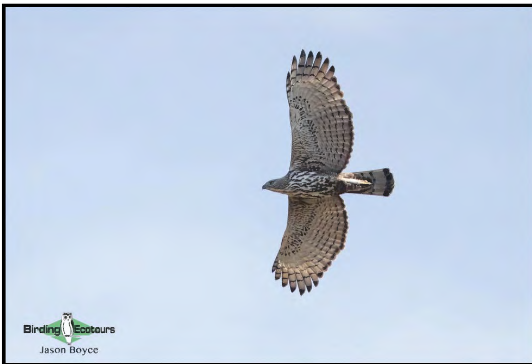
Changeable (Crested) Hawk-Eagle is one of a number of raptors to see on this tour.

Roadside birding in Sri Lanka is refreshingly good. Blue-tailed Bee-eater, White-throated Kingfisher, White-bellied Drongo, Indian Roller, Sri Lanka Swallow, Scaly-breasted Munia, Brown Shrike, Indian Jungle Crow, Yellow-billed Babbler, Oriental Magpie-Robin, and Ashy Woodswallow are often seen perched on wires. Though we will no doubt see them again and again, these wayside temptations will be hard to resist. The odd Crested Serpent Eagle and Changeable (Crested) Hawk-Eagle , sentinels on posts, will almost certainly bring our vehicle to a halt. The more common waterbirds such as Red-wattled Lapwing, Indian Pond Heron, Eastern Cattle Egret, Intermediate Egret, Black-winged Stilt, and Asian Openbill will certainly not be ignored either.