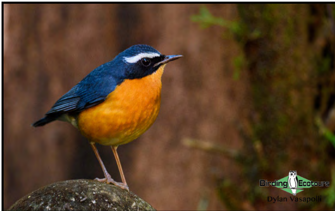
We will look on the ground for the gorgeous Indian Blue Robin .