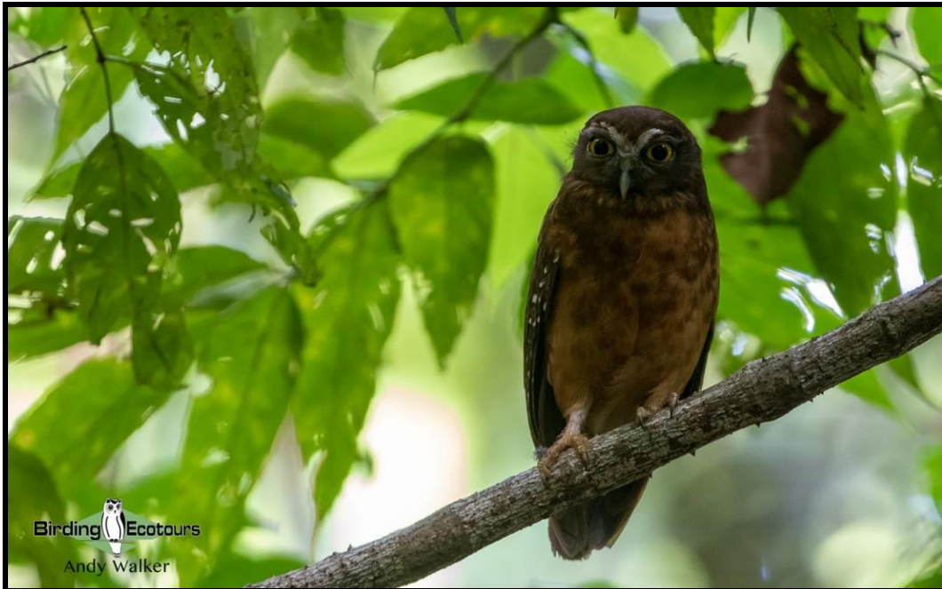
Endemic to Sulawesi, we will hope to find Ochre-bellied Boobook on its day roost!