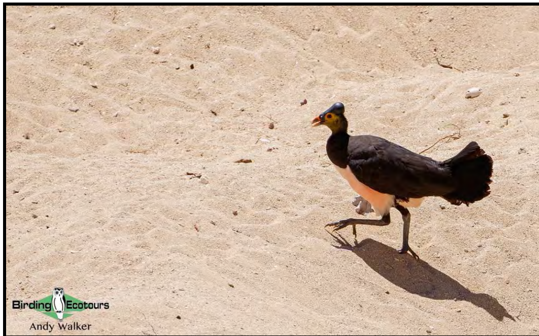
The Critically Endangered ( BirdLife International ) Maleo will be our main target today.

We will have a long day today as we look for one of the most charismatic birds of Sulawesi. We will make an early start after breakfast from Luwuk in order to reach Taima on the tip of eastern central Sulawesi in the morning, where we will hope to watch a breeding colony of Maleo at fairly close quarters. The set up at this site is great, with jobs provided to local people who help monitor and protect the birds, which has massively reduced hunting pressure on this now Critically Endangered ( BirdLife International ) species. We will view the breeding area (a sandy beach that looks like it has had bombs dropped on it, due to all the nest holes dug by the birds!) from blinds and/or a tower hide depending on whether you like heights or not. We will view the nesting area and the birds in small groups, so as not to disturb them.