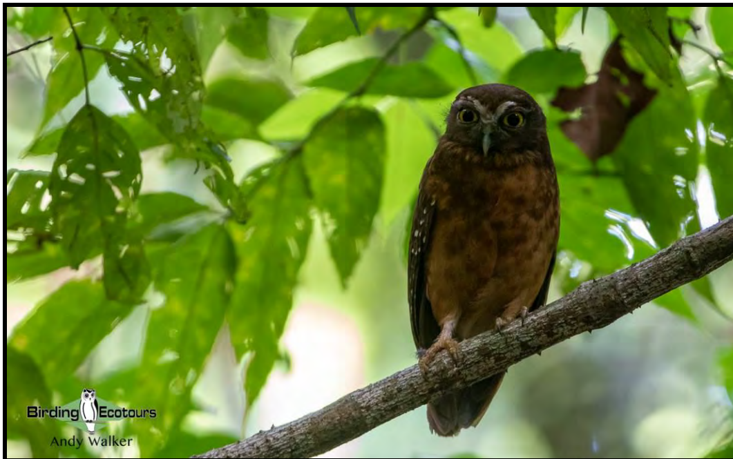
Endemic to Sulawesi, we will hope to find Ochre-bellied Boobook on its day roost!