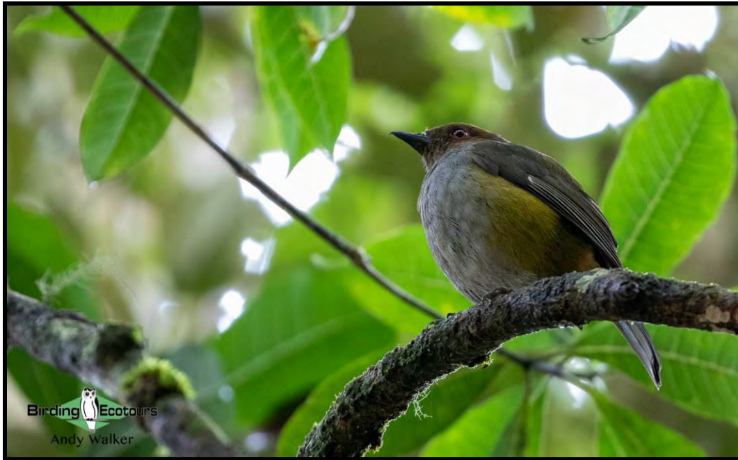
Hylocitrea is in a monotypic family and is thus a big target during this tour.

Lore Lindu National Park protects some of the largest tracts of montane rainforests remaining on Sulawesi. We will have two full days birding here as well as the morning of Day 15. We will likely focus our birding attention on two areas while here, the famed Anaso Track (considered a tough hike) and Lake Tambling. There are a lot of new birds for us here, with potential highlights including Hylocitrea (the monotypic family), Purple-bearded Bee-eater , Geomalia , Malia , Sulawesi Streaked Flycatcher , Sulawesi Woodcock , and Satanic Nightjar .