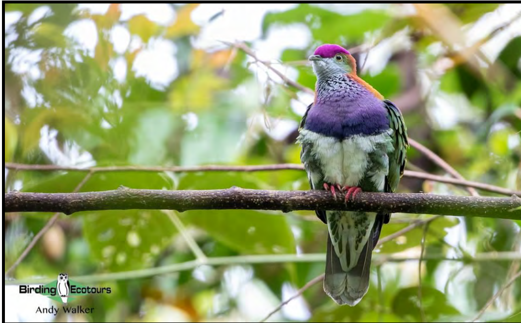
(Western) Superb Fruit Dove provides an incredible hit of color at Lore Lindu National Park and is one of many species of pigeons and doves we can hope for on this Sulawesi and Halmahera birding tour.

Overnight: Nasional Lodge, Lore Lindu Area