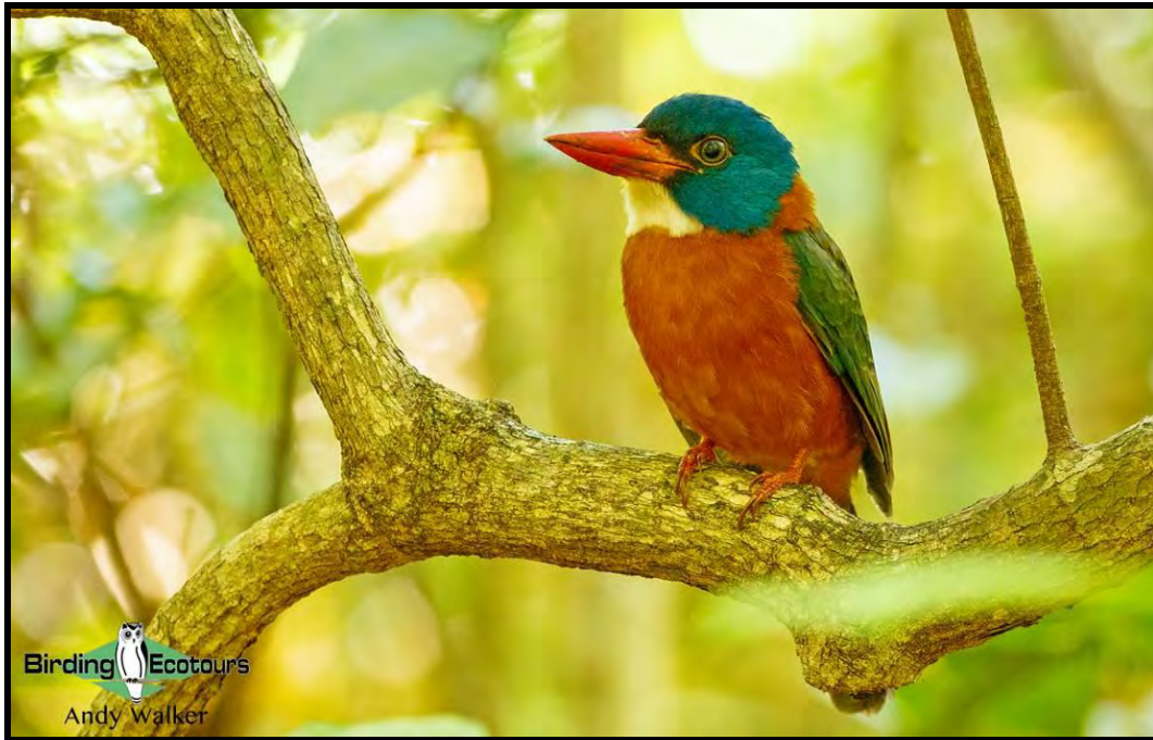
A Green-backed (Blue-headed) Kingfisher sits patiently in the forests of northern Sulawesi.

Kingfisher, Green-backed (Blue-headed) Kingfisher, and Sulawesi Dwarf Kingfisher ), the Hylocitrea (a highly sought-after monotypic family), the enigmatic Geomalia (an aberrant ground thrush), and the Satanic Nightjar in the mountains. Further to the aforementioned Standardwing , the island of Halmahera also supports the huge Ivory-breasted Pitta , several spectacular kingfishers such as Common Paradise Kingfisher, Blue-and-white Kingfisher, and Sombre Kingfisher , the unobtrusive Scarlet-breasted Fruit Dove , the bizarre Moluccan Owlet-nightjar , and Halmahera Paradise-crow (a member of the bird-of-paradise family).