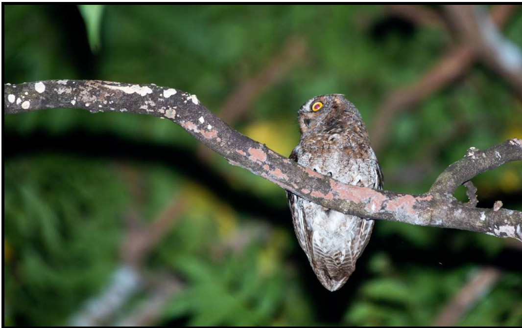
The endemic subspecies of Ryukyu Scops Owl can only be found on Lanyu Island and might warrant full species status as Lanyu Scops Owl in the future.

With an indigenous culture that is closer to that of the Philippines , Lanyu is a nice contrast to mainland Taiwan. Taiwan Green Pigeon , Philippine Cuckoo-Dove , Brown-eared Bulbul , Black (Japanese) Paradise Flycatcher , the endemic subspecies of Ryukyu (Lanyu/Elegant) Scops Owl , and Lowland White-eye are the main targets here and can be expected, as well as other passage passerines, possibly including raptors, shrikes, warblers, and buntings. It is a fun, small, island to explore and gives the opportunity to find some interesting species.