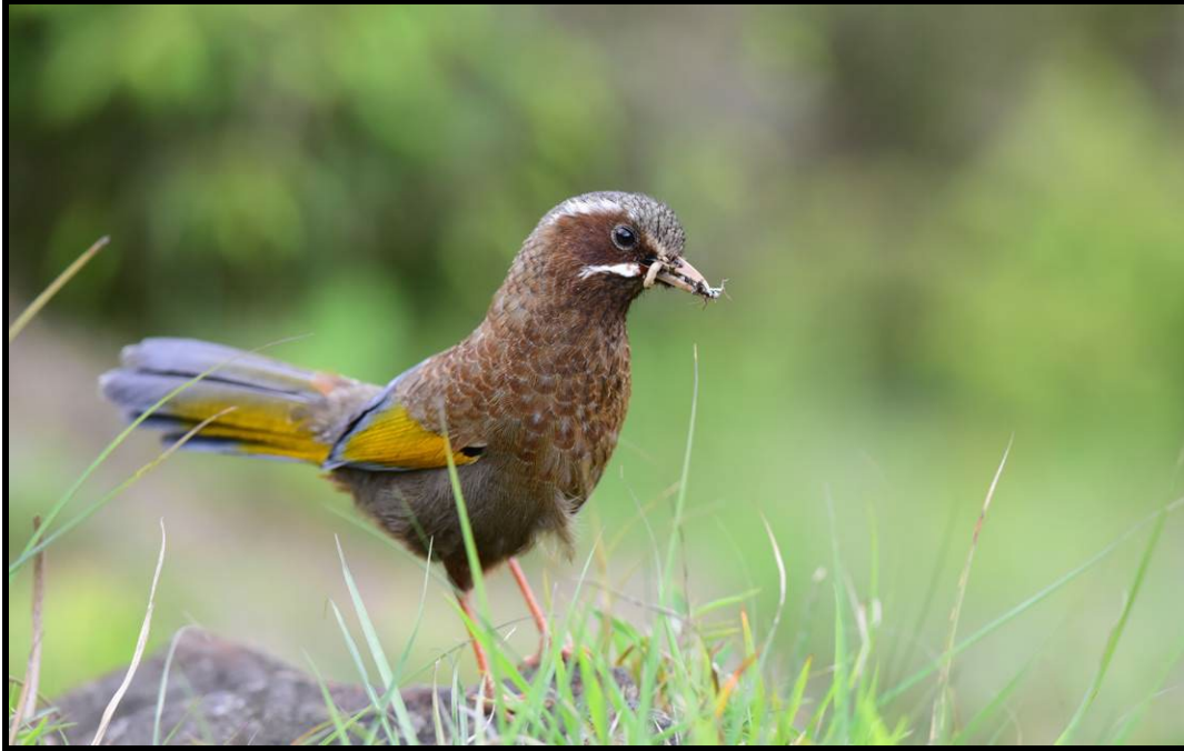
The endemic White-whiskered Laughingthrush is often incredibly confiding.