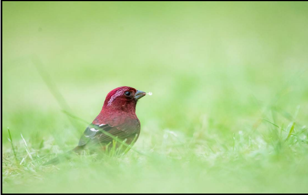
The gorgeous Taiwan Rosefinch can be found quietly eating seeds on the ground in the mountains.