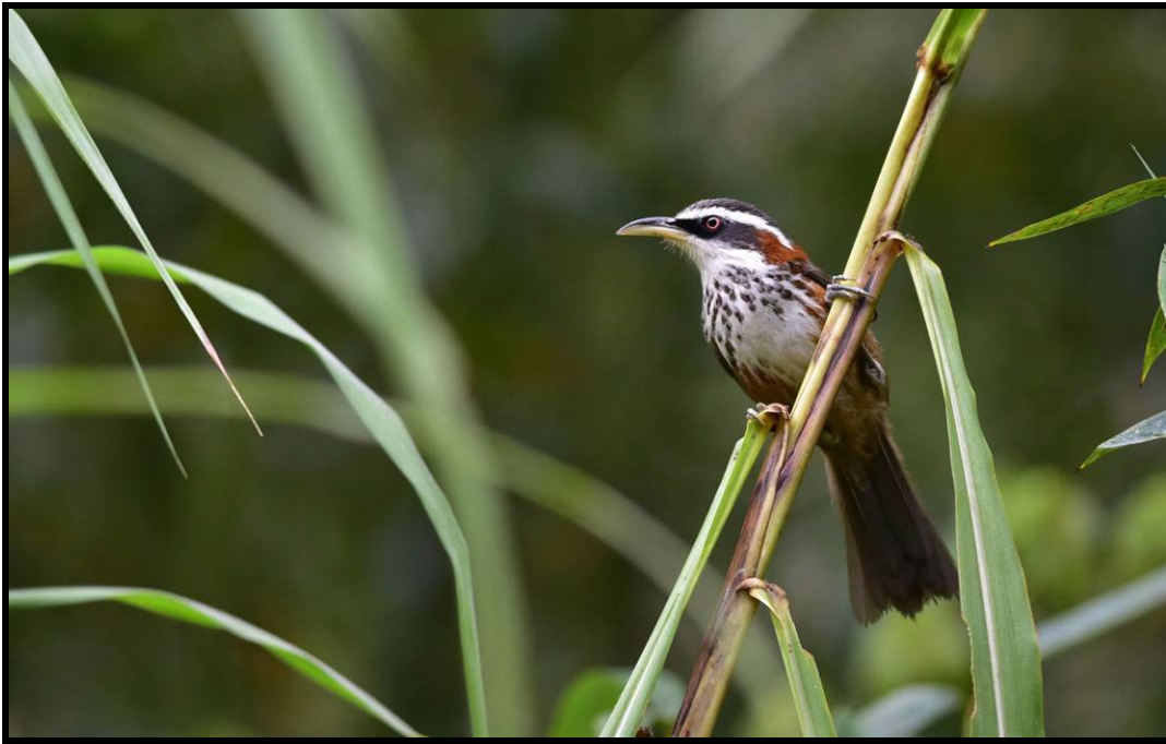
Taiwan Scimitar Babbler is an attractive endemic bird.

Most of the endemic birds are found in the mountains, meaning birding takes place in some absolutely gorgeous scenery with nice cool temperatures, a pleasant change from the warmer lowlands where there are also plenty of excellent birds to be found, including several more endemics, and the migratory and highly sought-after Fairy Pitta . A few of the species occurring in Taiwan with distinctive local subspecies (and potential future splits) include Himalayan Owl , Ryukyu Scops Owl , Dusky Fulvetta , Golden Parrotbill , Alpine Accentor , and many more.