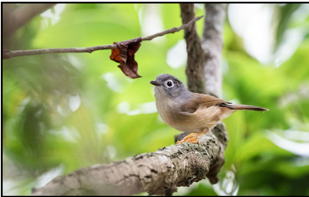
Grey-cheeked Fulvetta usually give their presence away by their raucous calls and they can be seen in Dasyueshan National Forest.

As we get higher, we will hopefully find Bronzed Drongo , Black Bulbul , Striated Prinia , the striking Taiwan Niltava , White-bellied Erpornis , hopefully White-backed Woodpecker and Grey-headed Woodpecker , and probably Formosan Rock Macaque .