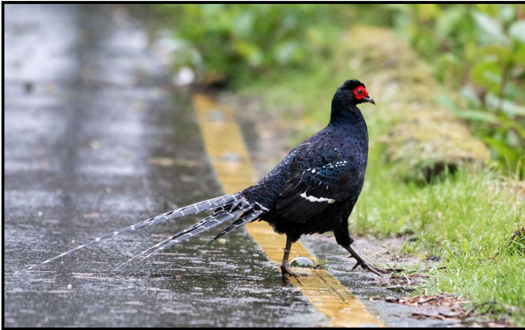
The endemic Mikado Pheasant is a highly prized target species.

of Southern (Spotted) Nutcracker as well as Brown-flanked Bush Warbler , Yellow-bellied Bush Warbler , Taiwan Bush Warbler , and Taiwan Shortwing .