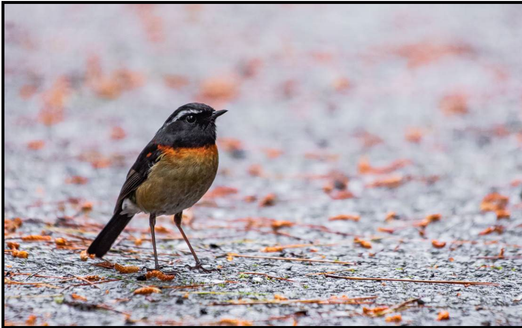
The endemic Collared Bush Robin is a rather dainty and approachable bird of the higher elevations that we will spend time birding in while on Taiwan.