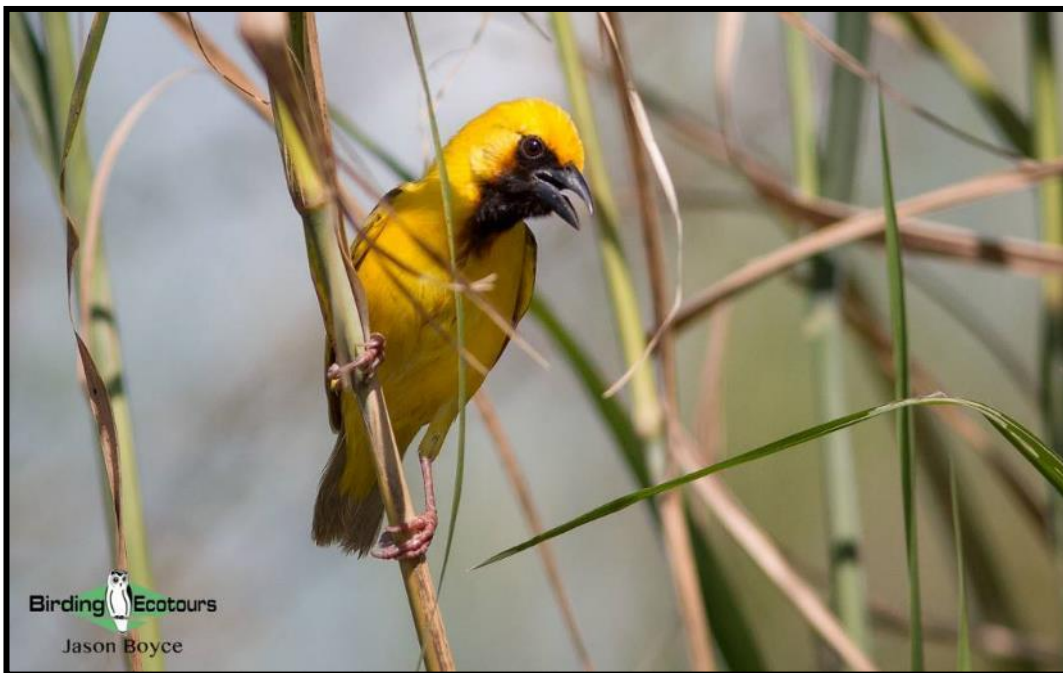
Kilombero Weaver is one of a few recently described bird species from Tanzania's Kilombero Valley.