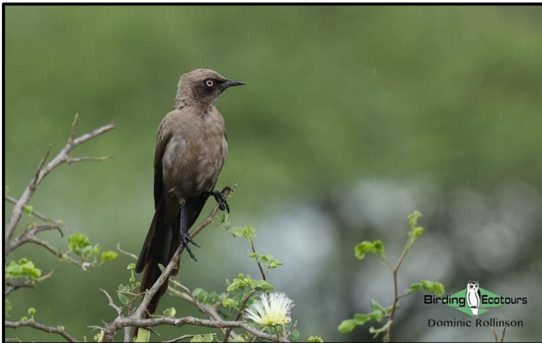
Ashy Starlings are endemic to Tanzania and are abundant in Tarangire National Park.