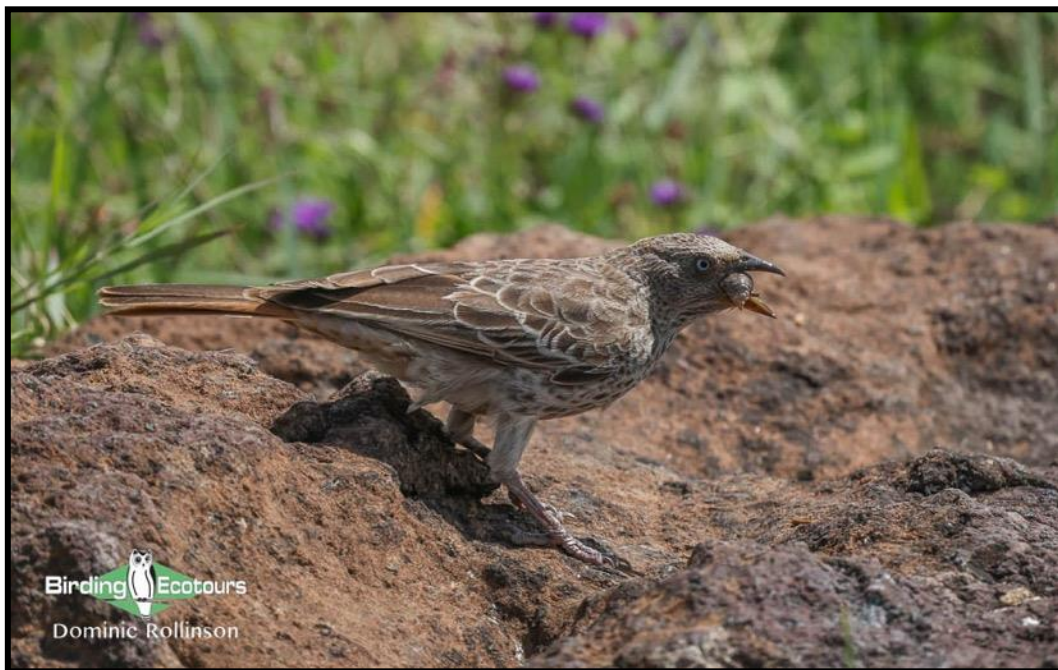
Rufous-tailed Weaver – a highly range-restricted East African endemic.

Eventually this epic Tanzania birding tour ends at the tropical Indian Ocean city of Dar es Salaam, from where there is the option of joining a short extension to Pemba Island for its four endemics and/or a "rough" extension to some of the more remote Eastern Arc Mountains for endemics we won't see on the main tour. Please email us if you are interested in either or both of these extensions.