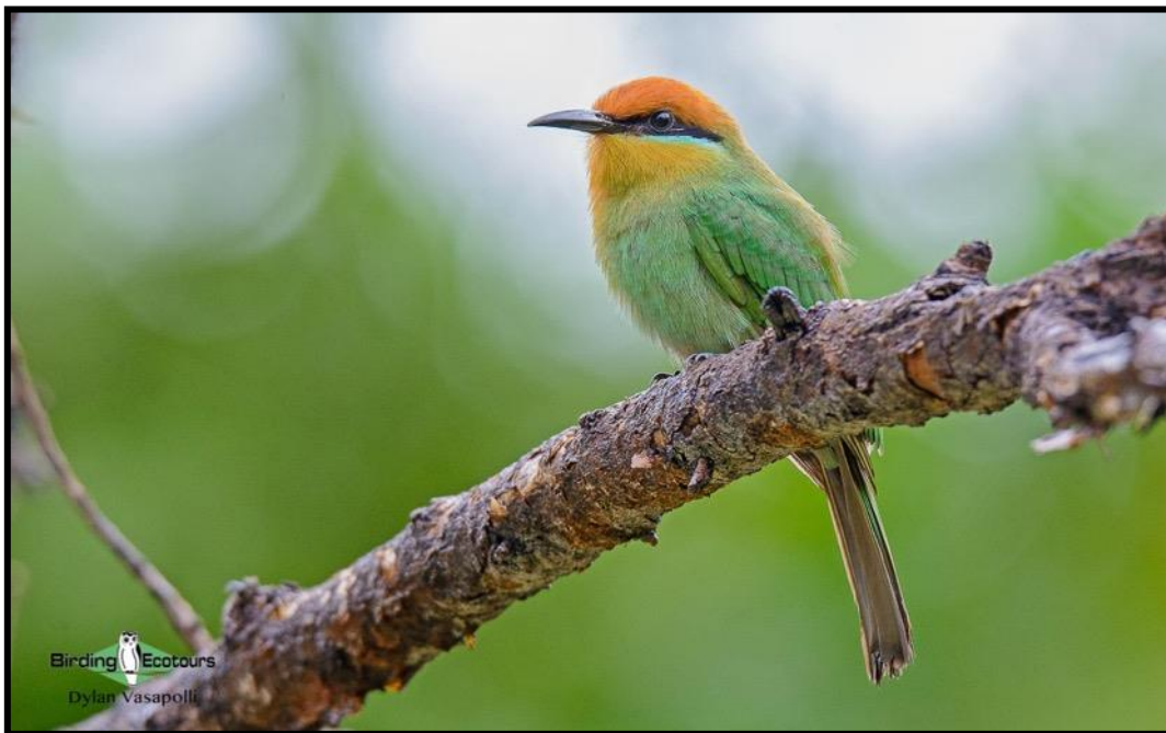
A Böhm's Bee-eater seen in miombo-type woodlands.

Miombo ( Brachystegia ) woodland is a beautiful dry forest that boasts a lot of south-central-African endemics, extending from southern Tanzania to Mozambique, Zimbabwe, Zambia, and Angola (see our blog on miombo birding ). Since we'll be in a completely new, very unique habitat, we're bound to add a lot of new birds to our burgeoning list. Mikumi National Park is where we search for miombo-woodland birds – and we must be careful, as there are stacks of big game (some pretty dangerous) around. Racket-tailed Roller sits quietly on more concealed perches in thicker woodland than other rollers. Shelley's Sunbird and various other more widespread sunbird species might be around. Miombo Rock Thrush sings beautifully from under the canopy. Pale-billed Hornbill , Böhm's Bee-eater , Dickinson's Kestrel , and a bunch of other brilliant birds will also be searched for.