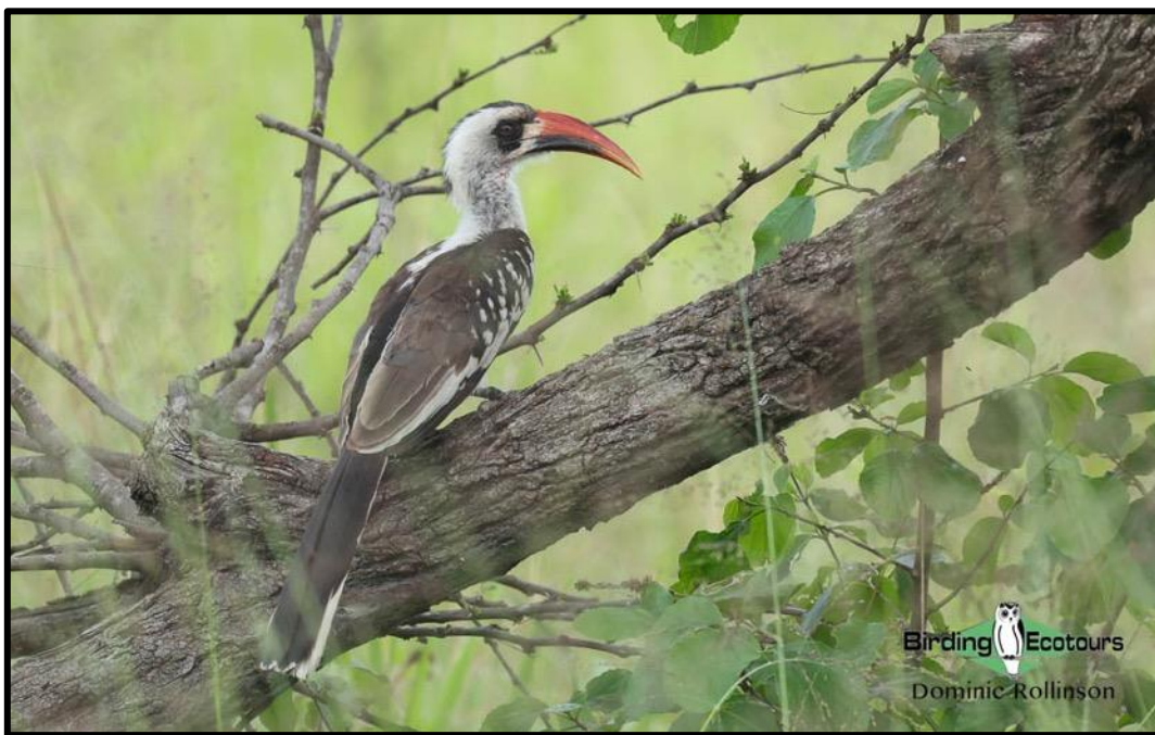
One of our endemic targets – Tanzanian Red-billed Hornbill.