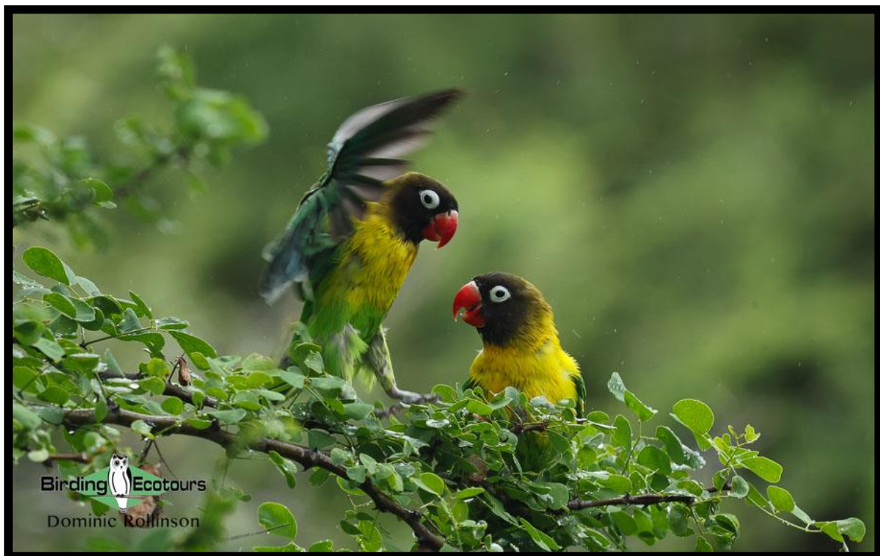
Yellow-collared Lovebird is an incredibly striking Tanzanian endemic.