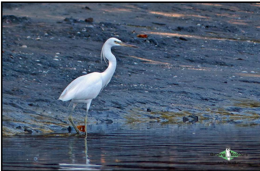
We will search for Chinese Egret along the coast near Laem Pak Bia.

This short, small-group tour forms a circuit around central Thailand, starting and ending in Bangkok. After arrival in Bangkok, we head south to the shores of the Bay of Bangkok and the vast areas of saltpans that form the vital overwintering habitat for hundreds of thousands of shorebirds, where one of the most highly sought birds on the planet, Spoon-billed Sandpiper , can be found during the non-breeding season. We will be putting all of our efforts into finding this sought-after bird, along with many other species. In fact, over 40 species of shorebirds can be found here in a couple of days birdwatching! It really is quite staggering witnessing the huge numbers of birds and the species diversity. Other key birds on our radar here include Great Knot , Nordmann's Greenshank , Asian Dowitcher , Far Eastern Curlew , Malaysian Plover , and White-faced Plover . There are of course many other potential highlights to search for during our time here, and Chinese Egret will be high on that list.