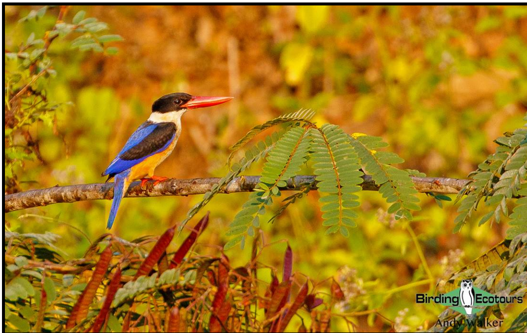
Black-capped Kingfisher is a striking bird.