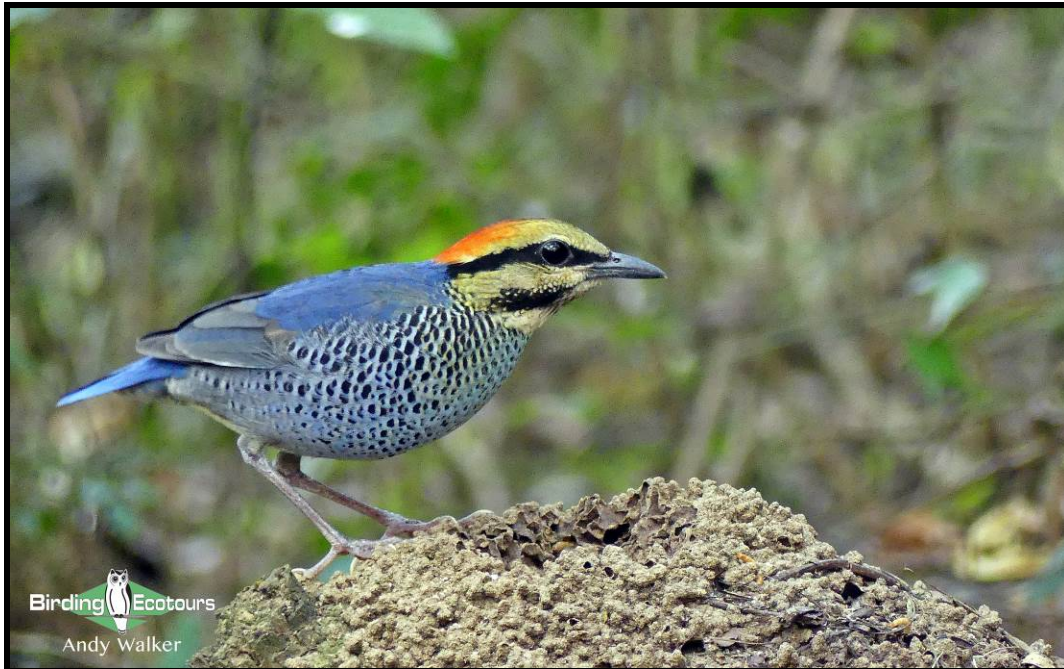
The gorgeous Blue Pitta will be searched for during our forest birding.