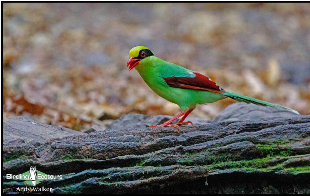
The colors on the gorgeous Common Green Magpie need to be seen to be believed.

Necklaced Laughingthrushes, White-rumped Shama, and an assorted range of other interesting passerines.