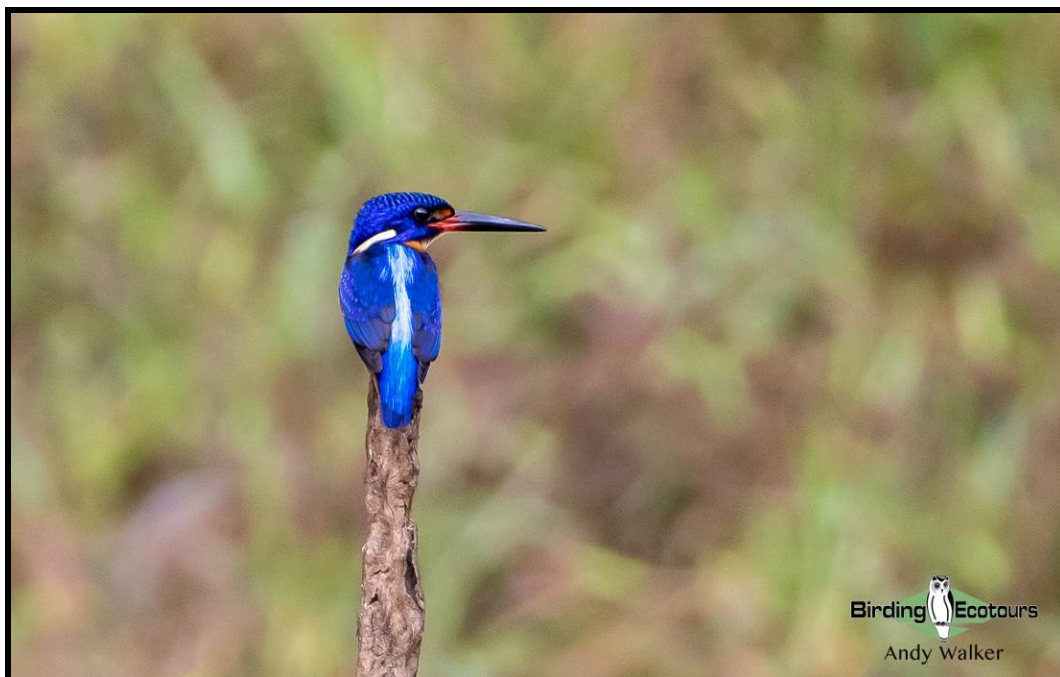
The gorgeous Blue-eared Kingfisher is one of several kingfisher species possible at Lake Ratchaprapha and on this southern Thailand tour in general.

We will head onto the lake for a dawn wildlife cruise and will look for Helmeted Hornbill and all the other possible hornbill species of the area, a range of kingfisher such as Stork-billed Kingfisher , Black-capped Kingfisher , Blue-eared Kingfisher , and exciting raptors such as Bat Hawk , Lesser Fish Eagle , and Oriental Hobby . We will be out on the water most of the morning, returning to the pier in time for lunch.