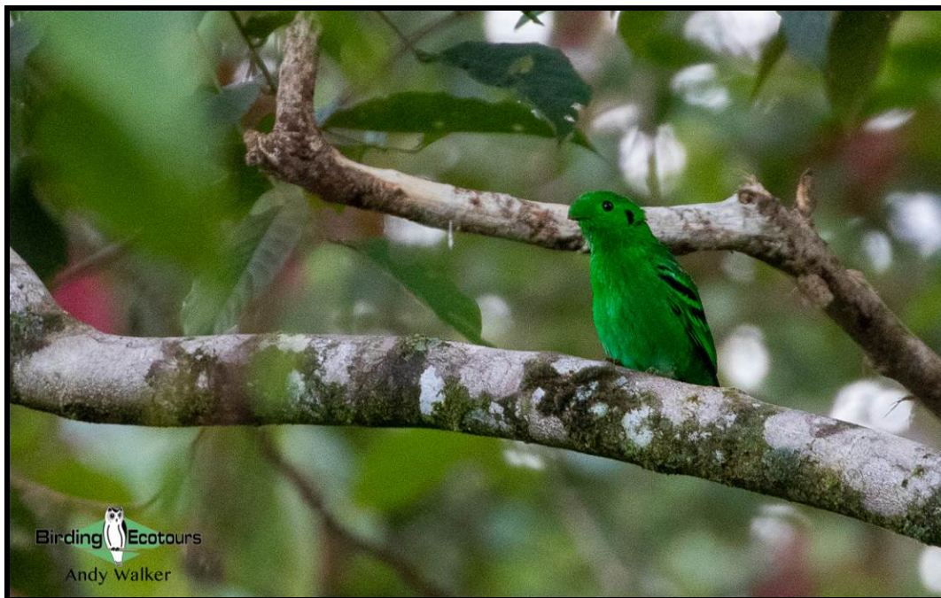
The sight of a male Green Broadbill will likely leave you speechless, it's a stunner.

There are numerous special avian treats in southern Thailand, from several spectacular families, such as pittas, kingfishers, trogons, malkohas, hornbills, barbets, bee-eaters, and broadbills, including such beauties as Malayan Banded Pitta , Mangrove Pitta , (Gurney's Pitta is now regrettably considered extirpated from Thailand), Great Hornbill , White-crowned Hornbill , Helmeted Hornbill (now considered Critically Endangered by BirdLife International ), Bushy-crested Hornbill , Green Broadbill , Banded Broadbill , Black-and-yellow Broadbill , Black-and-red Broadbill , Rail-babbler , Scarlet-rumped Trogon , Orange-breasted Trogon , Red-throated Barbet , Golden-whiskered Barbet , Chestnut-breasted Malkoha , Red-billed Malkoha , Banded Kingfisher , Rufous-collared Kingfisher , Brown-winged Kingfisher , Ruddy Kingfisher , Malayan Blue-banded Kingfisher , and Red-bearded Bee-eater .