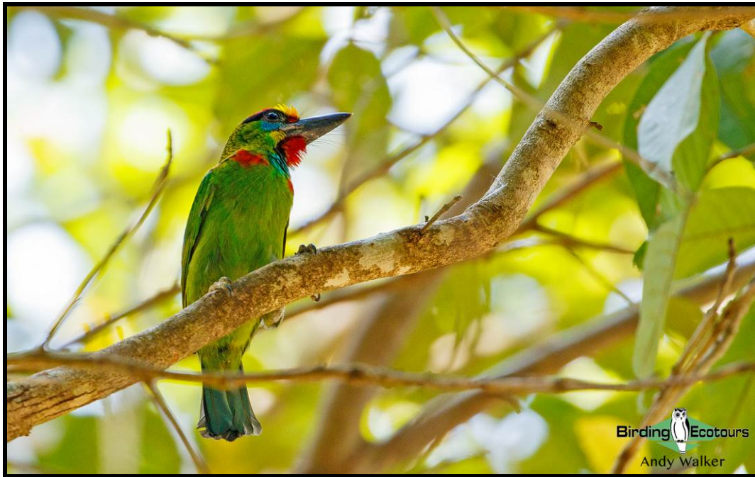
Red-throated Barbet is a target while we are birding in southern Thailand.

spectacular scenery in all of Thailand. This tropical birding adventure, set amid extraordinary karst limestone landscapes and rich tropical seas, is one not to be missed!