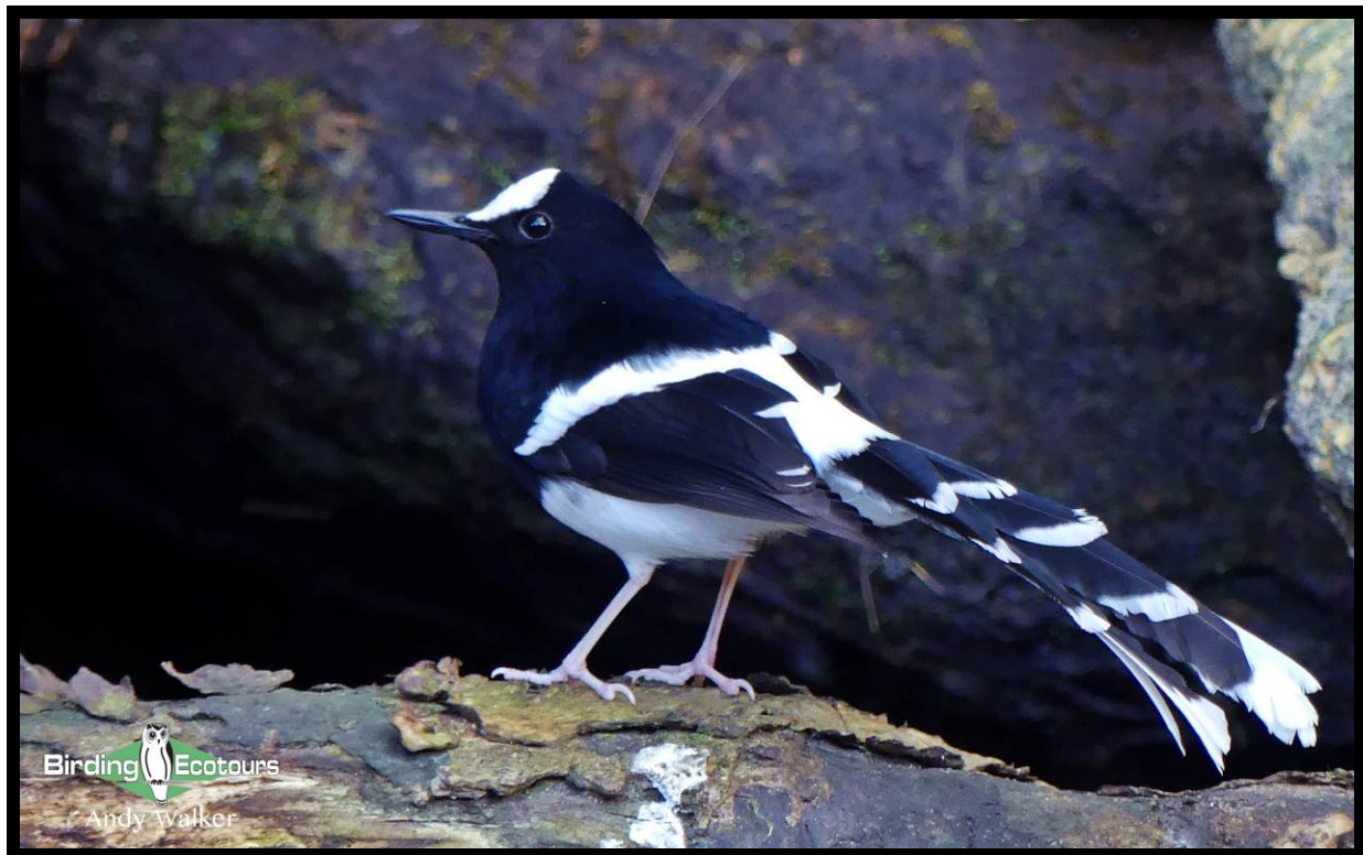
The magnificent White-crowned Forktail is one of our targets on this trip.