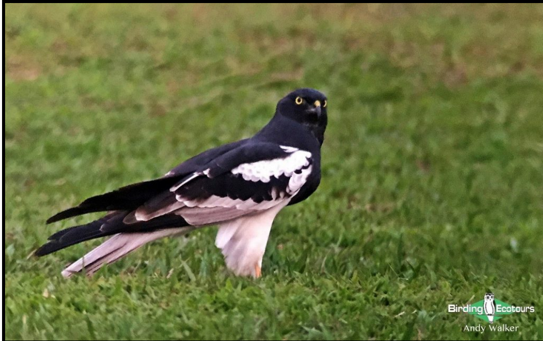
Pied Harrier — one of the most attractive raptors in the world.