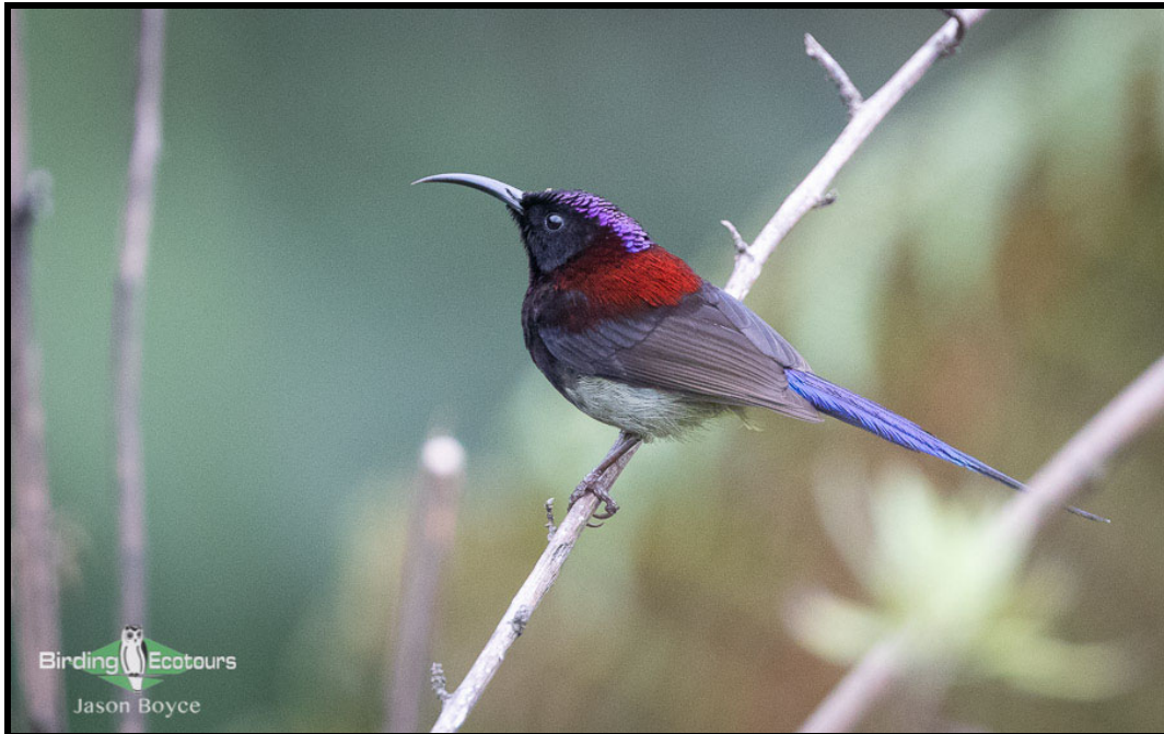
The vibrant Black-throated Sunbird is a stunner.