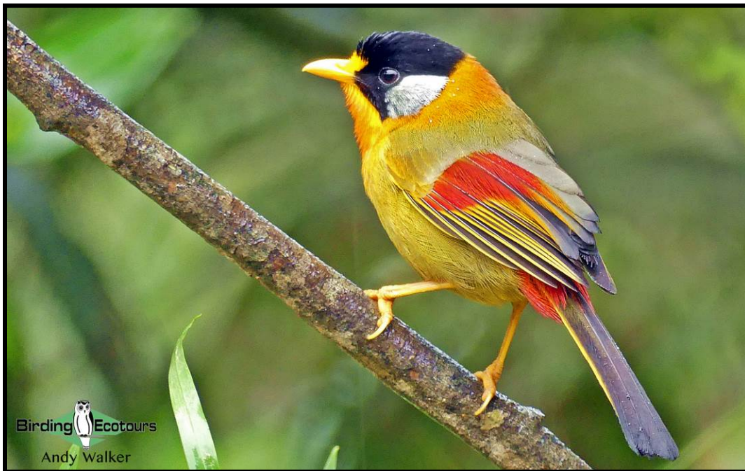
Silver-eared Mesia can be seen in the forests of Doi Ang Khang.