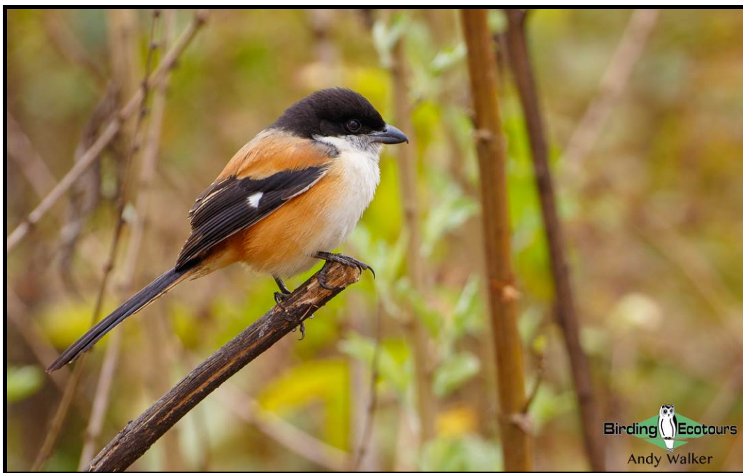
Long-tailed Shrike can be seen in the rice paddies across northern Thailand.