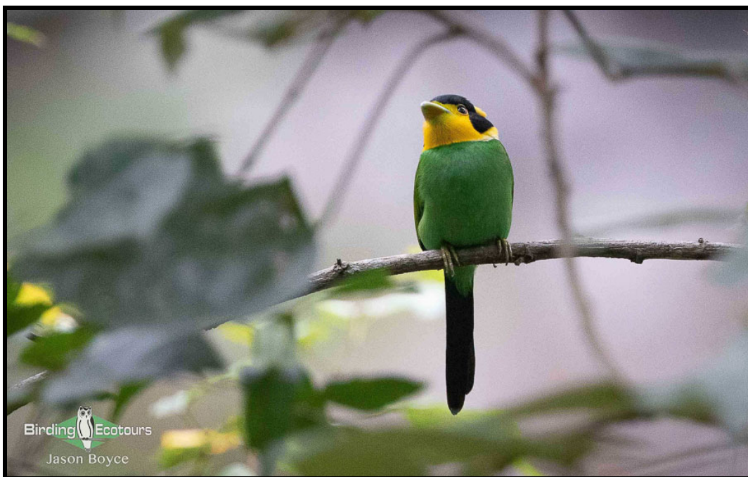
Long-tailed Broadbill — one of two broadbill species we hope to encounter on this tour.

This short tour forms a circuit around northern Thailand, starting and ending in the northern capital city of Chiang Mai. We will commence our experience of northern Thailand birding with a visit to Doi Inthanon, the country's highest mountain. The unique set of habitats here offers us some excellent birds as well as letting us come to grips with some of the more common northern species. Special birds here may include Rufous-throated Partridge , Mountain Bamboo Partridge , Black-tailed Crake , Spectacled Barwing , Himalayan Bluetail , Himalayan Shortwing , Dark-sided Thrush , White-crowned , Slaty-backed , and Black-backed Forktails , Long-tailed Broadbill , and Red-headed Trogon . The dry, lowland forest at the foot of the mountain can be full of woodpeckers, and the stunning Black-headed Woodpecker is one of the best-looking. Other targets here will include White-rumped Falcon , Red-billed Blue Magpie , and Blossom-headed Parakeet .