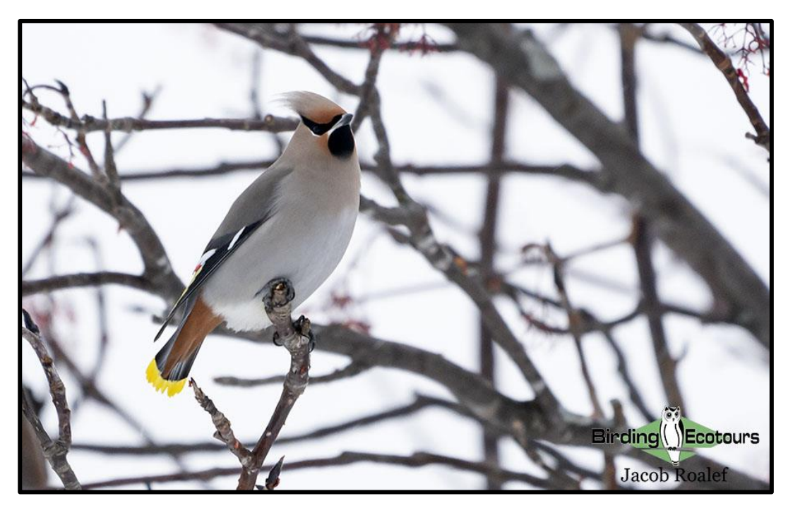
The striking Bohemian Waxwing breeds in the forests around Kuusamo. Their "sirrr" call sounds almost like a soft bell being rung and this often gives them away.

The habitats closer to <u>Kuusamo</u> will provide us with a different range of species to those found nearer Oulu such as Red-necked Grebe , Spotted Redshank , Broad-billed Sandpiper , and Jack Snipe . Exploring the surrounding forests will give us another chance of spotting Northern Hawk-Owl and Boreal (Tengmalmn's) Owl , plus Western Capercaillie , Black Grouse , and Willow Ptarmigan .