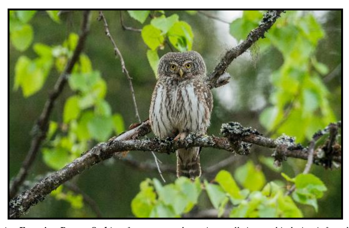
The tiny Eurasian Pygmy Owl is a fearsome predator, its small size not hindering it from being an effective hunter in the dense Finnish forests.

The smallest of these species is the Eurasian Pygmy Owl . Despite its small size this species is a voracious, mainly diurnal hunter, and often hangs around bird feeders and hunts in a fashion like that of small hawks. Another small owl species here is the Boreal (Tengmalm's) Owl . This species can be incredibly elusive, and our best bet will be to observe this species near nest sites.