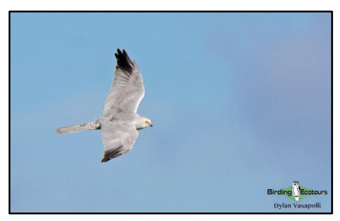
The male Pallid Harrier is a very special sight. Males are a ghostly grey with a black wingtip wedge. This species appears to be expanding its European breeding range in a westward direction with recent breeding confirmed in The Netherlands and France.