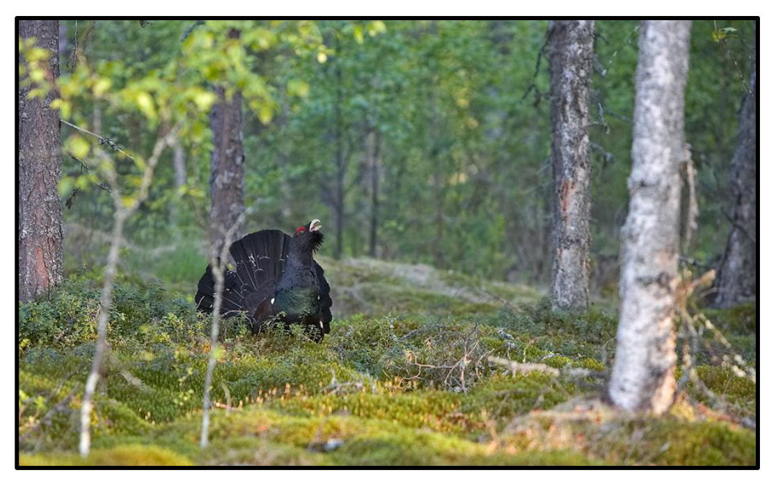
The huge male Western Capercaillie will be searched for in the boreal forests.

While the owl species are the real highlight of the forests, they are not the only amazing species to be found here. The taiga forests in June come alive as the daylight hours increase. By exploring the forest trails here, we should come across forest specials such as Black Grouse , Western Capercaillie , Hazel Grouse , Black Woodpecker , Eurasian Three-toed Woodpecker , Lesser Spotted Woodpecker , Rough-legged Buzzard , and Northern Goshawk .