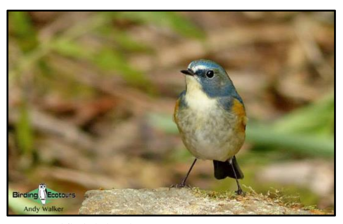
The beautiful Red-flanked Bluetail is a relatively new breeding species in eastern Finland, having spread west from Russia. It is a big target on our tour.

While around Oulu we will explore <u>Liminganlahti</u>. This superb wetland area plays host to many wildfowl and shorebird (wader) species. Highlights of our time here will likely include Spotted Redshank , Caspian Tern , Black-tailed Godwit , Garganey , Whooper Swan , and Common Crane . This activity is an irresistible lure to multiple birds of prey including White-tailed Eagle , Western Marsh Harrier , and Peregrine Falcon . Rarer species that we have a chance of coming across here include shorebirds (waders) like Broad-billed Sandpiper and the delicate Pallid Harrier , one of Europe's rarest (and most attractive) breeding birds of prey. We will also be perfectly timed to witness the fascinating Ruff lek that occurs in the area every summer.