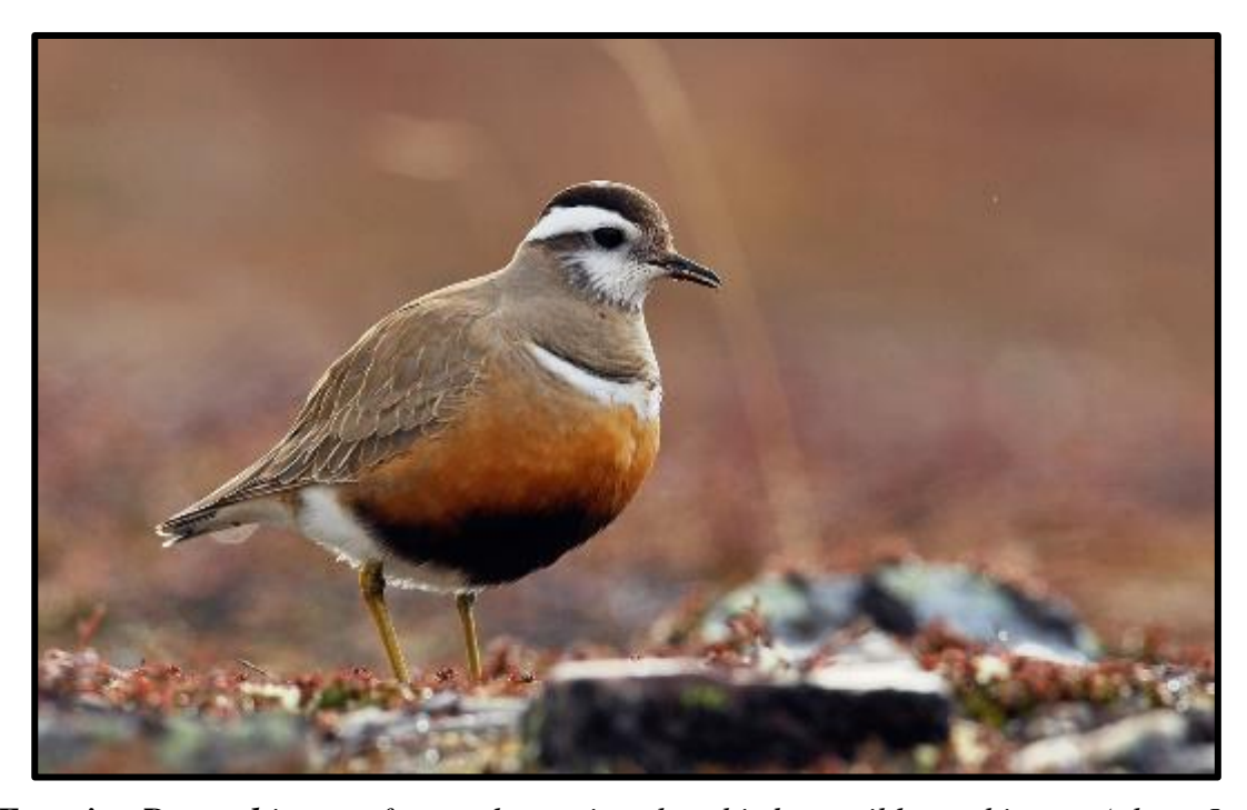
Eurasian Dotterel is one of several stunning shorebirds possible on this tour (photo Jari Peltomäki).

Usual sightings here also include White-tailed Eagle and Western Marsh Harrier, while Peregrine Falcon is a daily visitor from the nearby bog. Broad-billed Sandpiper should have arrived here from May, as well as small numbers of Eurasian Dotterel. Terek Sandpiper, Pallid Harrier, and Citrine Wagtail are much sought-after rare breeding birds in the area.