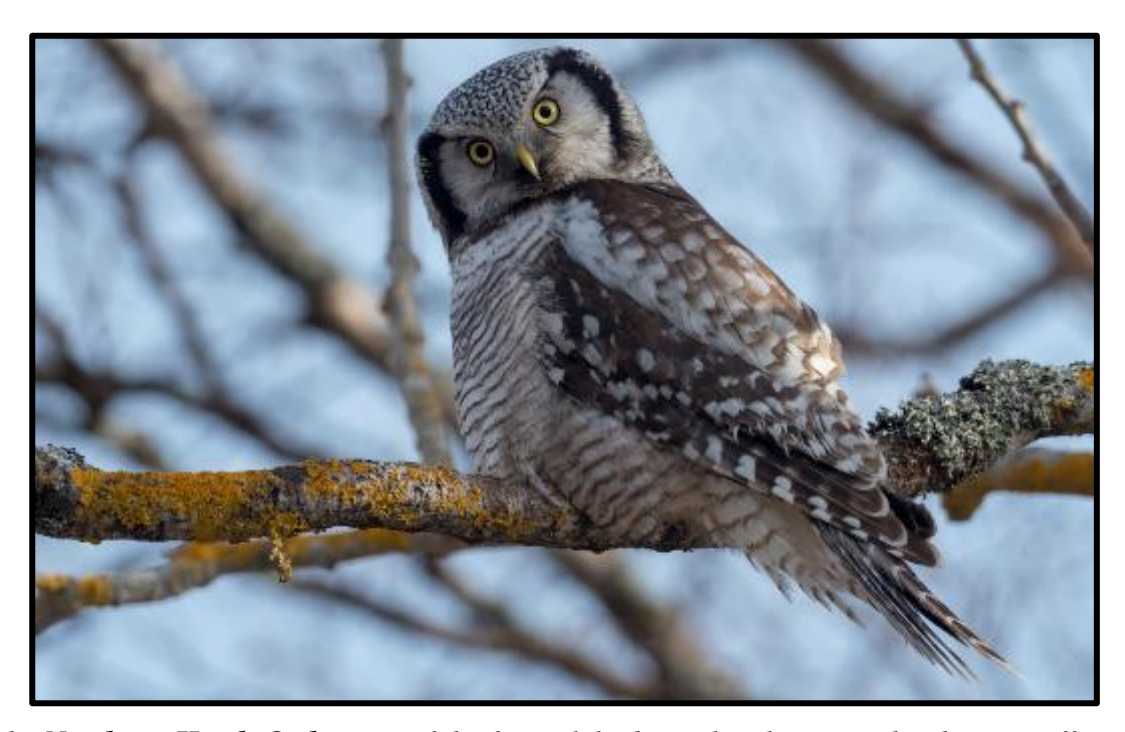
The Northern Hawk-Owl is one of the few solely diurnal owls on Earth. They are efficient hunters and can often be found along roadsides.

We will then head east across the breadth of Finland to the city of Kuusamo on the Russian border. Along the route we will explore the vast swathes of lakes that form Finland's interior. Here we will come across Smew, Common Crane, Western Osprey, Common Scoter, and Eurasian Whimbrel, among others. The variety of birds here is extensive, and as we continue to explore, we will come across small groups of Common Goldeneye, singing Wood Sandpiper, and stunning Brambling. This area of Finland is home to several eastern species of birds including Red-flanked Bluetail, Rustic Bunting, Little Bunting, and Arctic Warbler. Taiga forest specials occur here too, including Grey-headed Chickadee (Siberian Tit), Siberian Jay, Two-barred Crossbill, and Pine Grosbeak. There are simply too many species to list in this introduction to do the area justice, so please see the detailed itinerary below for a more extensive list of the amazing species which occur here.