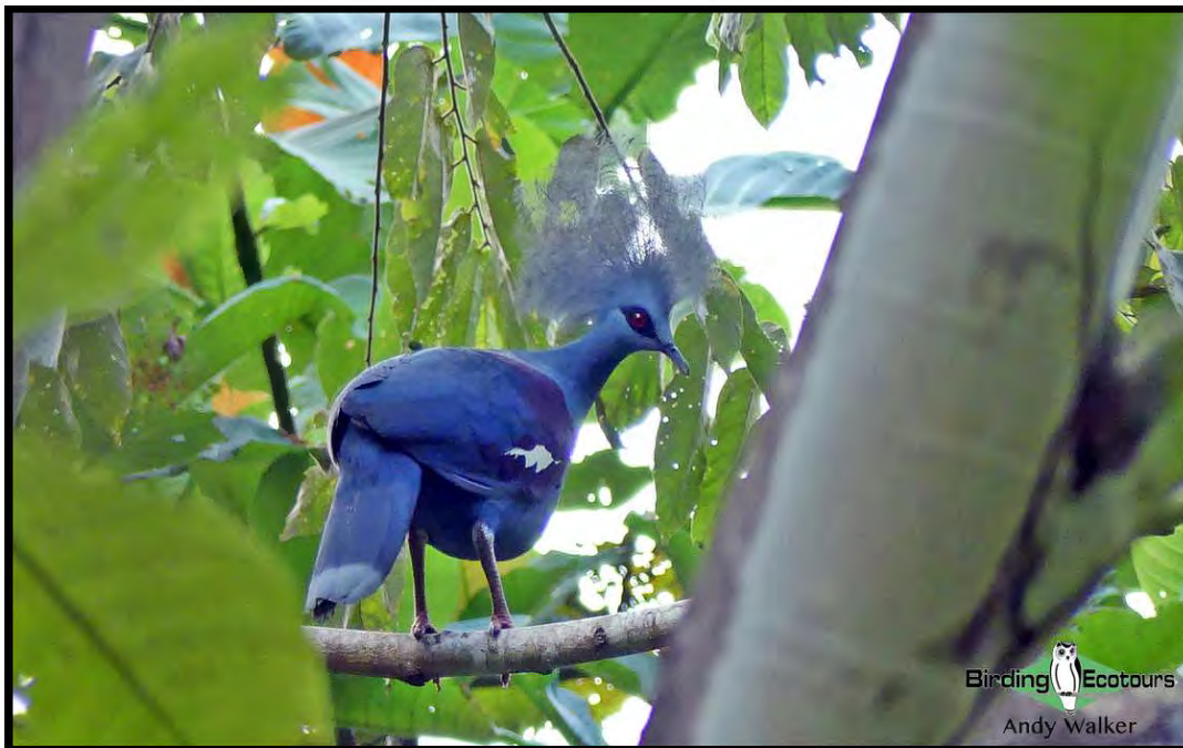
A huge bird, Western Crowned Pigeon is sure to impress on Waigeo.

The second leg of our tour takes us to the Klasow Valley and Raja Ampat Islands, and specifically Waigeo Island. During our time in this area we will search for Wilson's Bird-of-paradise , Red Bird-of-paradise , King Bird-of-paradise , Magnificent Riflebird , and Glossy-mantled Manucode . Wilson's Bird-of-paradise is often considered one of the best-looking birds on the planet, and so we will look forward to making our own judgments on this. Again, there are numerous other species high on our 'wanted' list, including Western Crowned Pigeon (a seriously impressive bird that will rival the birds-of-paradise for 'bird of the trip', if we find them), plus the likes of Blue-black Kingfisher , Hook-billed Kingfisher , Rufous-bellied Kookaburra , Yellow-billed Kingfisher , Papuan Dwarf Kingfisher , Common Paradise Kingfisher , Red-breasted Paradise Kingfisher , Beach Kingfisher , Papuan Hawk-Owl , Marbled Frogmouth , Papuan Frogmouth , Palm Cockatoo , Papuan Eclectus , Great-billed Parrot , Black Lory , Raja Ampat Pitohui , Eastern Hooded Pitta , Papuan Pitta , and Brown-headed Crow .