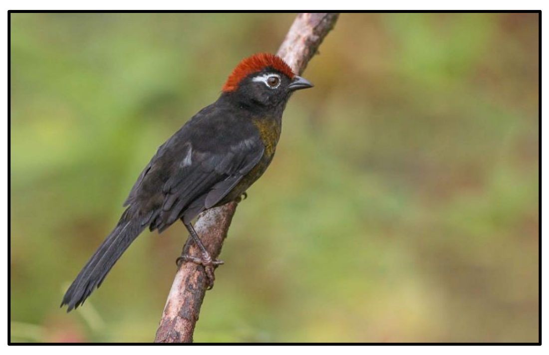
The range-restricted White-rimmed Brushfinch.

We encountered a nice mixed-species feeding flock, with Sulphur-bellied Tyrannulet , Handsome Flycatcher , White-banded Tyrannulet , Golden-bellied Flycatcher , Rufous-breasted Flycatcher , Spotted Barbtail , Streaked Xenops , Black-and-white Warbler and Blackburnian Warbler . We also heard White-bellied Antpitta far away from the road. We then went to look for the White-rimmed Brushfinch – a sought-after species in South America – and saw it well, but it was difficult to photograph due to the poor light conditions. (It is also found in the southern Andes of Colombia and northern Andes of Ecuador, north and east of Quito).