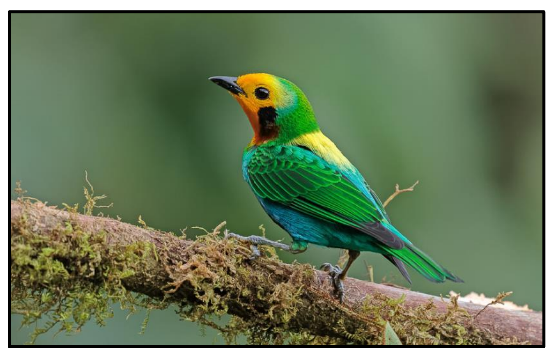
Multicolored Tanager, perhaps the most striking Colombian endemic (photo Daniel Orozco).

We had an early start and drove to La Florida, a private bird reserve that has become very popular among local and international birders in recent years due to its great feeding stations. On arrival, we spent the whole morning at the "moth trap", where we got super views of Grey-breasted Wood Wren and Russet-crowned Warbler showing very well, right out in the open. Other interesting birds included Variegated Bristle Tyrant , Streak-capped Treehunter , Montane Woodcreeper , Red-faced Spinetail , Northern Tropical Pewee , Black-and-white Warbler , Blackburnian Warbler , Canada Warbler , Slate-throated Whitestart and Narino Tapaculo (heard only).