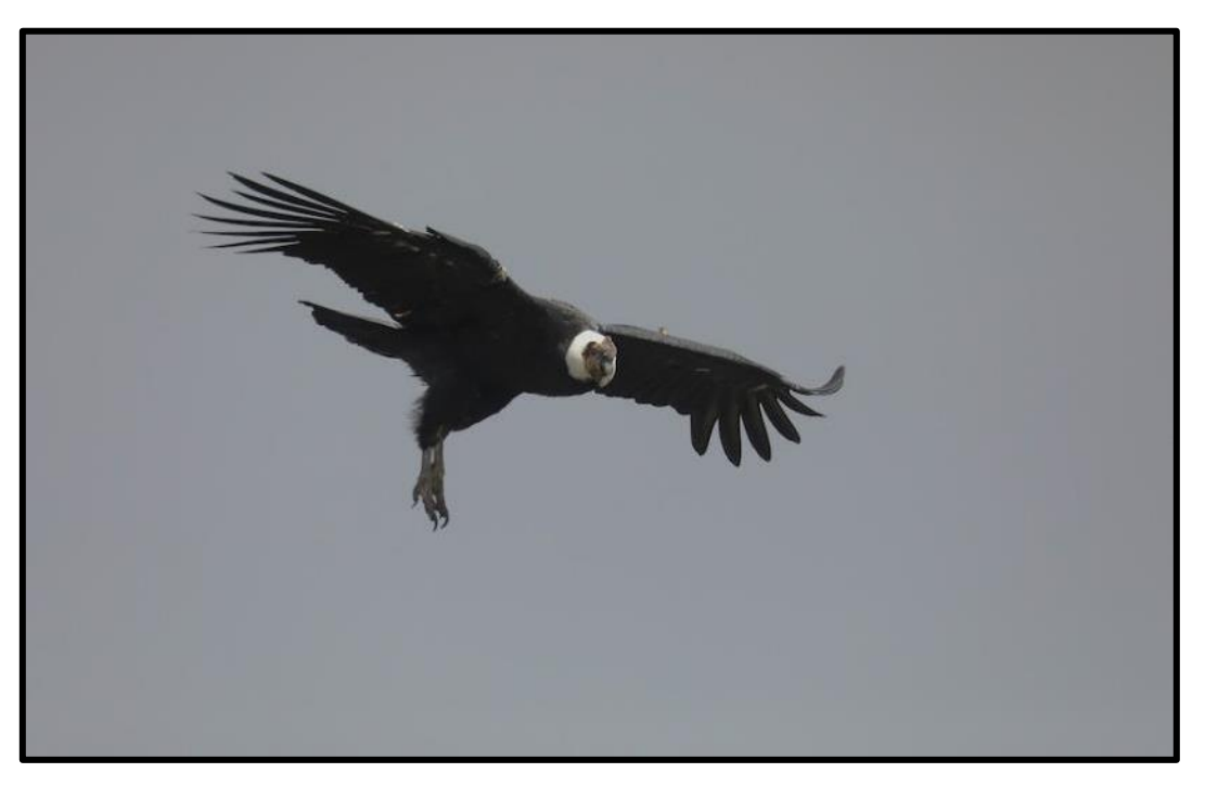
Andean Condor.

After breakfast, we enjoyed views of Southern Lapwing in the hotel grounds. We then drove above Popayan to the <u>Puracé National Park</u> below the paramo of the Cauca department. Here, we visited the Cruz del Condor sector, where, accompanied by members of the local community, we went to the Cruz del Condor stakeout to wait for the national bird of Colombia (as well as Ecuador, Chile and Bolivia). It was drizzling, windy, and overcast, and as time went on, it seemed increasingly likely that we would unfortunately miss the condor today. While we were waiting we had several good views of Carunculated Caracara , and then the Andean Condor flew above the stakeout and around us to finally land on the huge rock on the cliff where the locals had left some bait for it. We had phenomenal, close views of the condor!