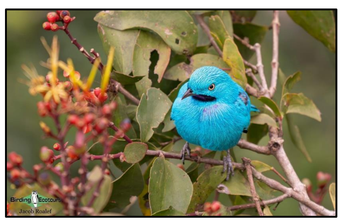
Plum-throated Cotinga was a pleasant surprise on the trip.

Back in Mocoa, we tried for Band-bellied Owl on the outskirts of town, but sadly, it was not calling, most likely due to the light drizzle. The owls did not cooperate much during this trip.