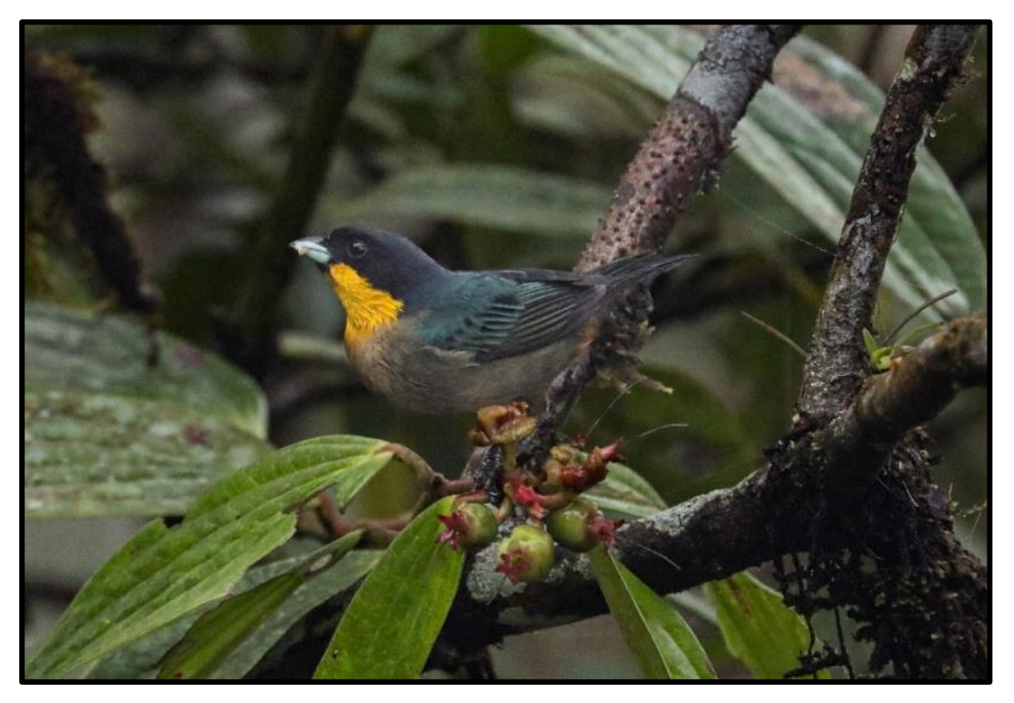
Yellow-throated Tanager.

The birds behaved well despite the non-stop rain every day until the end of our trip. Some of the remarkable species we encountered along this route included Yellow-throated Tanager (which just sneaks into Colombia from Ecuador, here at its northern limit). This can be easy to see in northern Peru and Ecuador, but in Colombia, it is found only in this area. Other birds seen were Blue-winged Mountain Tanager , Beryl-spangled , Flame-faced , Saffron-crowned , Metallic-green , Blue-and-black , Blue-grey , Blue-necked , Blue-capped and Golden Tanagers . Grass-green Tanager showed very well along the road down from Paramo de Bordocillo to the upper section of the Trampolin, and it was a highlight for some tour participants.