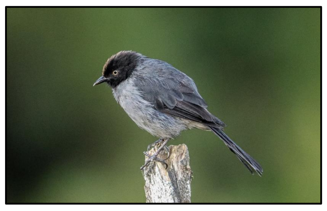
Black-headed Hemispingus, one of the highlights around Bogotá.

bird not widespread in the Andes, being found only in Colombia and Ecuador, with old records in Piura state in the Andes of northern Peru.