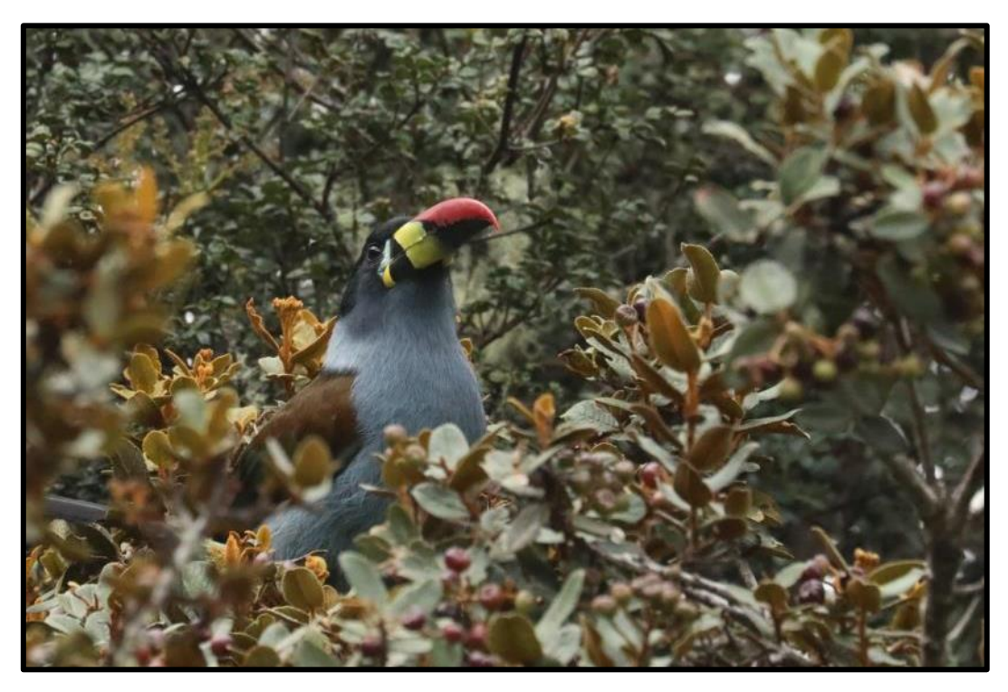
Grey-breasted Mountain Toucan.

We ate lunch in the community and then visited a garden with some feeders, where we saw Shining Sunbeam , Buff-winged Starfrontlet , Greenish Puffleg and Sparkling Violetear . We had great views of Golden-fronted Whitestart and Crimson-mantled Woodpecker . Then we drove back to Popayan for the night.