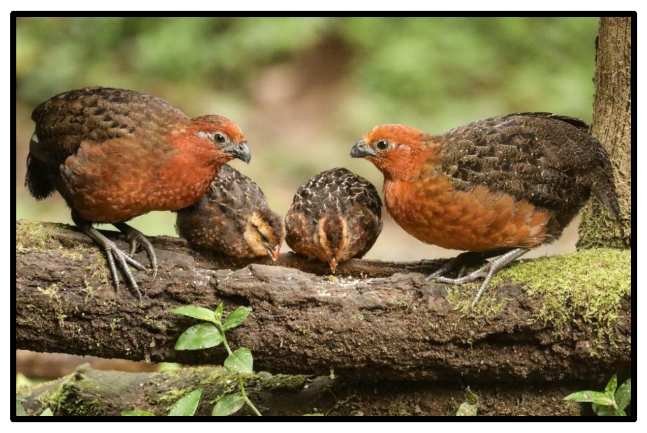
Chestnut Wood Quail, an endemic of Colombia (photo Chuck Gates).