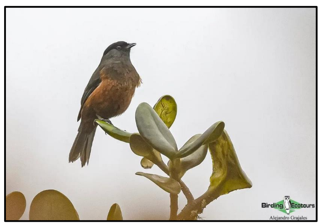
Chestnut-bellied Cotinga, mega of the Andes.

at an altitude of 8,530 feet (2,600 meters). At night, we heard Rufous-banded Owl around the cabins when the temperature dropped to less than 50^{\circ}F(10^{\circ}C)!