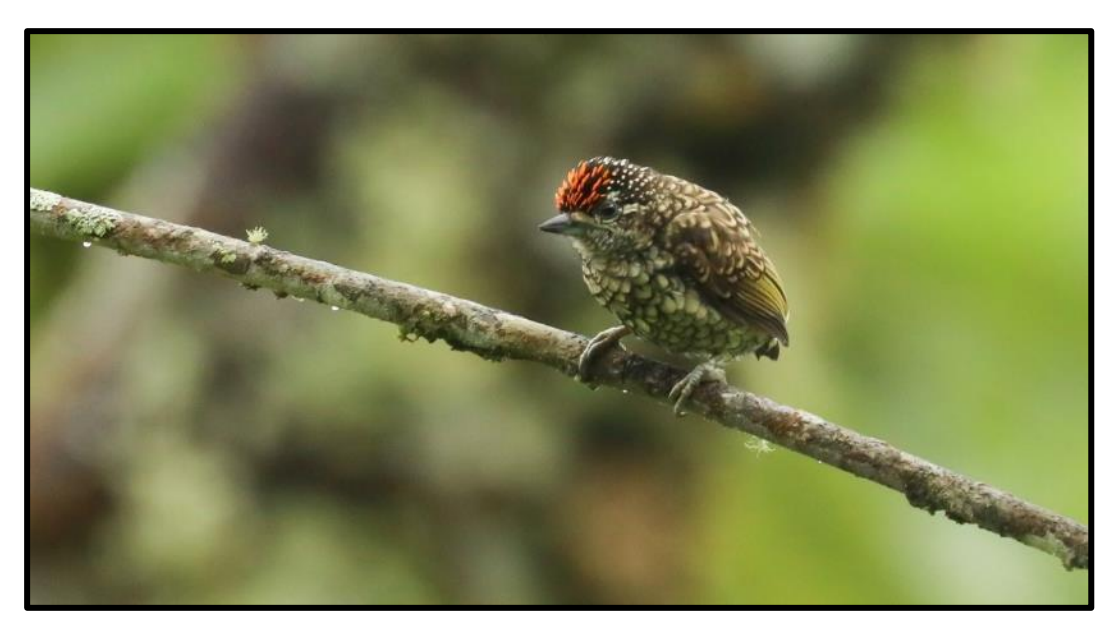
Scaled Piculet in the Colombian foothills.

Later we explored the surroundings of Mocoa in the Vereda Rumiyacu sector and had views of Speckled Chachalaca, Squirrel Cuckoo, Gilded Barbet, Chestnut-eared Aracari, Creamcolored Woodpecker, Orange-fronted Plushcrown, Grey-capped Flycatcher, Black-crowned Tityra, Red-capped Cardinal, Violaceous Jay, White-lined, Swallow and Turquoise Tanagers, Yellow-crowned Tyrannulet, Yellow-tufted and Little Woodpeckers and Swallowtailed and Plumbeous Kites. One of the stars of the afternoon was Cerulean Warbler, a lifer for several participants, even though this bird is widespread across the Americas. Another unusual species was Blackpoll Warbler.