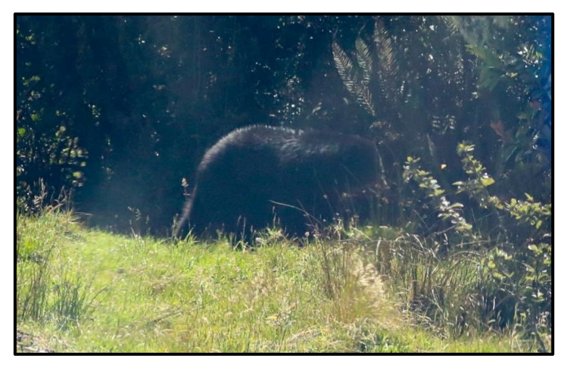
Spectacled Bear in the Colombian paramo.

In the afternoon, we visited <u>Observatorio de Colibries La Calera</u>, where the activity was slow, but we added the endemic Blue-throated Starfrontlet to our list.