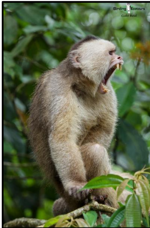
A large troop of White-faced Capuchins were seen well.

Suddenly, the rain started coming down hard, and we opted to go and check our list from the day before dinner.