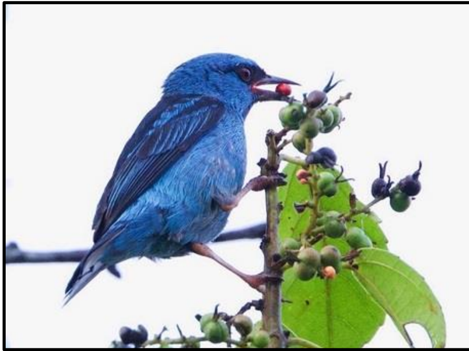
A colorful Blue Dacnis .