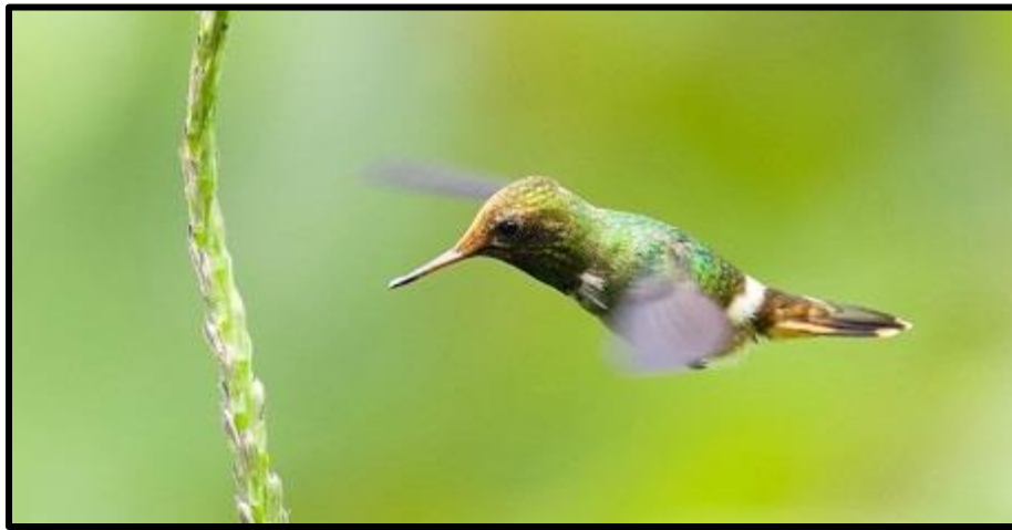
A tiny female Spangled Coquette.

We then pulled over for lunch at a small verbena garden, where we were hoping to spot a Spangled Coquette . As we walked in, we noticed that several Blue-tailed Emeralds were feeding on the flowers and before we could sit down, I saw a female Spangled Coquette . Everyone was able to watch this beautiful little female for some time while it visited the different flowers. Others seen in the garden included Violet-headed Hummingbird , Little Woodstar , Glittering-throated Hummingbird , and Wire-crested Thorntail . There were also several Yellow-tufted Woodpeckers , Roadside Hawk , and Olive-sided Flycatcher .