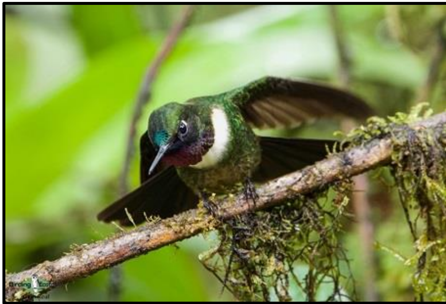
Amethyst-throated Sunangel was seen well at Casa Simpson Lodge.

We were ready for lunch a little after noon, so we meandered back to the town center of Vilcabamba and had a nice easy meal at a local restaurant. We then made our way southwest to the Tapíchalaca Reserve and the Casa Simpson Lodge , where we were going to be spending the next two nights.