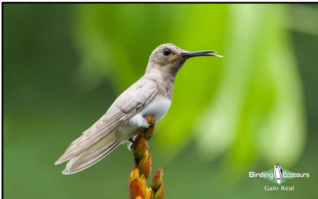
White-necked Jacobin was one of the many hummingbird species encountered on this tour.

After a delicious breakfast at Hacienda Jimenita and a little early morning birding, we returned to Quito Airport for a short 45-minute flight to Catamayo Airport, located outside the city of Loja. Our good friend and driver, Nestor, was waiting to help us with our luggage as we exited the main gates.