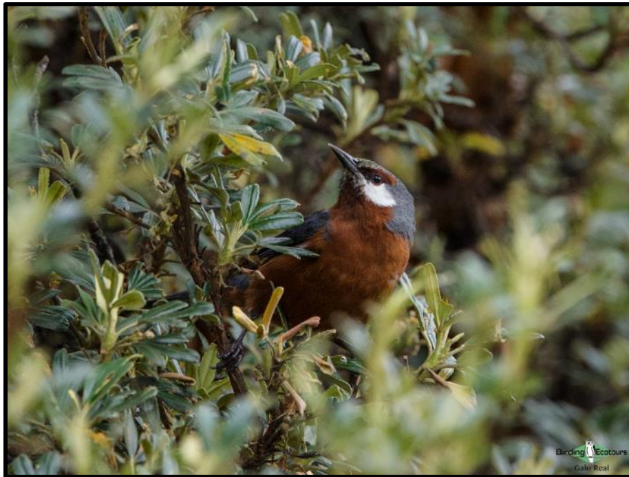
The smart-looking Giant Conebill .

Upon reaching the entrance to the trail that leads to the lagoon, Néstor spotted a small group of Turquoise Jays , which everyone was excited to see. After the jays left, we followed the path, and within a few minutes, we managed to see a group of Russet-crowned Warblers and a single Shining Sunbeam . This wet, high-elevation forest is considered pre-montane forest and is very unique due to the gnarly wind-blown polylepis trees and carpet-like plants. Once we arrived at the lagoon, we immediately saw a couple of Andean Ducks and an Andean Coot . We kept walking around the lagoon to see if we could spot the recently split Ecuadorian Rail but had no luck. As lunchtime crept up on us, we started back to the van and a Mountain Velvetbreast crossed in front of the group, and then a Spectacled Whitestart . We couldn’t stop talking about everything we had seen this morning, and before we knew it, we were back at the lodge ordering our lunch.