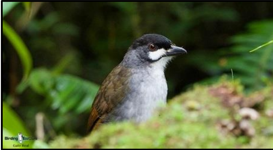
The star of the show, Jocotoco Antpitta .

After packing up and checking out, we started the four-hour trip northeast to Copalinga Lodge, located outside the town of Zamora. Our plan was to stop in Vilcabamba at a strategic rest area with a nice coffee shop and have our packed lunch there before continuing to Copalinga. The drive was uneventful and easy. We arrived at the lodge, checked in, unpacked, and then immediately met up to feed the Grey Tinamou .