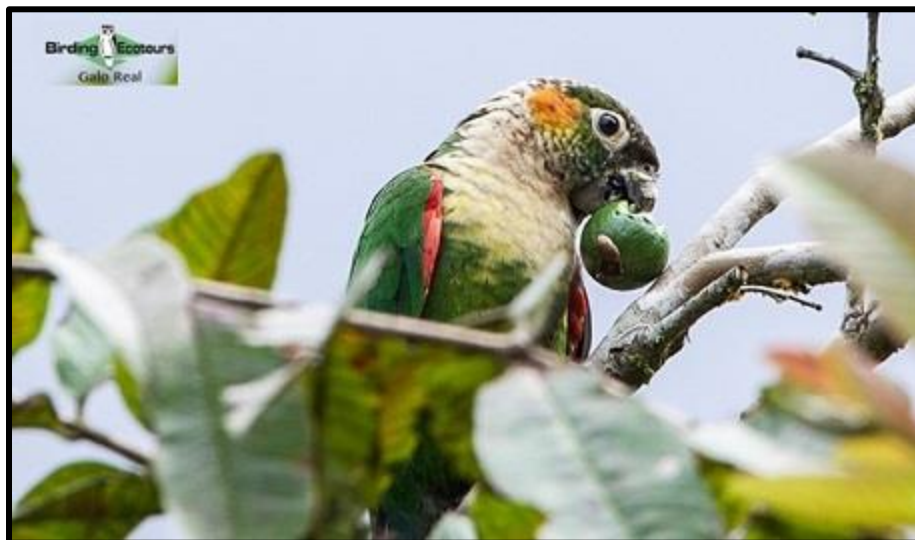
White-breasted Parakeet happily feeding in the afternoon light.

Today's plan was to have an early breakfast and then bird the immediate environs of the lodge in the morning. From the parking lot, we spotted several very vocal Crested Oropendolas , and in the verbena flowers, we saw Violet-headed Hummingbird , Black-throated Brilliant , and Wire-crested Thorntail right off the bat. Then, within moments, we spotted Lineated Woodpecker , Wedge-billed Woodcreeper , Paradise Tanager , Swallow Tanager , Blue Dacnis , and Red Pileated Finch !