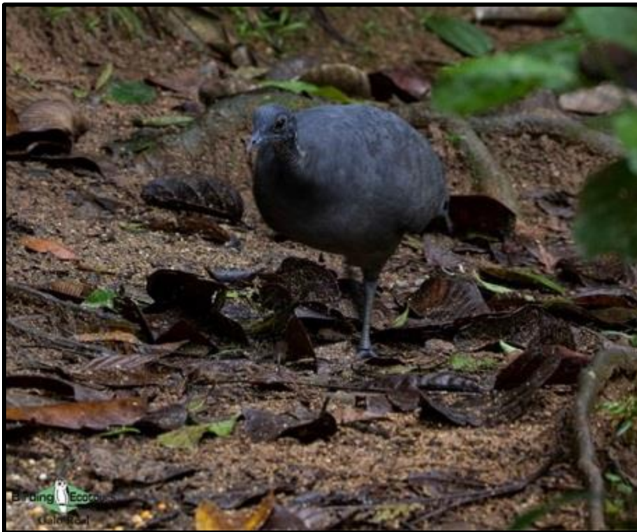
Grey Tinamous are fed near our lodge and showed well for us.

After packing up and checking out, we started the four-hour trip northeast to Copalinga Lodge, located outside the town of Zamora. Our plan was to stop in Vilcabamba at a strategic rest area with a nice coffee shop and have our packed lunch there before continuing to Copalinga. The drive was uneventful and easy. We arrived at the lodge, checked in, unpacked, and then immediately met up to feed the Grey Tinamou .