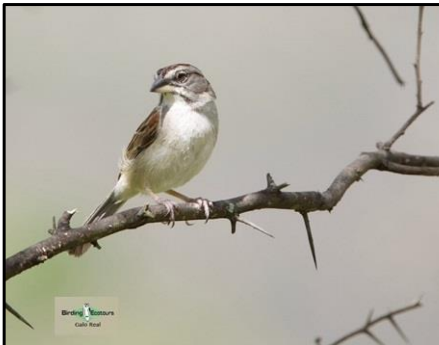
Tumbes Sparrow showed without too much difficulty.