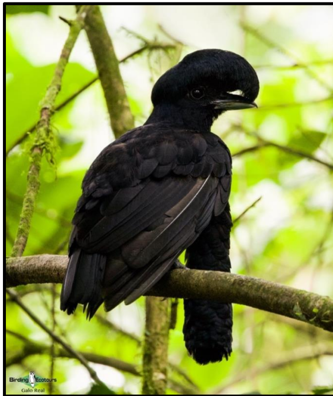
The spectacular male Long-wattled Umbrellabird.

After a well-deserved rest and a scrumptious breakfast, we went to look for the Endangered El Oro Parakeet . This beautiful parakeet has a population of less than 1,000 individuals remaining, with their habitat increasingly threatened by ranching. The Jocotoco Foundation has done a great job protecting their small intact habitat and providing nesting boxes.