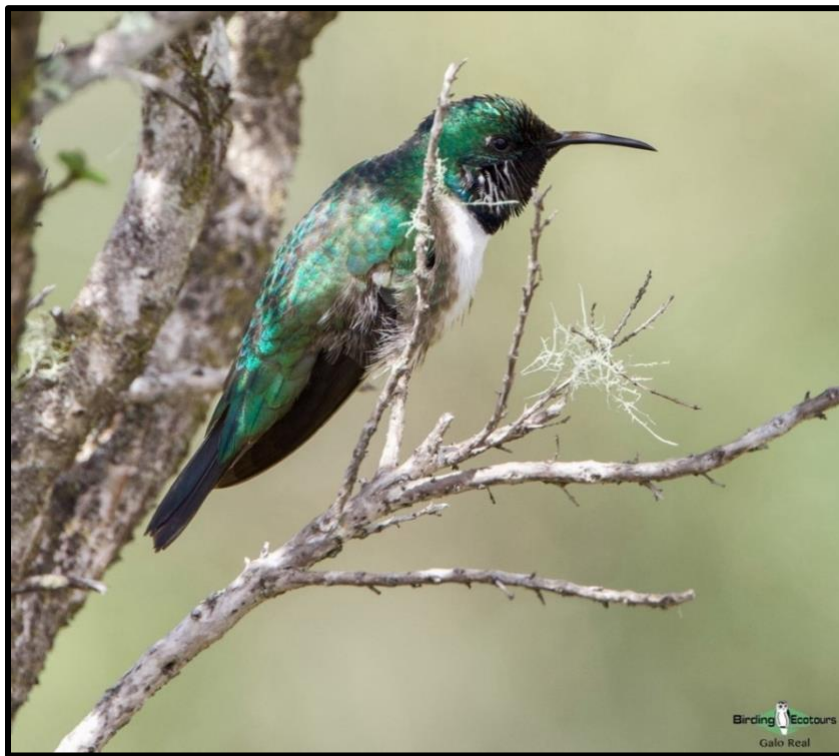
The female Blue-throated Hillstar at Cerro Arcos.

Today was beyond comparison, full of adrenaline and great birding! Our goal was to reach the Cerro Arcos Reserve, home to the Blue-throated Hillstar , a hummingbird endemic to Ecuador that was only recently identified in 2017. The excitement was palpable. The thought of going to a new spot to see a bird that so few people in the world have seen, was exhilarating!