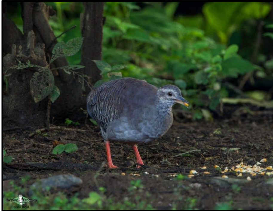
Pale-browed Tinamou proved relatively easy to find.

As the day warmed up and activity slowed a bit, we headed back to the lodge to check out the feeders before lunch. The same Pale-browed Tinamou was hanging out, as well as Amazilia Hummingbirds and White-tipped Doves .