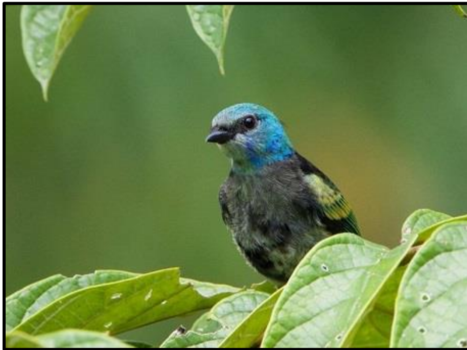
The attractive Blue-necked Tanager .

After a rainstorm that lasted all night, we awoke to find no electricity throughout the lodge. However, there was a warm and delicious breakfast waiting to console us. As we ate, we contemplated our “strategy” for the day. No one felt comfortable making the hike up a slippery hill to see the Jocotoco Antpitta, even though the trail was in good condition. Since the chance of seeing the antpitta in the rain was slim, I suggested flip-flopping our schedule. We decided to try our luck around the town of Valladolid, located 45 minutes by vehicle lower down the slope, around 3,300 feet (1,000 meters) above sea level, and closer to the Peruvian border. The Valladolid River flows into the Marañon River, which is an important tributary of the Amazon. We unanimously agreed to venture down lower, where the storm seemed to have already passed, and check out the Valladolid River Valley.