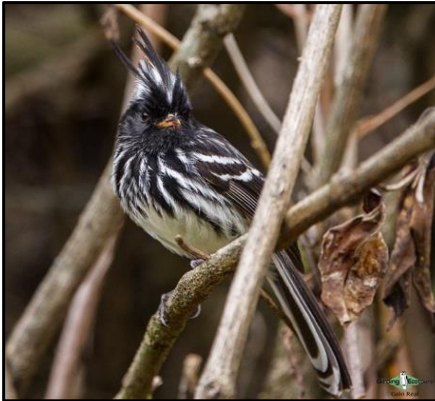
A very obliging Black-crested Tit-Tyrant.