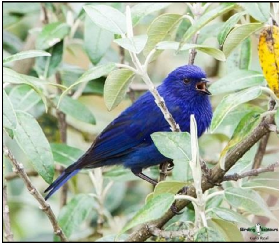
Tit-like Dacnis in the Cajas National Park.

Today, we spent the whole day at Cajas National Park . After breakfast we quickly got into the van and drove to the park entrance, where there is an excellent spot for Tit-like Dacnis , and chances were high that we would see this bird.