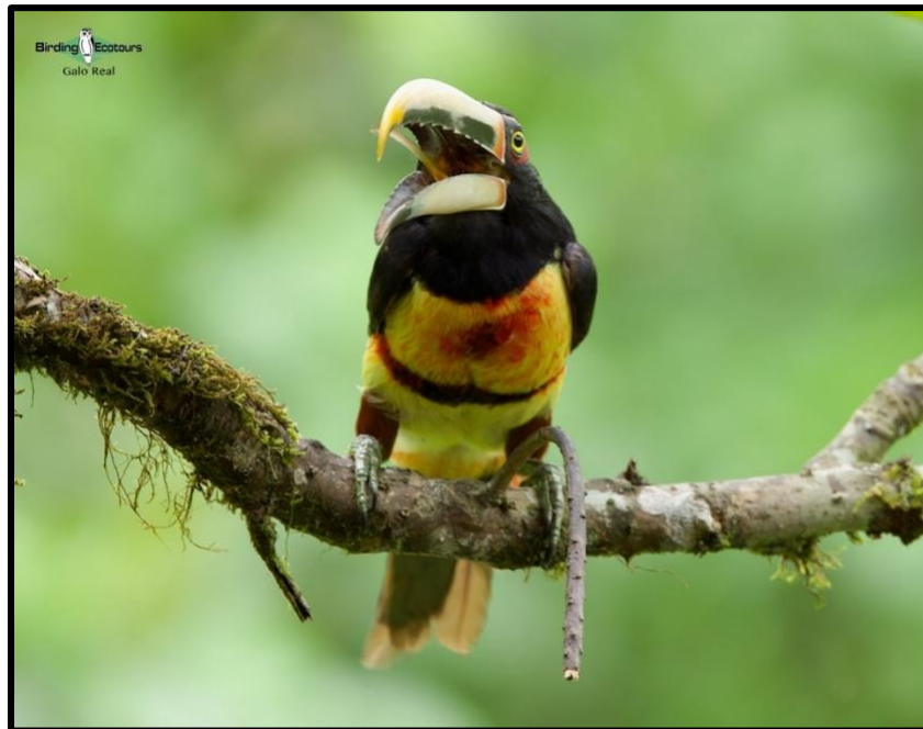
Collared Aracari showed well at feeders.

Instead of heading straight back to the lodge, we walked one of the trails to try our luck in the forest. Although the trail was short, we saw Lemon-rumped Tanager , Azara's Spinetail , Ornate Flycatcher , Golden Tanager and Silver-throated Tanager . Not bad for one morning!