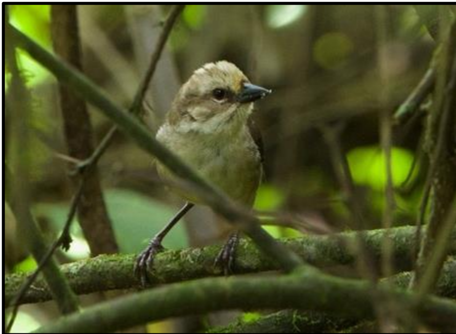
The rare Pale-headed Brushfinch.

Today's objective was to visit Jocotoco's Yunguilla Reserve , established to protect the small remaining habitat of the Pale-headed Brushfinch , and see this endemic species. The hotel was able to provide us with an early breakfast so we could be at the reserve by 7 am. Ángel, the reserve's park ranger, was waiting for us at the main gate. He then led us to where he had put food out for the finch. Within moments, a Grey-browed Brushfinch appeared, and then the Pale-headed Brushfinch ! We couldn't believe it; we hardly had to wait at all. Then, to our surprise, a Chestnut-crowned Antpitta also came in for a bite. Flame-throated Sunangel and Amazilia Hummingbird were visiting the flowers around us.