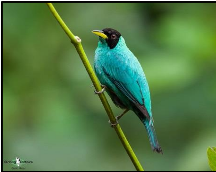
Green Honeycreeper was seen well in the Jorupe Reserve.

This morning we enjoyed a delicious breakfast at the Umbrellabird Lodge and did some further trail birding. Then we packed up and departed for the town of Macara to the Jorupe Reserve , located outside town.