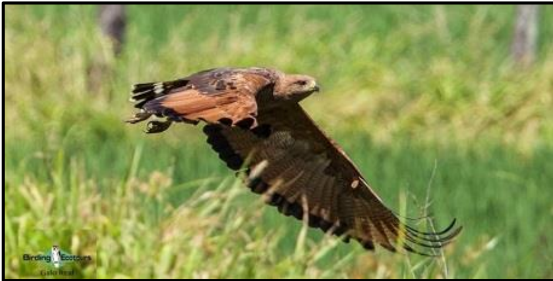
Savanna Hawk near Zapatilo.