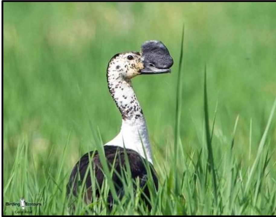
A bizarre male Comb Duck .

At the next spot, we saw Bat Falcon , Scarlet-backed Woodpecker , Pacific Parrotlet , and Boat-billed Flycatcher .