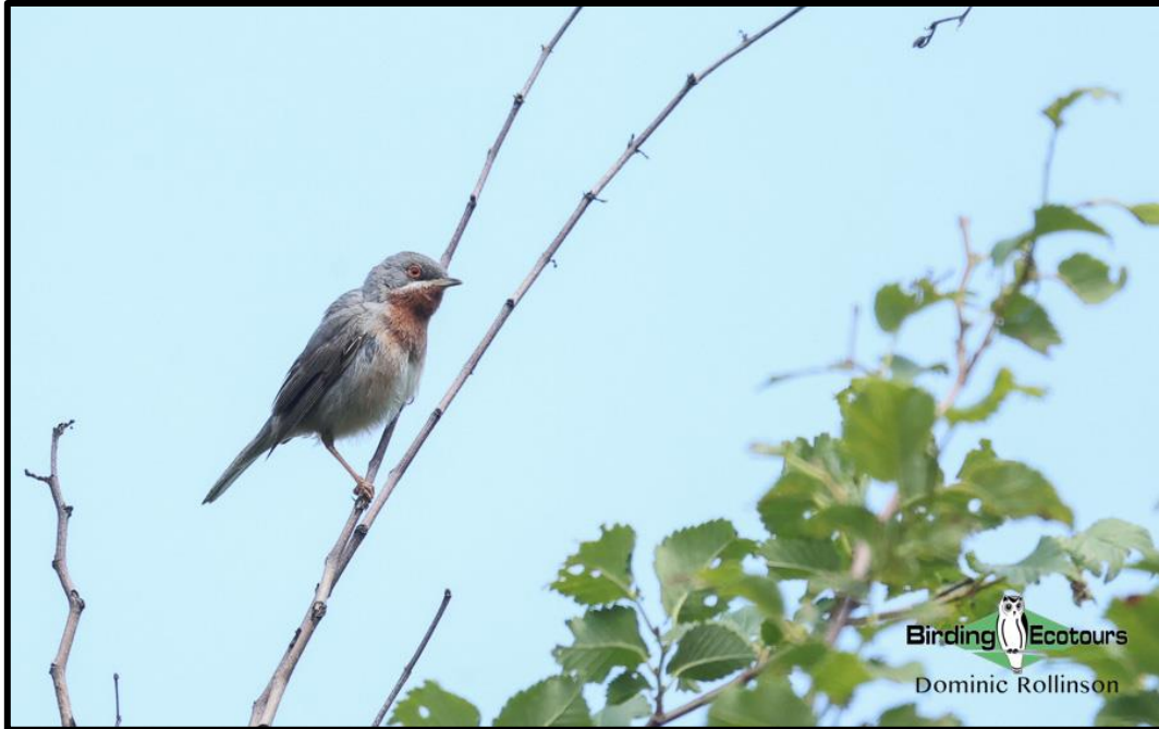
Eastern Subalpine Warblers were abundant in the eastern Rhodope Mountains.