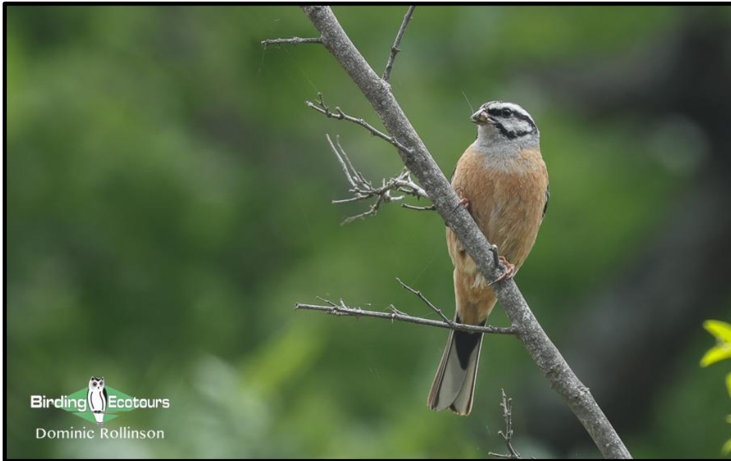
This Rock Bunting put on a show for us at the Madzharovo Crater.

After lunch we had another go at the nuthatches, this time at the traditional Madzharovo Crater area, where we spent a while birding the boulder-strewn slopes hoping for the nuthatch. Yet again, we drew a blank on the nuthatch, but we did find Griffon Vulture , Booted Eagle , Eurasian Hoopoe , Peregrine Falcon , Blue Rock Thrush and Rock, Cirl and Ortolan Buntings .