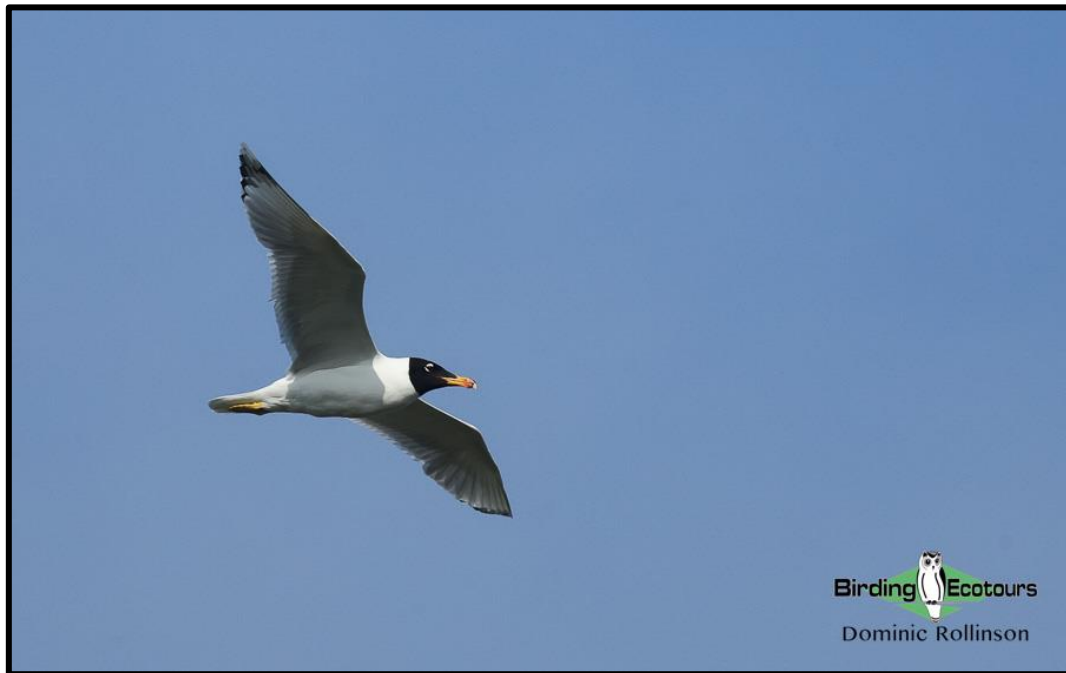
The striking Pallas's Gull was seen well in Romania.

Cormorant, Red-necked and Black-necked Grebes, Black-crowned Night Heron, Purple Heron, Great and Little Egrets, Eurasian Spoonbill, Common Redshank, Black, Common and Whiskered Terns, Caspian, Black-headed, Pallas's and Mediterranean Gulls, Bearded Tit, Western Yellow Wagtail and Common Kingfisher. We also enjoyed watching huge White-tailed Eagles fishing, with Western Marsh Harriers, Red-footed Falcons and Eurasian Hobbies hunting overhead. A stop along the Black Sea coast did not produce too much of interest, besides a few Sandwich and Common Terns passing by.