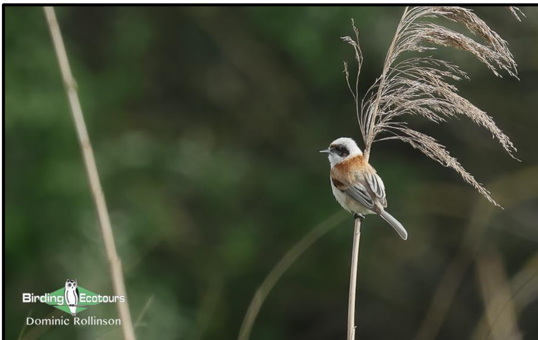
The cute and tiny Eurasian Penduline Tit.

Moving further north, we birded some other wetlands which held Ruddy Shelduck, Common Pheasant, Wood Sandpiper, Glossy Ibis and Eurasian Coot , while the nearby woodlands had Common Nightingale, Spanish Sparrow, Common Linnet and good numbers of Eurasian Turtle Doves . Another nearby marshy area eventually yielded Eurasian Penduline Tit , and Cetti's Warbler was a bit more obliging than before.