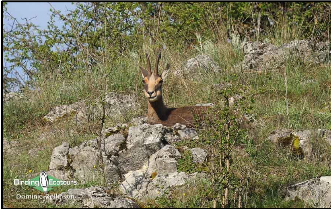
This Northern Chamois watched us in the hills above town.

An early morning walk around town produced more nice sightings of previously seen species and Vickie did well to spot a Northern Chamois , a wild mountain goat, which proved to be the only sighting of the trip.