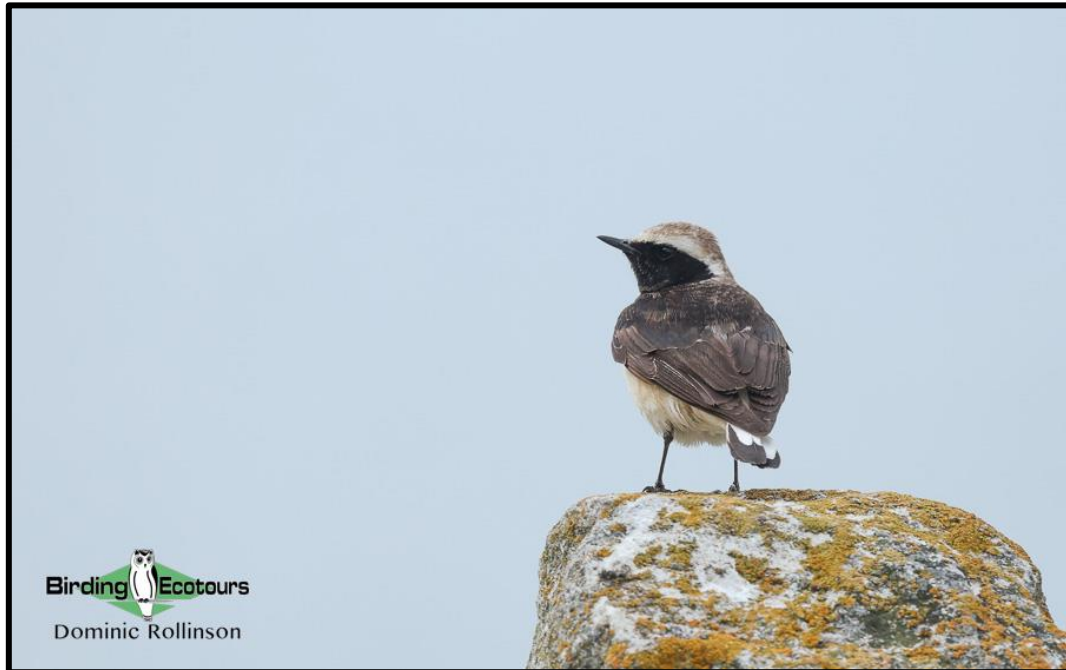
Pied Wheatears were abundant at Cape Kaliakra.

We spent the full day birding the various birding sites around Kavarna, moving between coastal steppes, wetlands and the coast itself. We started the day at Cape Kaliakra, which is a great place to watch migrating birds move by, and soon after we arrived we found a number of migrant passerines hanging around. Highlights of our time at Cape Kaliakra included Black-throated Diver, European Shag, Lesser Grey, Red-backed and Woodchat Shrikes, Eurasian Jay, Red-breasted Flycatcher, Whinchat, Northern and Pied Wheatears and Black-headed Bunting.