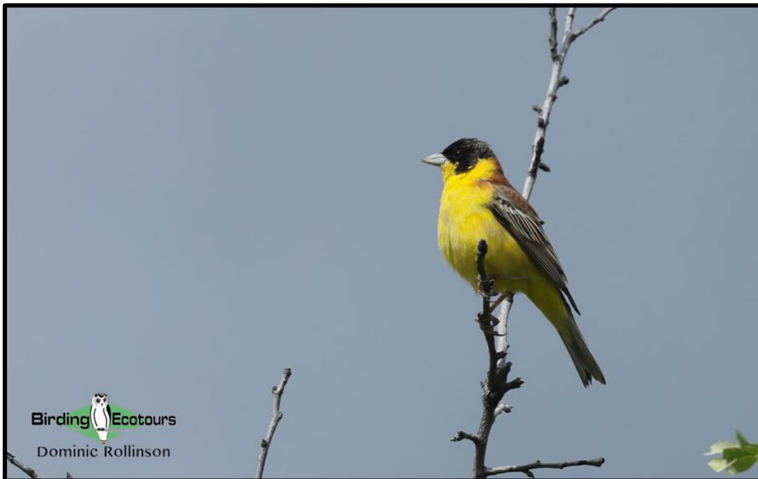
Black-headed Buntings were common in the eastern Rhodope Mountains.

The change in vegetation was quite noticeable here in the eastern Rhodope Mountains; a much drier and sparsely vegetated environment compared to the tall forests of the western Rhodope Mountains. The change in habitat of course meant a change in bird species on offer and we racked up a good selection of new species today. We started our day with a walk along the Krumovgrad River, where we easily found Little Ringed Plover , Black and White Storks , Syrian and Black Woodpeckers , Eurasian Hobby , Lesser Grey Shrike , Eastern Olivaceous Warbler , Barred Warbler , Common Whitethroat , Common Nightingale and Black-headed Bunting .