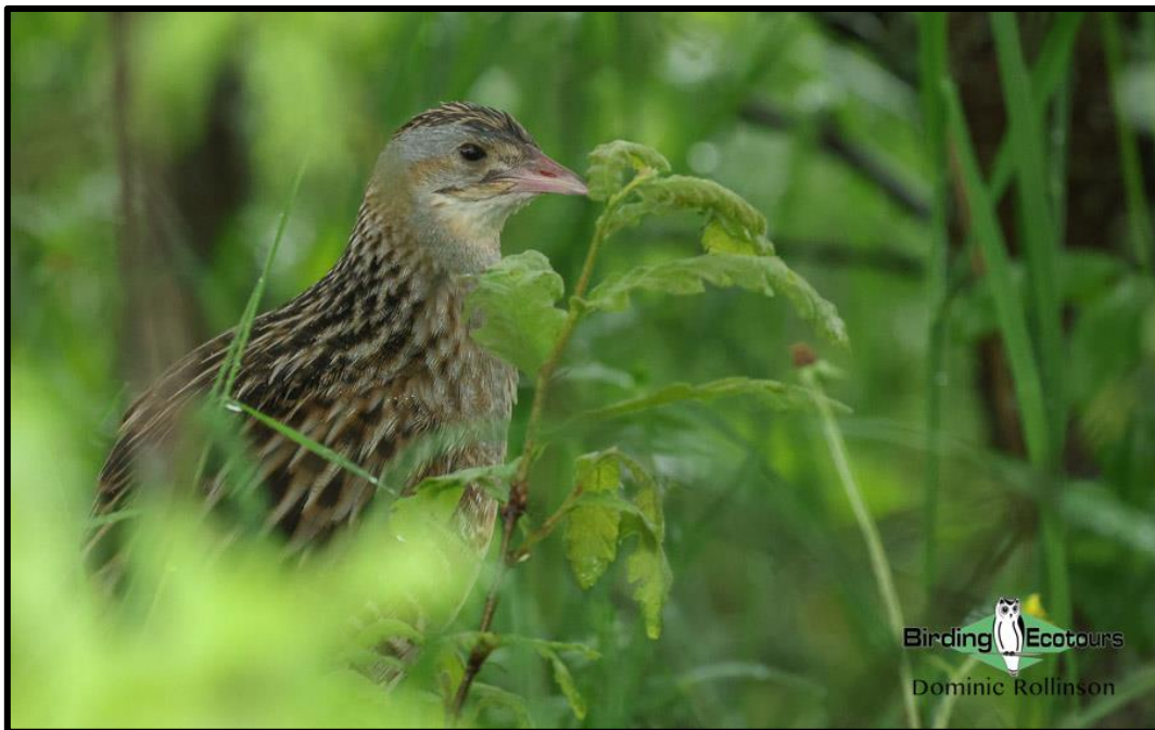
The tour started with a bang with this showy Corn Crane .

We then headed back down Mount Vitosha and steadily made our way south and into the western Rhodope Mountains. Before reaching the mountainous areas with their tall conifer forests, we birded some farmlands where we had superb views of a calling Corn Crane and also got our first looks at Common Woodpigeon , Common Cuckoo and Corn Bunting .