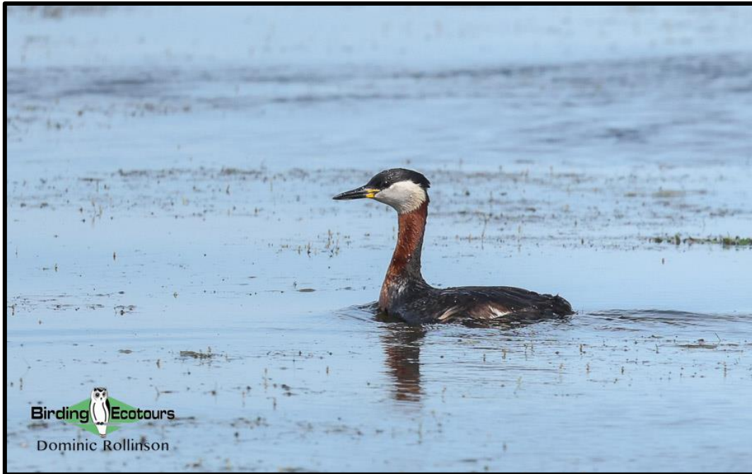
Red-necked Grebes were seen in the lakes of the Danube Delta.

As we continued to make our way south, we stopped in at the impressive Enisala Fortress, which is perched up on an imposing hill. The fortress was built in the 14 th century by Genovese merchants who used it to oversee the movement of enemy troops, both at sea and on land. There were some nice birds around here, such as Great Egret , European Bee-eater , Northern Wheatear and White Wagtail .