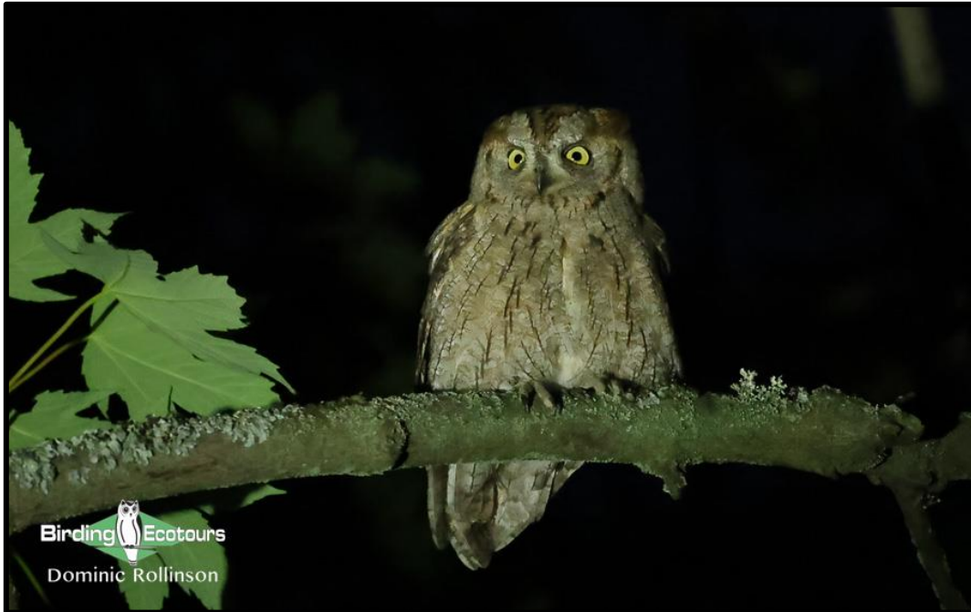
Eurasian Scops Owl proved easy to locate in Krumovgrad.

Later that evening, after dinner, we took a walk to a nearby park which produced the hoped-for Eurasian Scops Owl within a minute of starting our search. The whole operation took about 15 minutes, from leaving our hotel to getting back to our hotel!