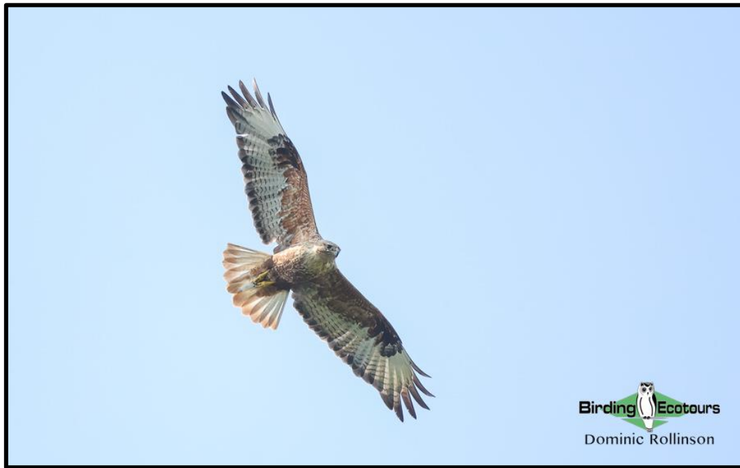
Long-legged Buzzards were widespread in Bulgaria and Romania.

fantastic day. Our final night was in a lovely hotel, right on the edge of town, overlooking wheatfields, with Common Quail calling away (but, of course, not revealing themselves).