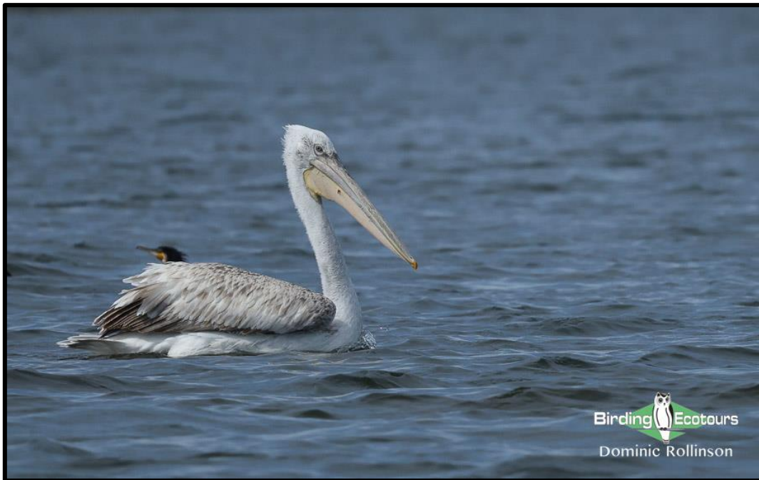
Huge Dalmatian Pelicans were abundant in wetlands of Bulgaria and Romania.

From the eastern Rhodope Mountains we carried on eastwards to the Black Sea coast where we enjoyed some fantastic coastal and wetland birding with highlights including Dalmatian Pelican , Garganey , Spotted Redshank , Eurasian Penduline Tit and Bearded Reedling .