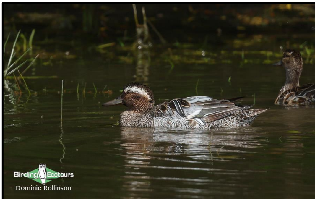
Garganey proved rather abundant and, at times confiding, on this tour.

We then headed back to Sozopol for a late breakfast, after which we spent the rest of the morning birding nearby wetlands which held Great White and Dalmatian Pelicans , Garganey , Gadwall , Common Pochard , Pygmy Cormorant , White-tailed Eagle , Eurasian Hobby and Great Reed Warbler .