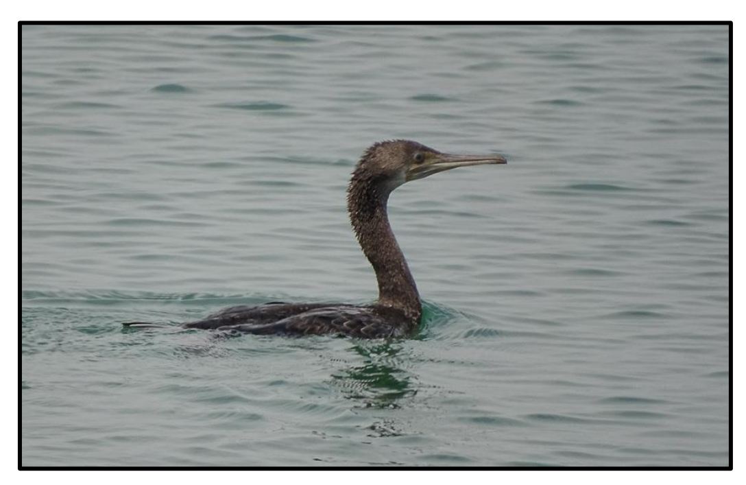
Socotra Cormorant will likely be seen on our pelagic trip.

After breakfast, we drive west to Qalansiya, a traditional Socotri fishing town and the second largest town on the island after the capital, Hadibu. The beach next to this town is stunning, often described as Socotra's most idyllic beach due to its bright turquoise waters and alluring white sand, in every direction. Here we board a boat in our quest for rare seabirds that breed in the area, with the rangerestricted Socotra Cormorant, Jouanin's Petrel, and Persian Shearwater as our main targets. Sooty Gull, Lesser Black-backed Gull, Brown Noddy, and Brown Booby are common in the area, and we will be on the lookout for some rarer migrants that might be passing through, such as Red-necked Phalarope, Red-billed Tropicbird, Wilson's Storm Petrel, and Bridled, Gullbilled, Caspian, Great Crested, Lesser Crested, Common and Sandwich Terns. Large groups of Spinner Dolphins are often seen, while other dolphin species, turtles, rays, and whales are all possibilities during the trip.