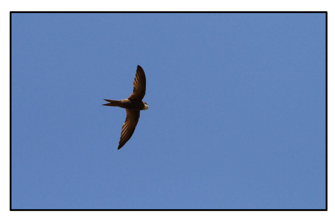
Forbes-Watson's Swift is best sought on Socotra.