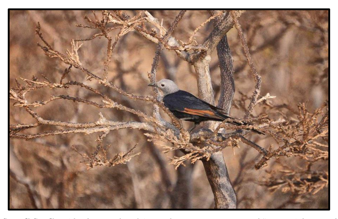
Somali Starling (this being a female) is a characteristic species of Socotra.