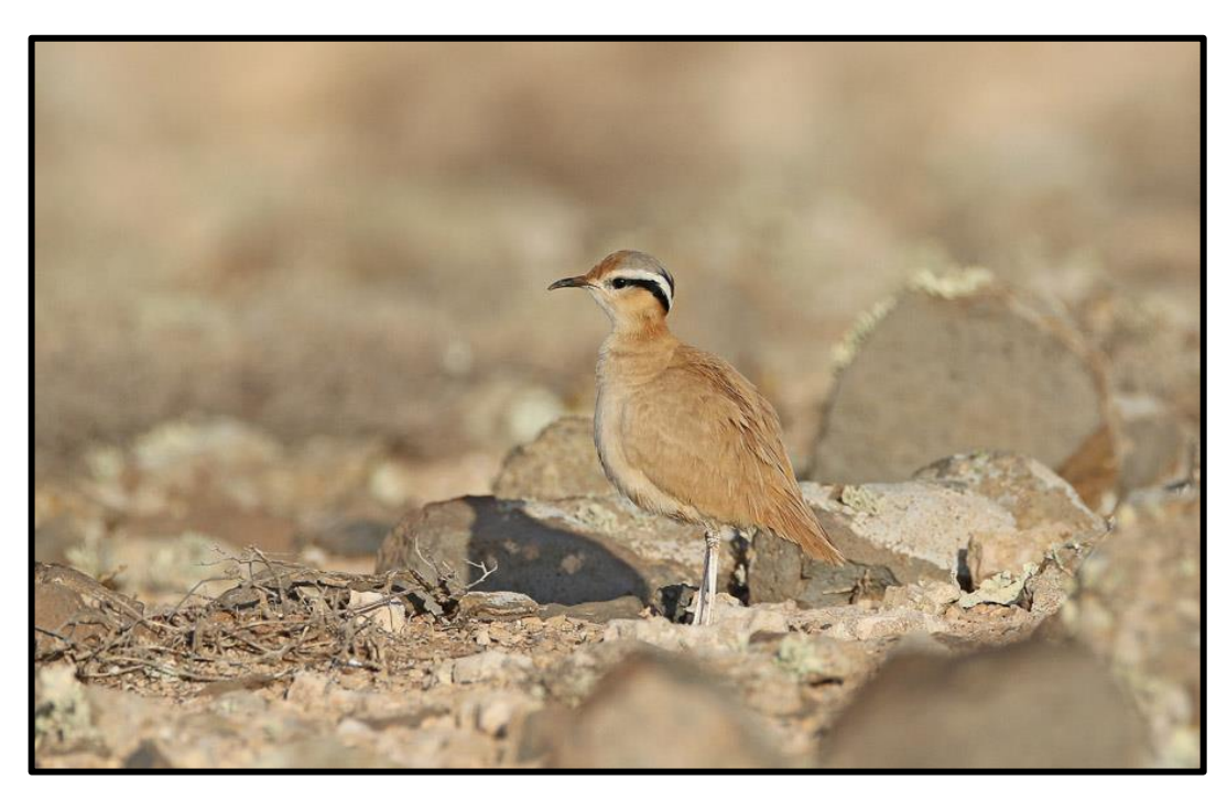
Cream-colored Courser may be seen in the desert environment.

We continue birding across Socotra, discovering the more remote parts of the island in the south and east. We will spend time looking for our final endemic, the Socotra Cisticola, in the coastal lowlands, where it forages in low bushes and scrub. We will explore several infrequently visited wetland sites, such as Quryah lagoon, which are attractive areas for migratory species. The number of species which have been recorded on passage in Socotra is high and includes some which might seem out of place on a desert island! We could encounter a range of waterbirds including Greater and Lesser Flamingos, Spotted Crake, Indian Pond Heron, Black-crowned Night Heron, Squacco Heron, Great Egret, Glossy Ibis, Eurasian Curlew, Eurasian Whimbrel, Common Greenshank, Dunlin, Curlew Sandpiper, Common Snipe, Pacific Golden Plover, Northern Shoveler, and Northern Pintail. We will also encounter landbirds such as Eurasian Roller, Bluecheeked Bee-eater, Eurasian Golden Oriole, European Turtle Dove, Common Cuckoo, Greater Short-toed Lark, Bluethroat, and Western Yellow Wagtail. Socotra Sunbird, Socotra Warbler, Socotra Starling, Socotra Sparrow, Socotra White-eye, and Somali Starling should be abundant, providing good opportunity for photographing these species.