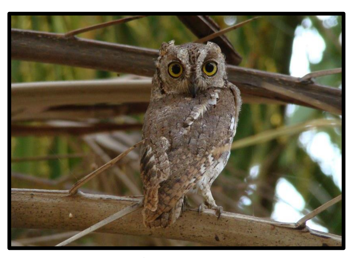
We hope to find Socotra Scops Owl at a day roost during our tour.

27 OCTOBER – 04 NOVEMBER 2025 26 OCTOBER – 03 NOVEMBER 2026