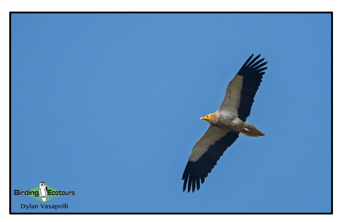
Socotra holds the highest concentration of Egyptian Vultures in the Middle East.